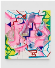
Joanne Greenbaum Untitled, 2023 oil, acrylic, flashe and marker on canvas 190.5 x 165 cm 75 x 65 in (JG/P 4)