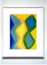
Marina Adams 16x12_244, 2024 gouache and crayon on Arches aquarelle 40.6 x 30.5 cm 16 x 12 in framed: 48.5 x 58.5 x 4 cm (MAA/P 18)