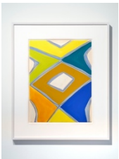
Marina Adams 16x12_216, 2023 gouache and crayon on Arches aquarelle 40.6 x 30.5 cm 16 x 12 in framed: 48.5 x 58.5 x 4 cm (MAA/P 15)