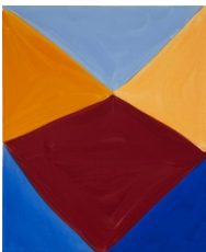
Marina Adams SongLines 43, 2023 acrylic on linen 61 x 50.8 cm 24 x 20 in (MAA/P 22)