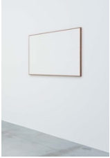
Anne Truitt Arundel XXVIII, 1975 Acrylic and graphite on canvas 78 x 113 cm 30 3/4 x 44 1/2 in framed: 80 x 114 X 3 cm