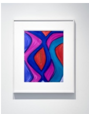
Marina Adams 16x12_226, 2023 gouache and crayon on Arches aquarelle 40.6 x 30.5 cm 16 x 12 in framed: 48.5 x 58.5 x 4 cm (MAA/P 16)