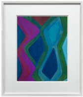
Marina Adams 16x12_245, 2024 gouache and crayon on Arches aquarelle 40.6 x 30.5 cm 16 x 12 in framed: 48.5 x 58.5 x 4 cm (MAA/P 19)