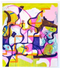
Joanne Greenbaum Untitled, 2024 ink, oil, acrylic, flashe and marker on canvas 213.4 x 182.9 cm 84 x 72 in (JG/P 6)