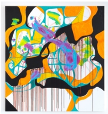
Joanne Greenbaum Untitled, 2024 flashe, oil, acrylic and marker on canvas 177.8 x 165.1 cm 70 x 65 in (JG/P 7)