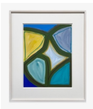
Marina Adams 16x12_221, 2023 gouache and crayon on Arches aquarelle 40.6 x 30.5 cm 16 x 12 in framed: 48.5 x 58.5 x 4 cm (MAA/P 17)