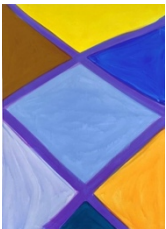
Marina Adams Shifting Winds, 2024 acrylic on linen 177.8 x 127 cm 70 x 50 in (MAA/P 21)