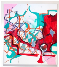
Joanne Greenbaum Untitled, 2024 ink, oil, acrylic, flashe and marker on canvas 213.4 x 182.9 cm 84 x 72 in (JG/P 5)