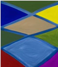
Marina Adams HeartLand, 2023 acrylic on linen 172.7 x 147.3 cm 68 x 58 in (MAA/P 14)