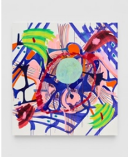
Joanne Greenbaum Untitled, 2022 oil, acrylic, flashe and marker on canvas 190.5 x 165 cm 75 x 65 in (JG/P 3)