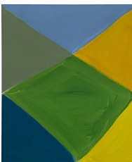
Marina Adams SongLines 45, 2024 acrylic on linen 61 x 50.8 cm 24 x 20 in (MAA/P 23)