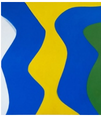
Marina Adams BirdDance, 2024 acrylic on linen 198.1 x 172.7 cm 78 x 68 in (MAA/P 20)