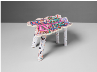
Kerstin Brätsch: Fossil Psychic table model , 2022, Cardboard, paper, hotglue table models, scale: 1:5 © the artist, documenta und Museum Fridericianum gGmbH, photo: Nicolas Wefers