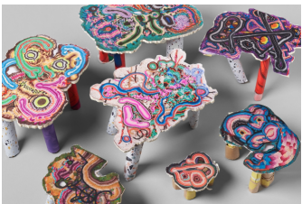
Kerstin Brätsch: Fossil Psychics table models , 2022, Cardboard, paper, hotglue, table models, scale: 1:5 © the artist, documenta und Museum Fridericianum gGmbH, photo: Nicolas Wefers