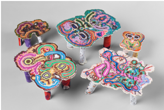
Kerstin Brätsch: Fossil Psychics table models , 2022, Cardboard, paper, hotglue table models, scale: 1:5 © the artist, documenta und Museum Fridericianum gGmbH, photo: Nicolas Wefers