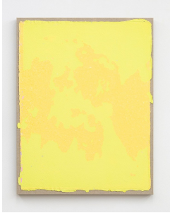
Abdolreza Aminlari Untitled (24.008) , 2024 Handmade abaca and cotton paper on linen 30 x 23 1/2 inches