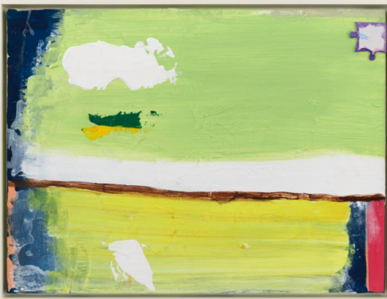
Walter Price, So much intellectual work to remain wrong , 2020. Private collection, New York.