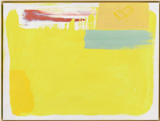
Walter Price, Square. Box. A foundation of intellectualism , 2020. Courtesy the artist and Greene Naftali, New York.