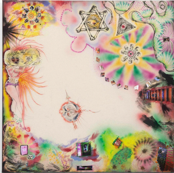
Abella D'Adamo , "Gyaru Lover Nightmare", 2023 Acrylic paint, textas, photographic print, glue, glitter, watercolour and oil pastel on canvas, 100 X 100 cm