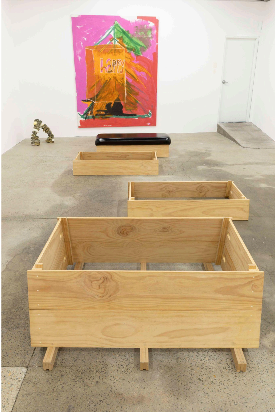
Emryn Ingram-Shute , "He Had Short Shorts and a Blonde Moustache", 2021 Pine, foam and black PVC stretch material, 135 x 98 x 140 cm (assembled) Courtesy of Dominik Mersch Gallery