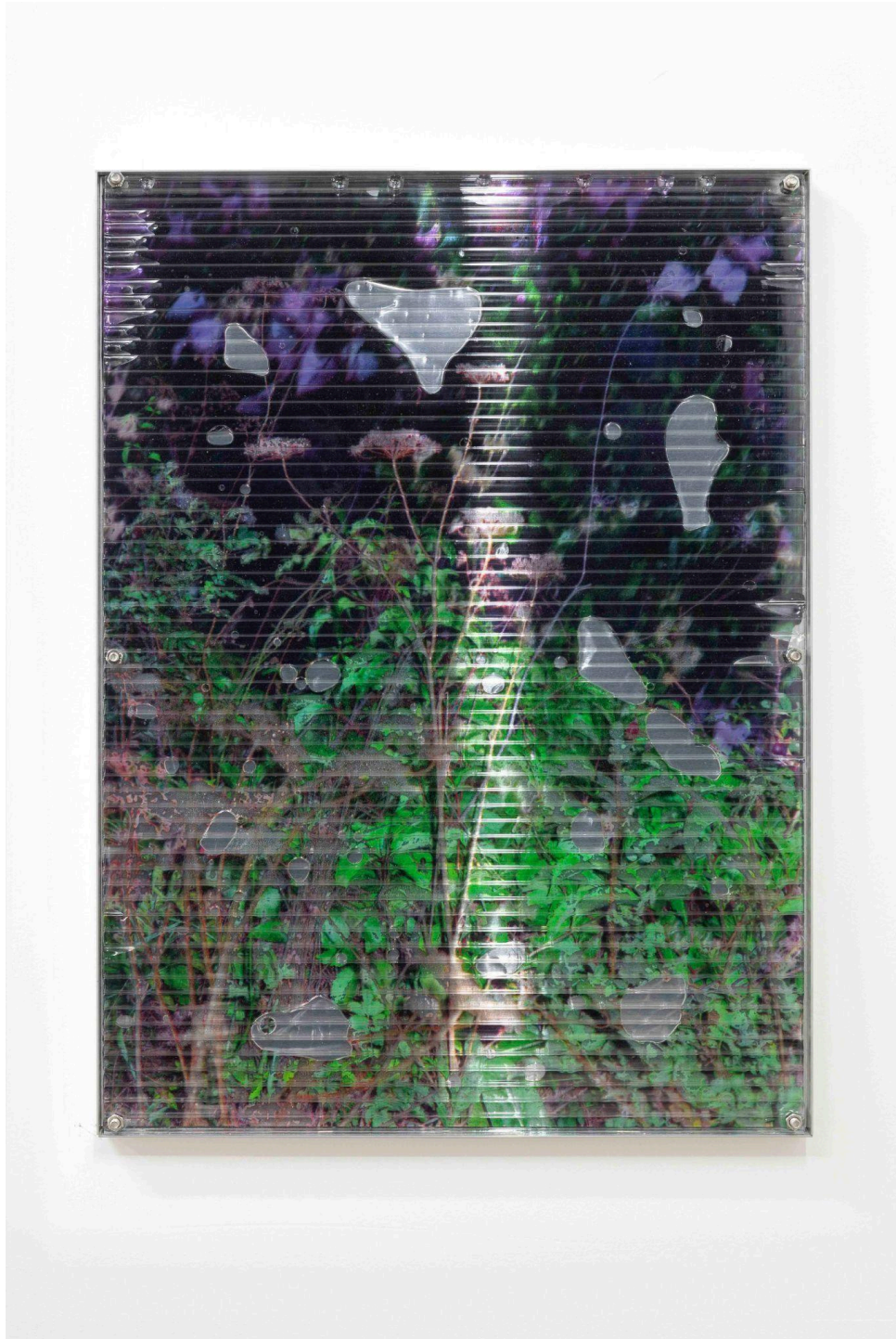
Taylor Steel , "why did you choose tonight to haunt me?", 2024 Polycarbonate, epoxy resin, toner, clear film, aluminium composite panel, stainless steel, and aluminium frame, 61.5 x 45.5 cm