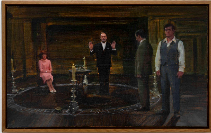
Bridget Stehli , "The Circle", 2024 Oil on canvas, artist-made frame, 26.5 x 42.5 cm