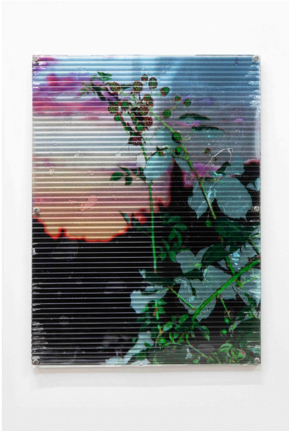
Taylor Steel , "loverboy (open your mouth)", 2024 Polycarbonate, epoxy resin, toner, clear film, aluminium composite panel and stainless steel, 61.5 x 45 cm