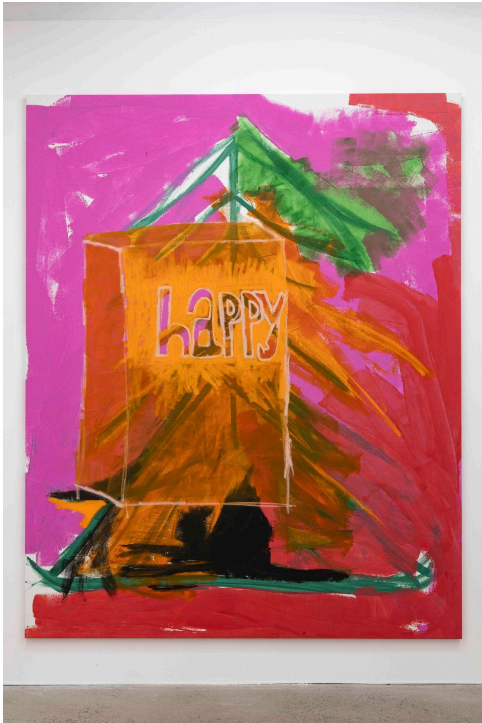
Grace Anderson , "Happy", 2024 Acrylic, oil and oil stick on linen, 250 x 200 cm