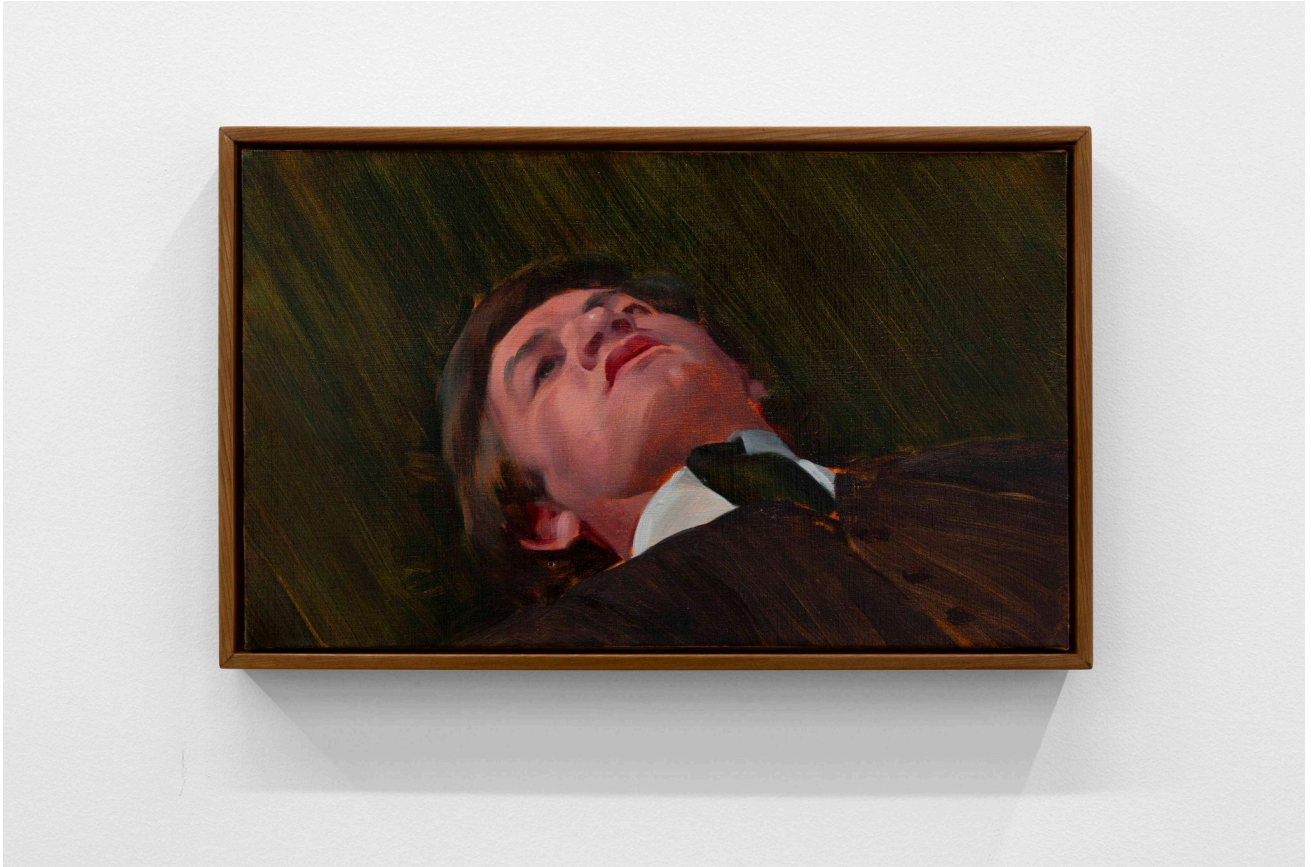
Bridget Stehli , "Black Magic", 2024 Oil on canvas, artist-made frame, 26.5 x 42.5 cm