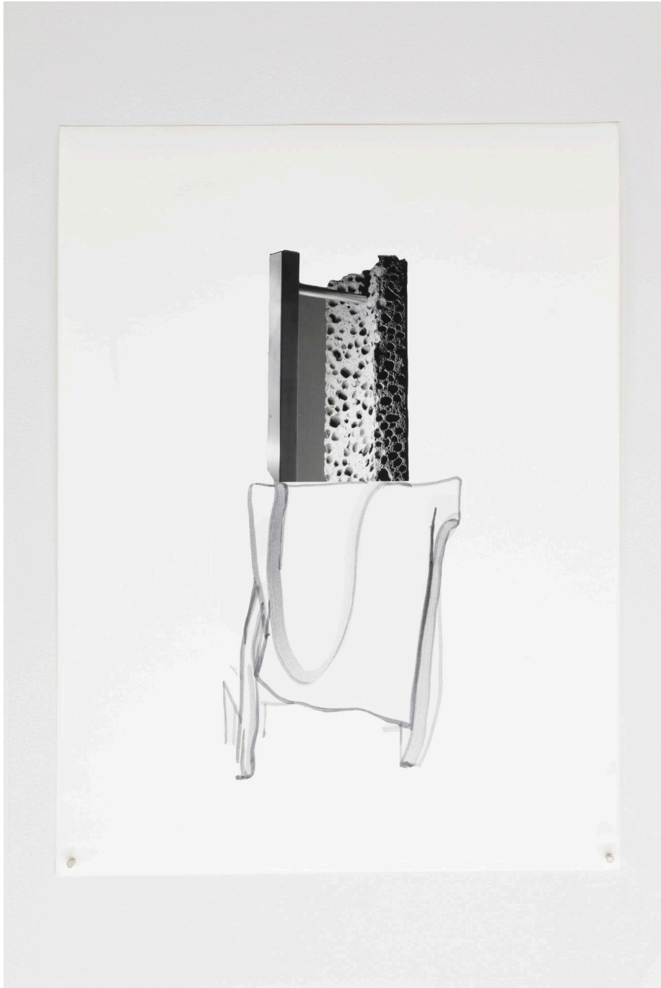
Emily Taylor , "Fabricated Air (Aluminium Foam)", 2024 Inkjet print on Ilford Smooth Cotton Rag Paper, 59.4 × 79.1 cm Edition of 5 + 1 AP