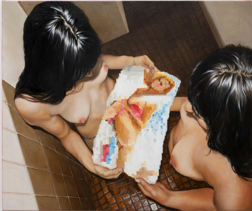
Adele Warner , "untitled (penthouse vista)", 2024 Oil on canvas, 76.5 x 91.5 cm