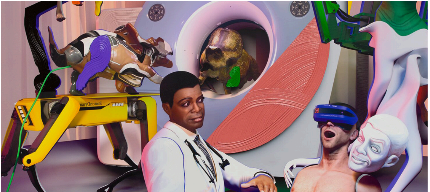
Karen is Sharon (Rigged #24), 2023 Öl, Acryl und Inkjet Druck auf Leinwand 147 x 166 cm Courtesy der Künstler