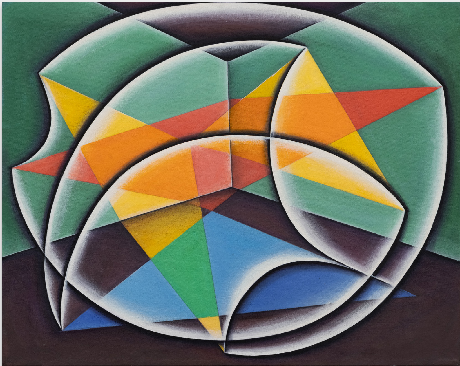
Lydia Okumura Untitled , 2000 oil paint on canvas 50,8 x 63,5 cm 20 x 25 in