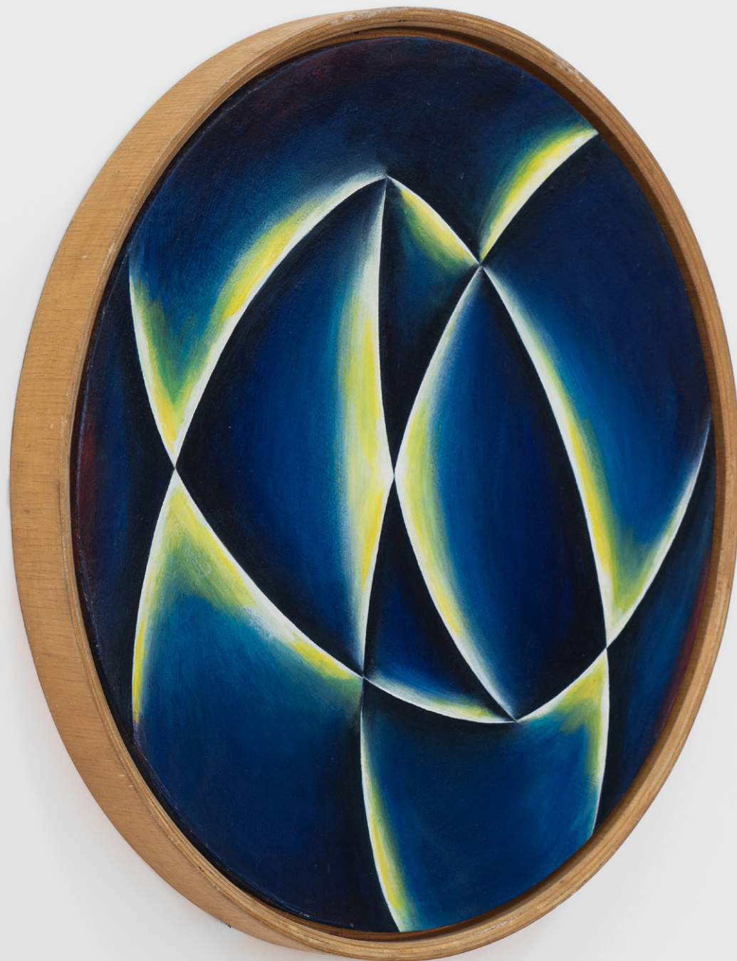
Lydia Okumura Circum, NYC, 2003 acrylic paint on canvas unique ø 60 cm ø 23,6