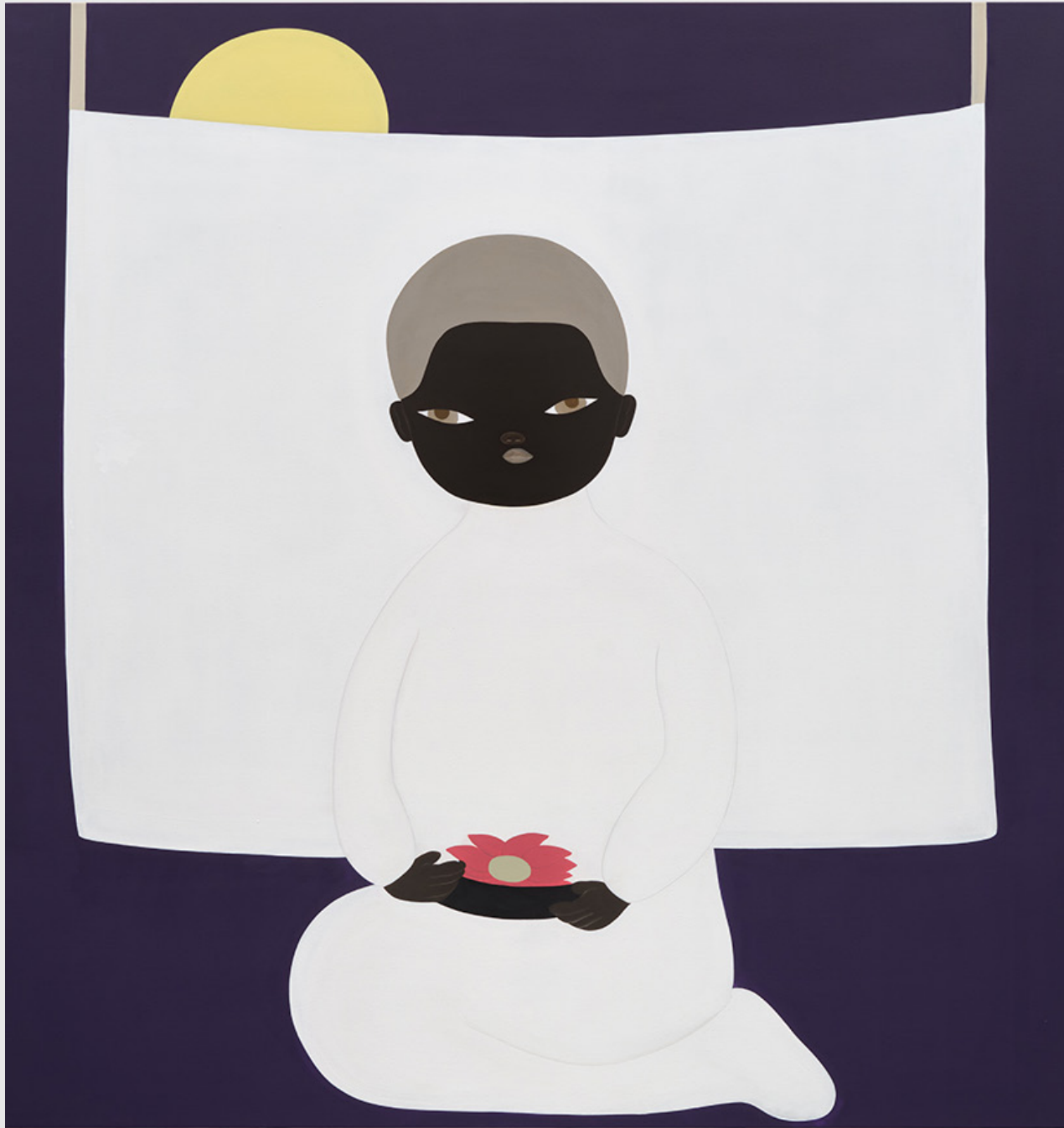
Asuka Anastacia Ogawa Akai Hana, Murasaki , 2024 acrylic paint on canvas 183,5 x 178,4 x 4,1 cm 72.2 x 70.2 x 1.6 in