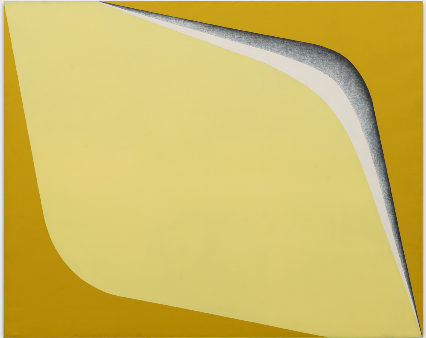
Tomie Ohtake Untitled , 1983 acrylic paint on canvas 200 x 251 x 4 cm 78.7 x 98.8 x 1.6 in