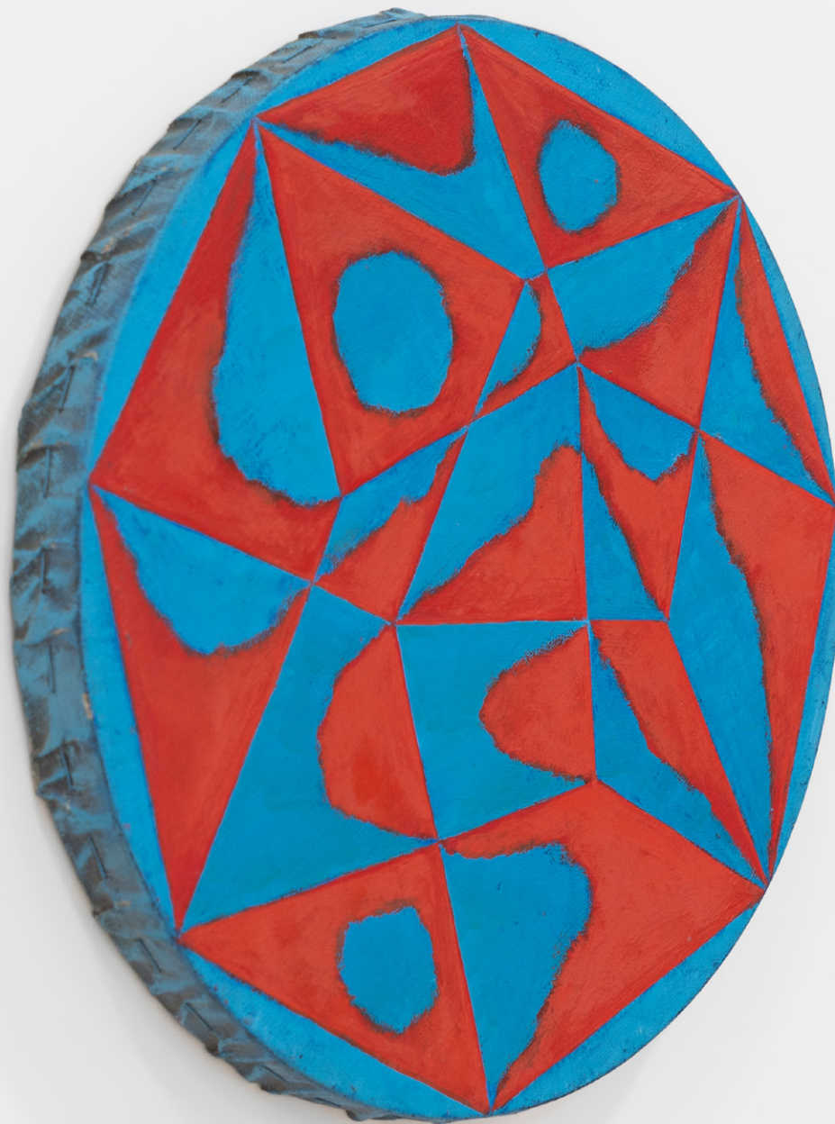
Lydia Okumura Red and Blue III, NYC, 2001 oil paint on linen unique ø 30,5 cm ø 12 in