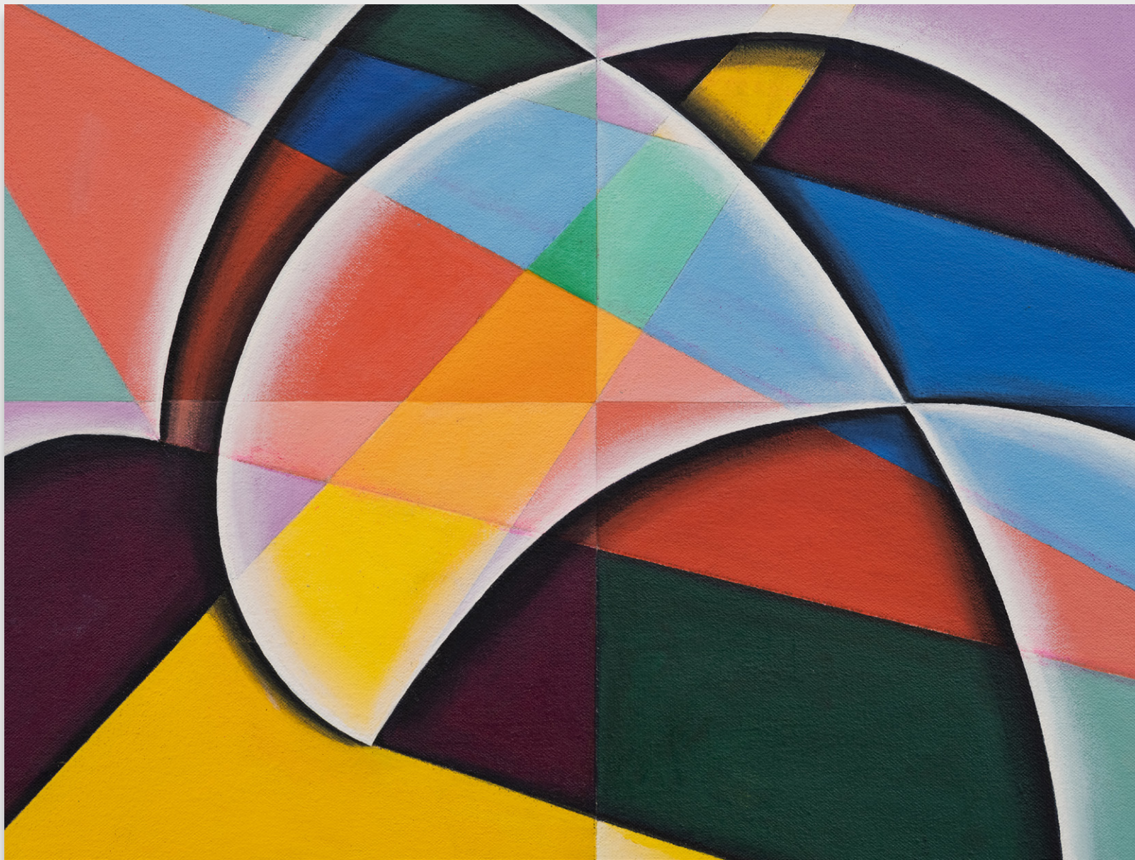
Lydia Okumura Untitled , 2000 oil paint on canvas 50,8 x 63,5 cm 20 x 25 in