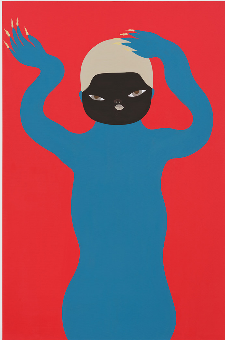
Asuka Anastacia Ogawa Candle fingers , 2024 acrylic paint on canvas 182,9 x 121,9 x 3,8 cm 72 x 48 x 1.5 in