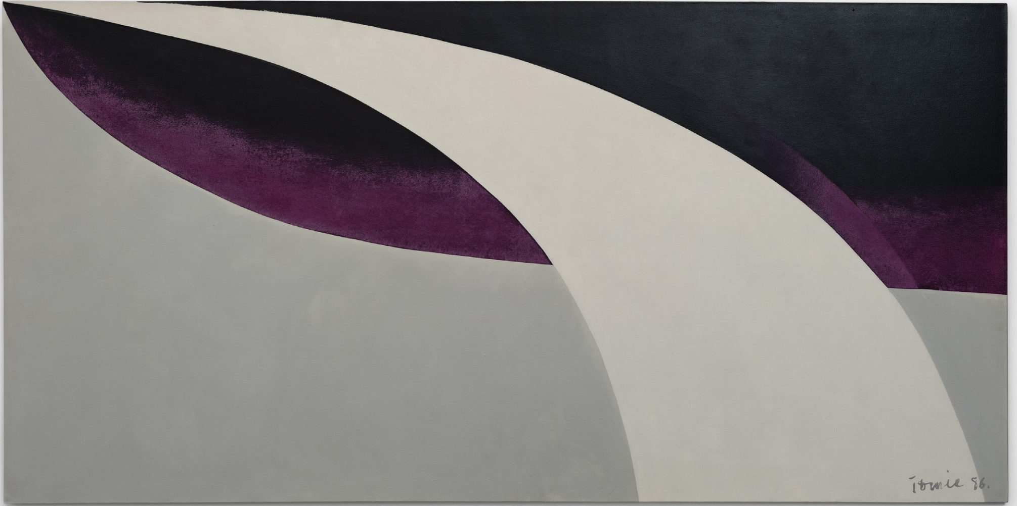
Untitled , 1886 oil paint on canvas 135 x 270 cm 53.1 x 106.3 in