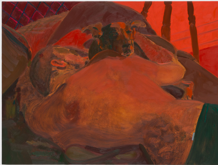
The dreamer ii 2024

Oil on board 76.2 x 101.6 cm | 30 x 40 in