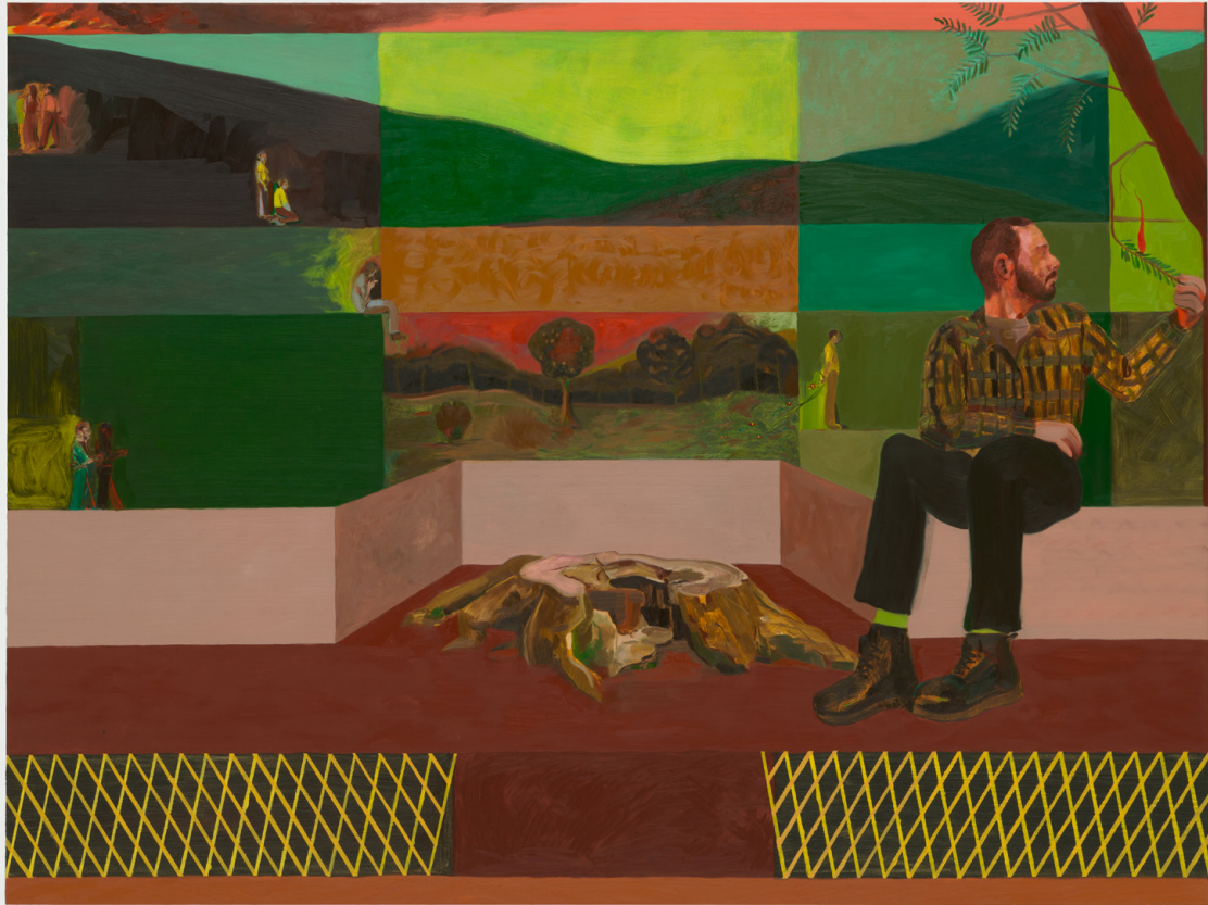
The Arsonist iii 2024

Oil on linen 182.9 x 243.8 cm | 72 x 96 in