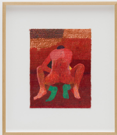
Color pencil on paper, framed Left: 37.8 x 29.2 cm | 14 7/8 x 11 1/2 in Right: 36.8 x 31.8 cm | 14 1/2 x 12 1/2 in