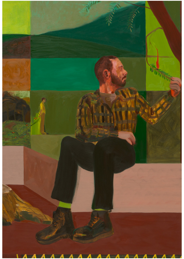
Detail | The Arsonist iii , 2024

The titles selected for each show correspond to two well-known idioms, with Cudahy interpreting the role of 'the fool' as somewhat alike to being an artist. A 'fool's errand' describes the assignment of an impossible task to someone oblivious to the fact that their efforts will be fruitless.