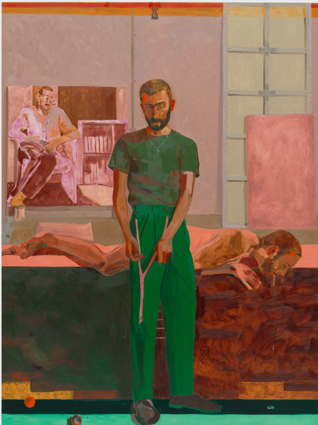
Dowsing (studio) 2024

Oil on linen 243.8 x 182.9 cm | 96 x 72 in