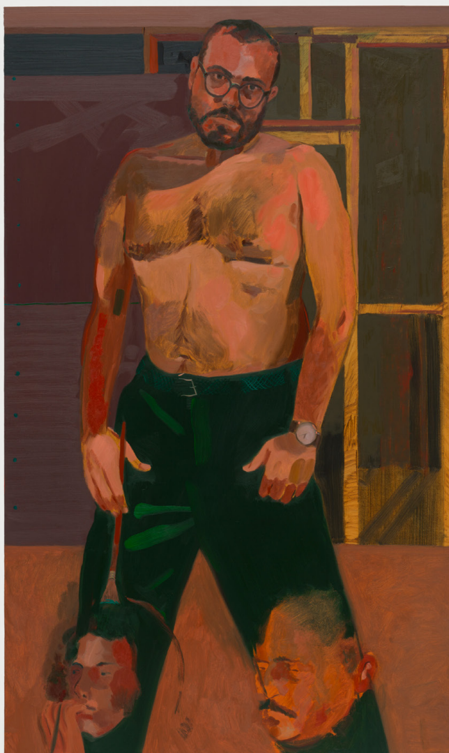
Self-portrait with parents 2024

Oil on linen 152.4 x 91.4 cm | 60 x 36 in