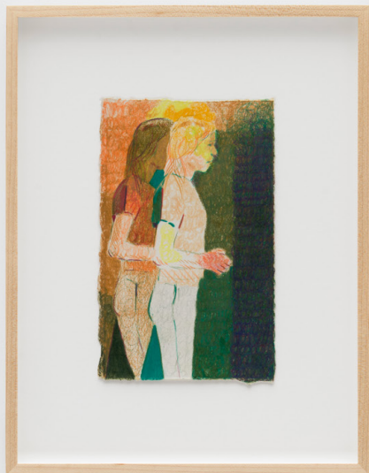
2 + shadow , 2024 green socks , 2024