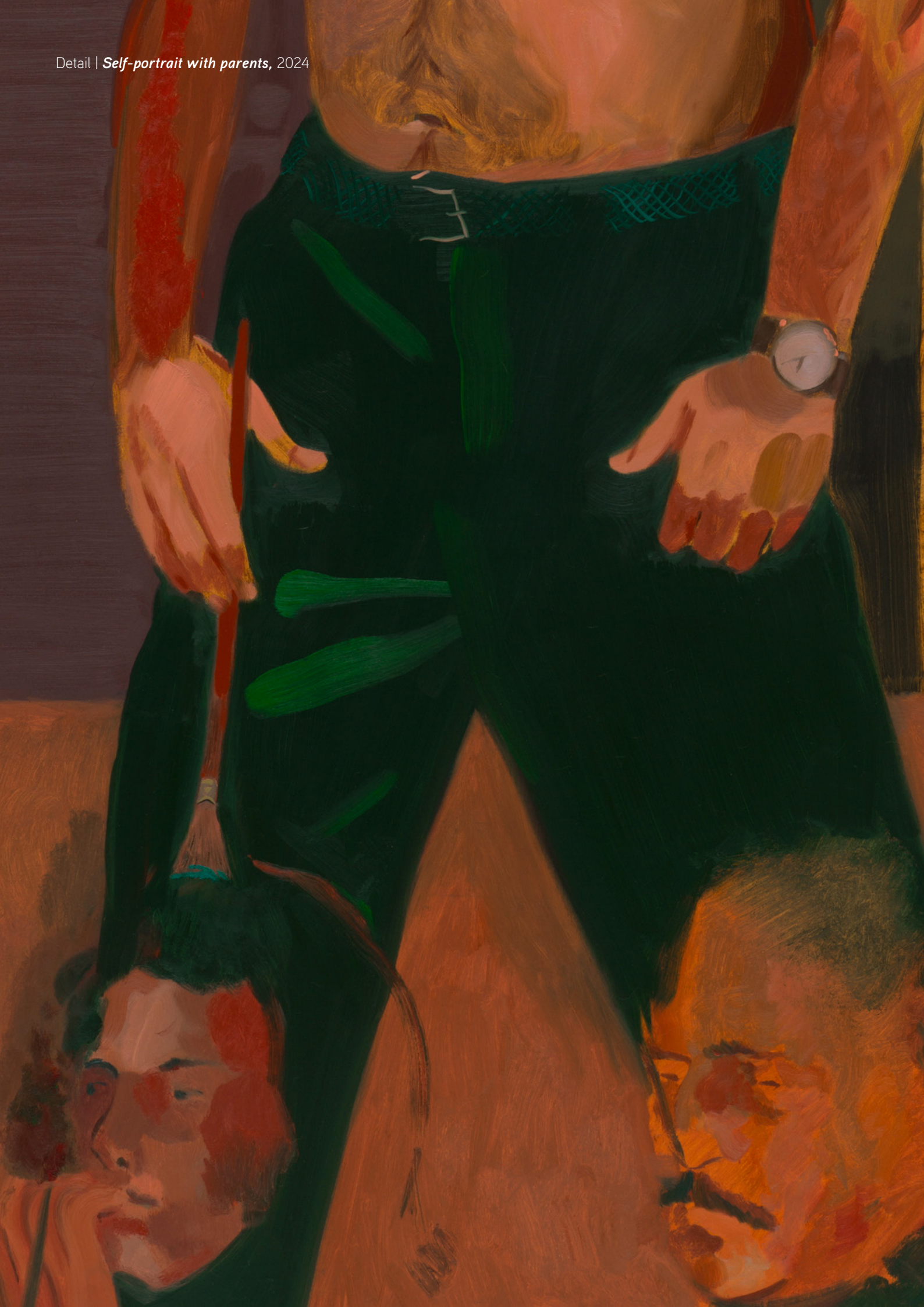
Detail | Self-portrait with parents , 2024