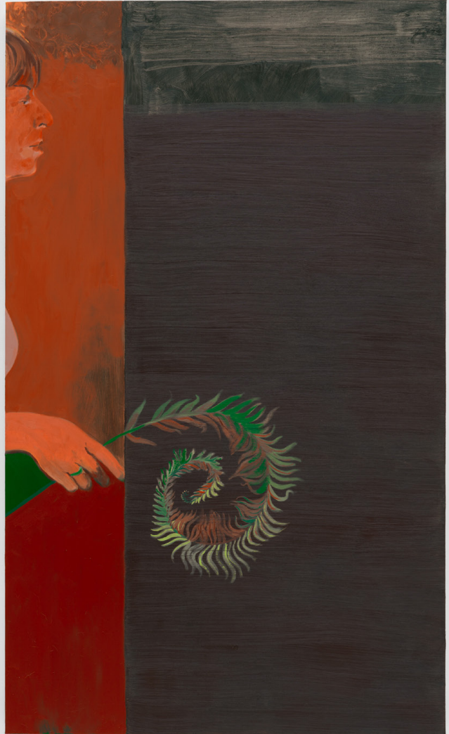
Charlie doubled (fern spiral) 2024

Oil on linen, two panels Left: 152.4 x 61 cm | 60 x 24 in Right: 152.4 x 91.4 cm | 60 x 36 in