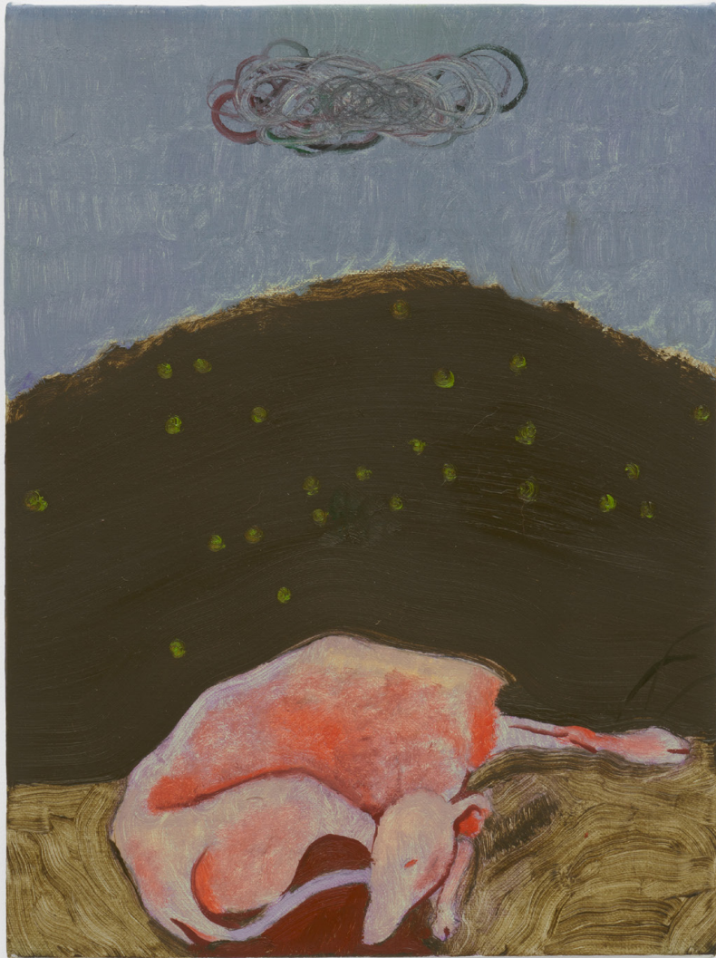
Dog and Knot 2024