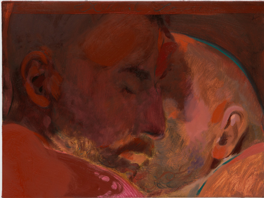
Eternal Lovers 2024

Oil on linen 30.5 x 40.6 cm | 12 x 16 in