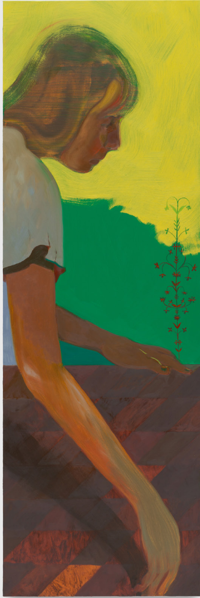
Mutating plant 2024