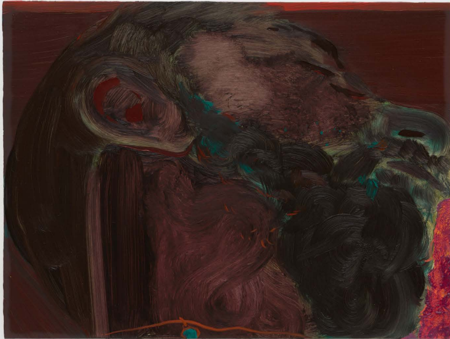
The dreamer 2024