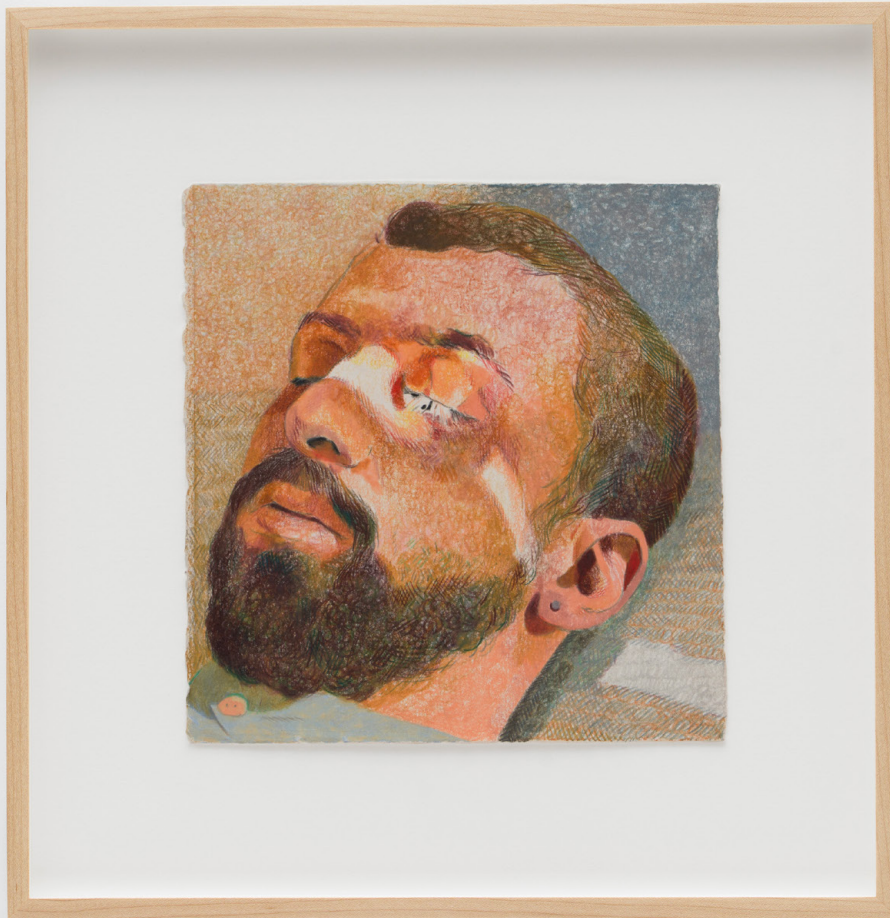
Ian (band of sun) 2024

Color pencil on paper, framed 38.7 x 37.8 cm | 15 1/4 x 14 7/8 in