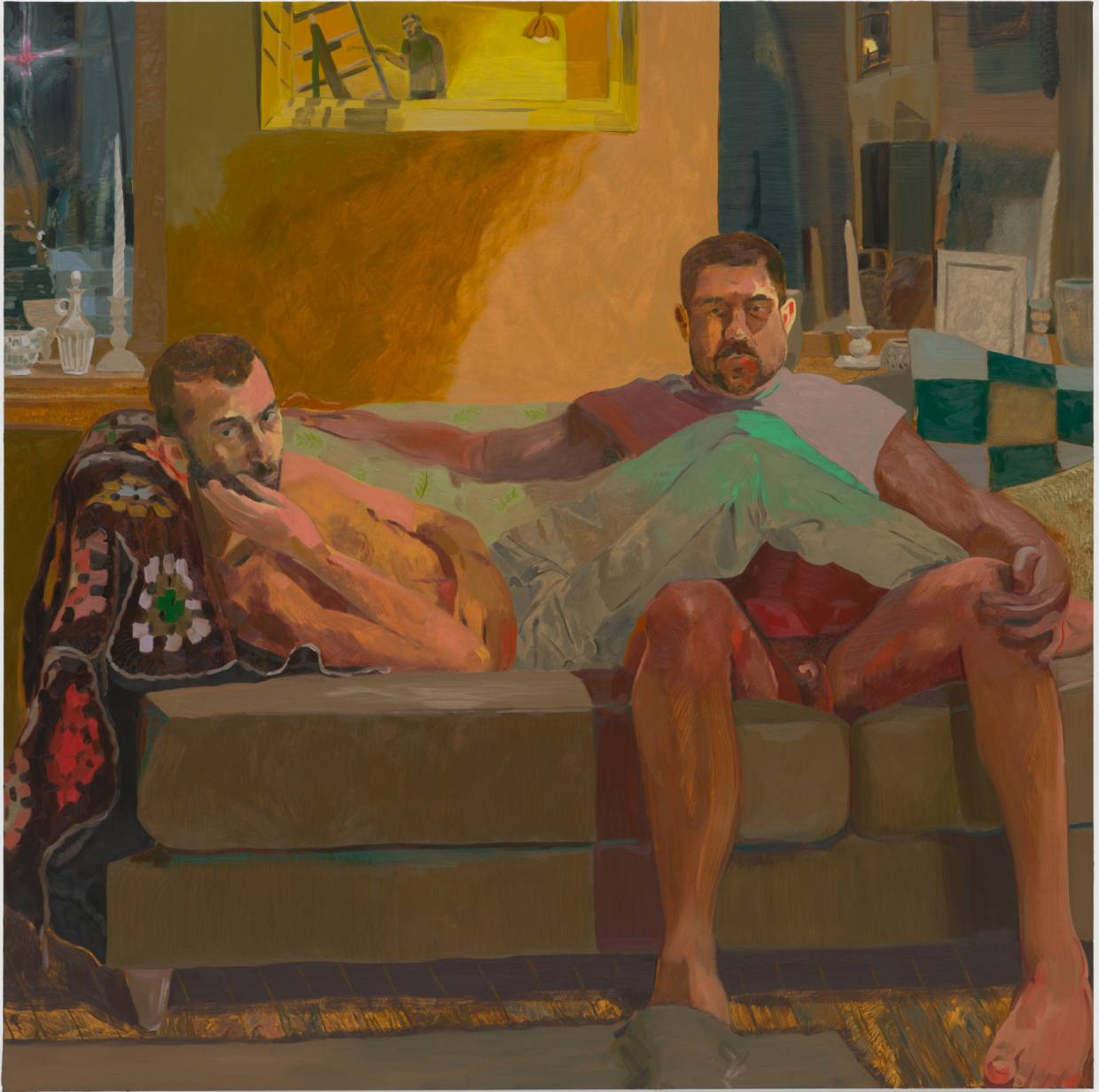
Ian and Alex 2024

Oil on linen 182.9 x 182.9 cm | 72 x 72 in