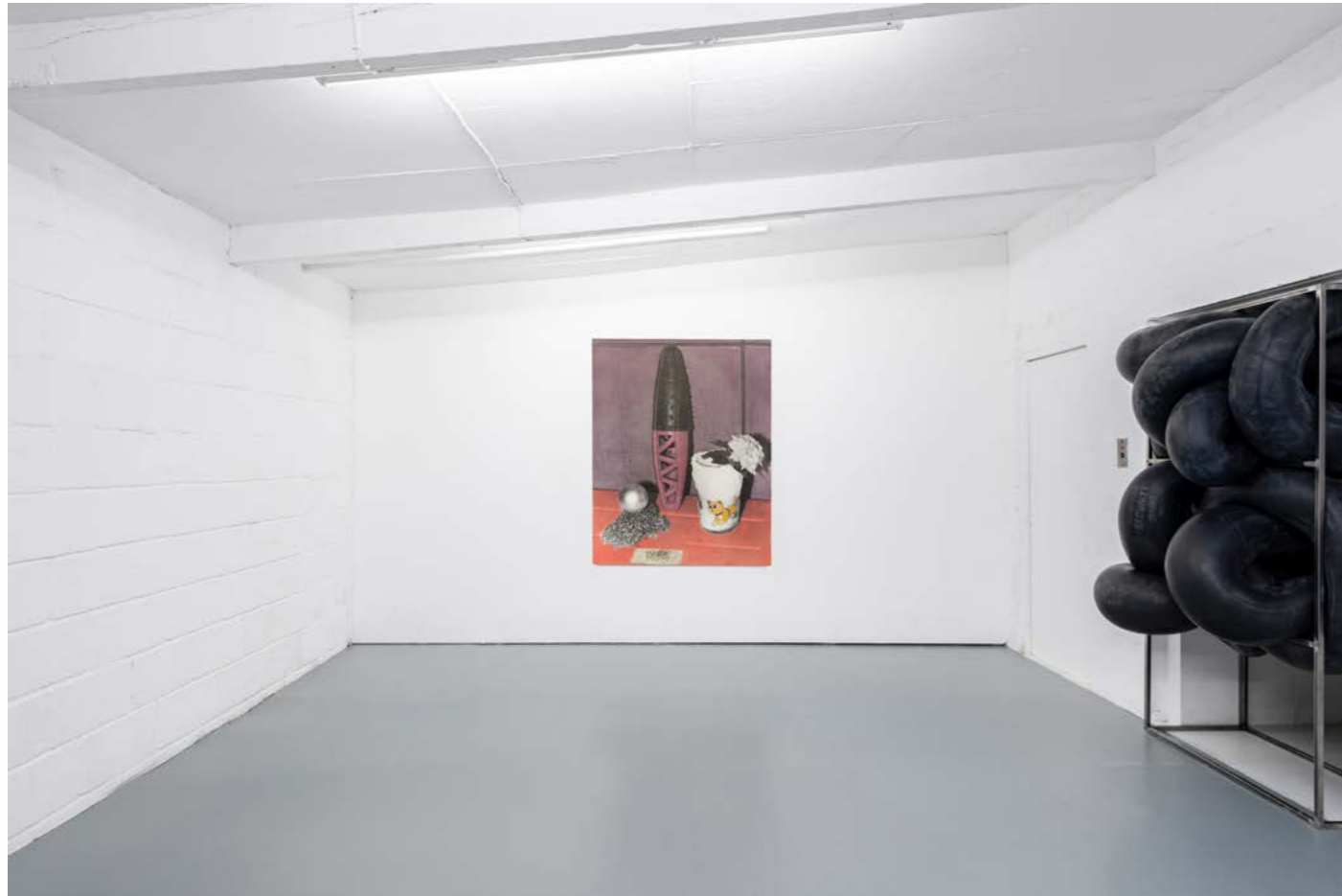
Chaotic Human Nature Exhibition view