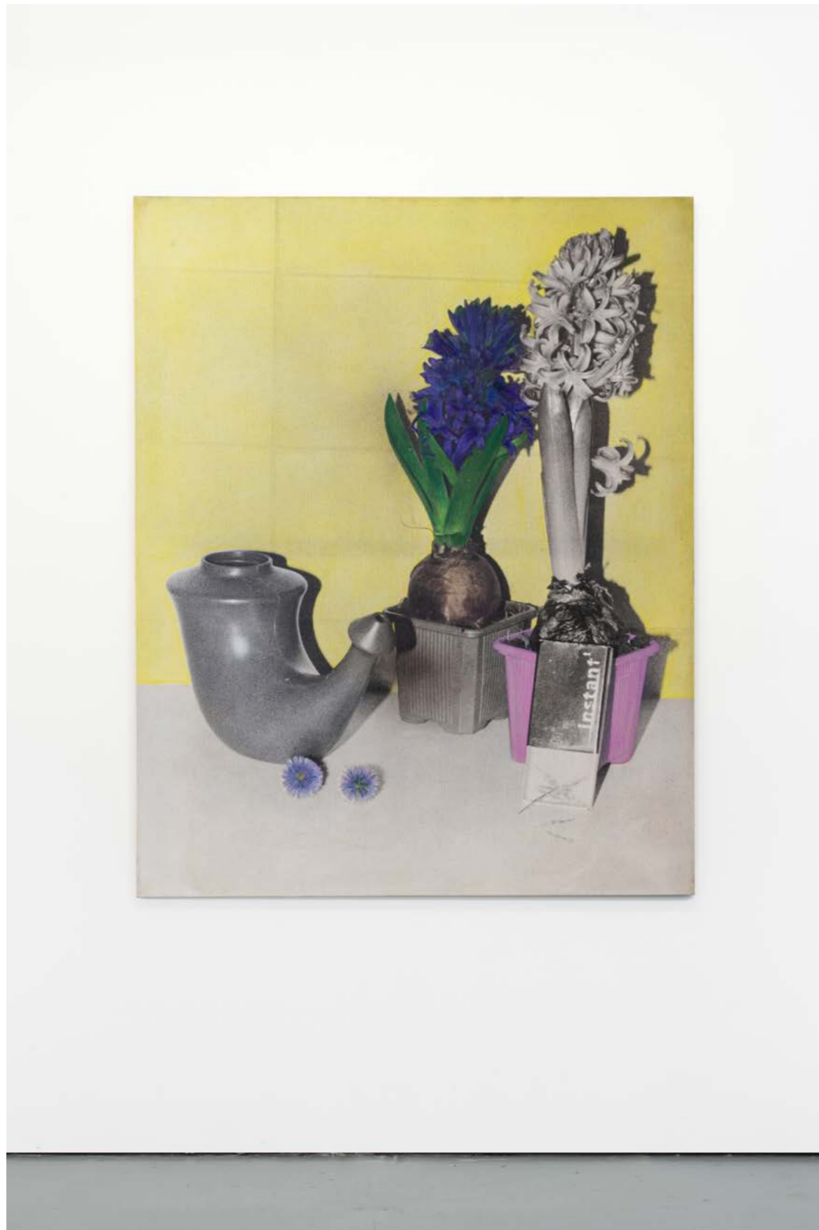
Poire nasale et boules azurées du col de Vence, 2024 silver gelatin print and oil on linen 59.1 x 47 in. | 50 x 120 cm