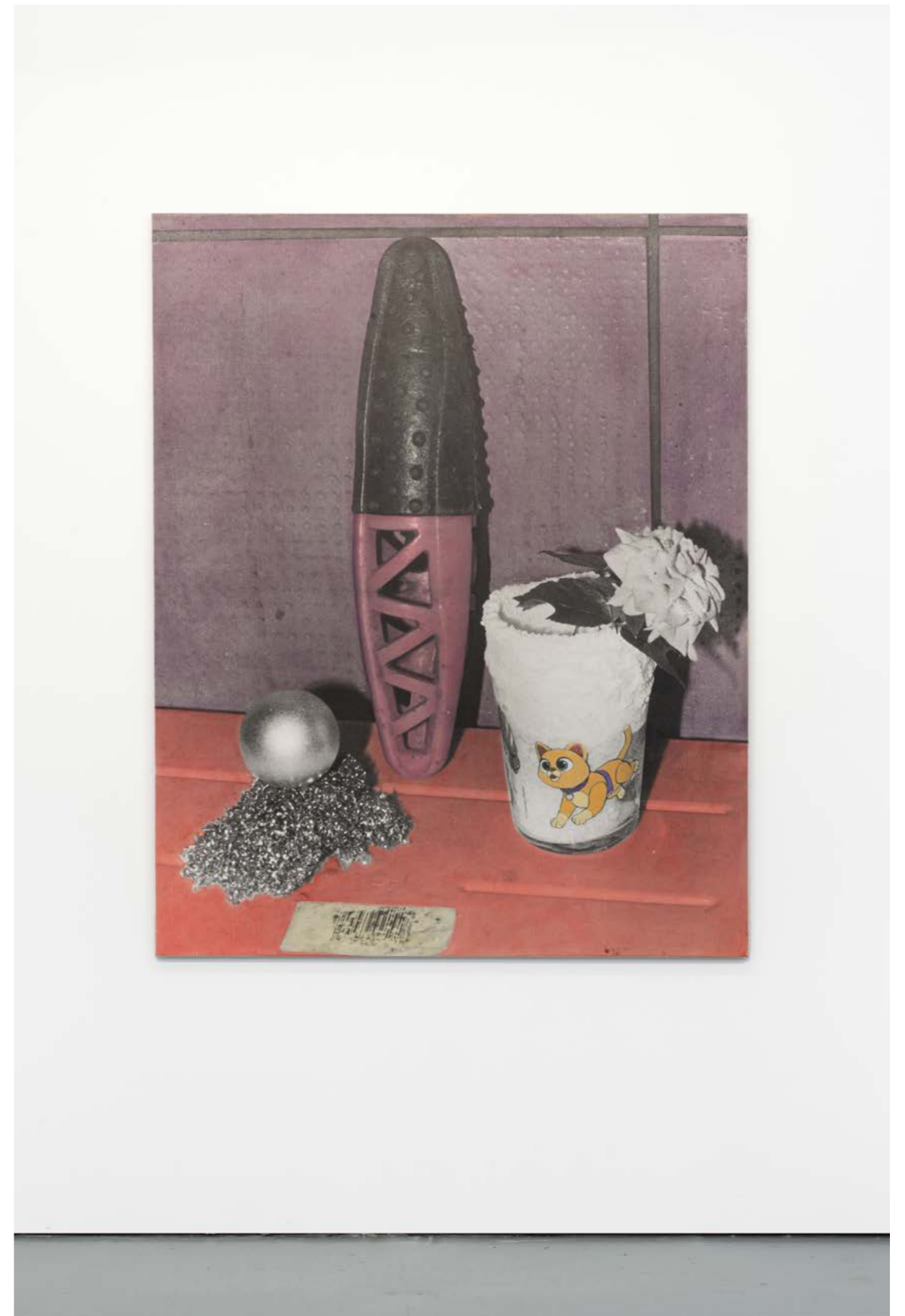
Éponge métallique et rose de rond-point, 2024 silver gelatin print and oil on linen 59.1 x 47 in. | 50 x 120 cm