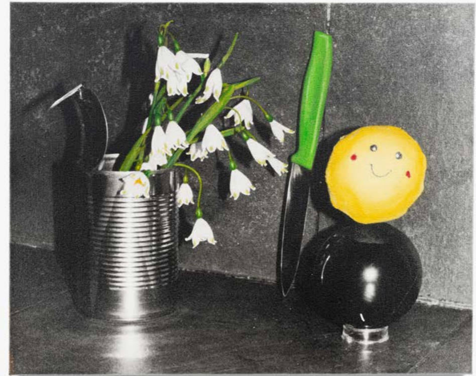
Perce-neiges du square Hector Berlioz et couteau, 2024 silver gelatin print and oil on linen 23.6 x 28.9 in. | 50 x 120 cm