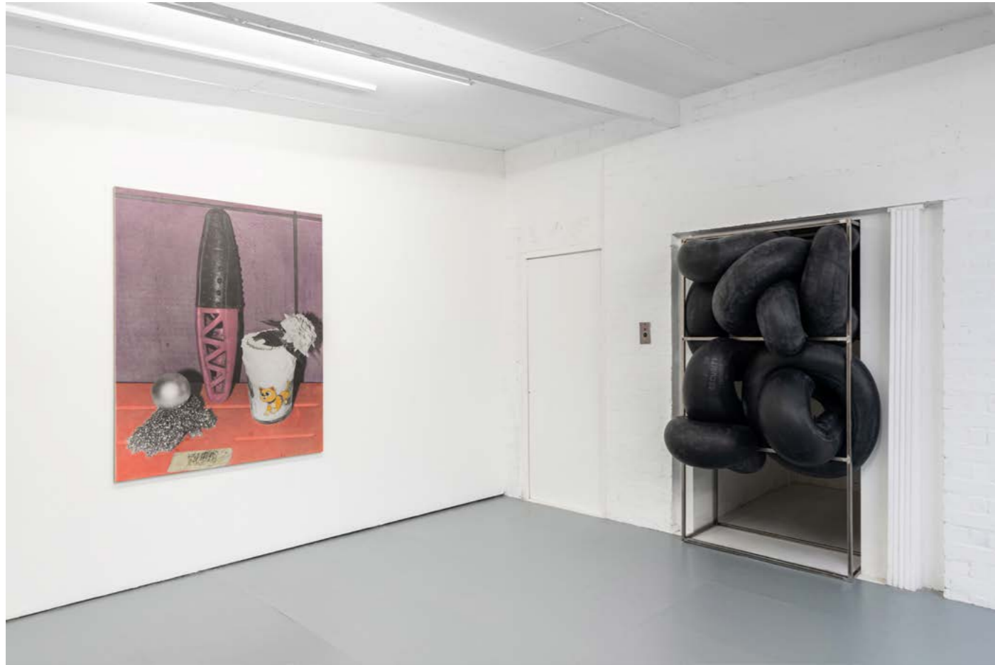
Chaotic Human Nature Exhibition view