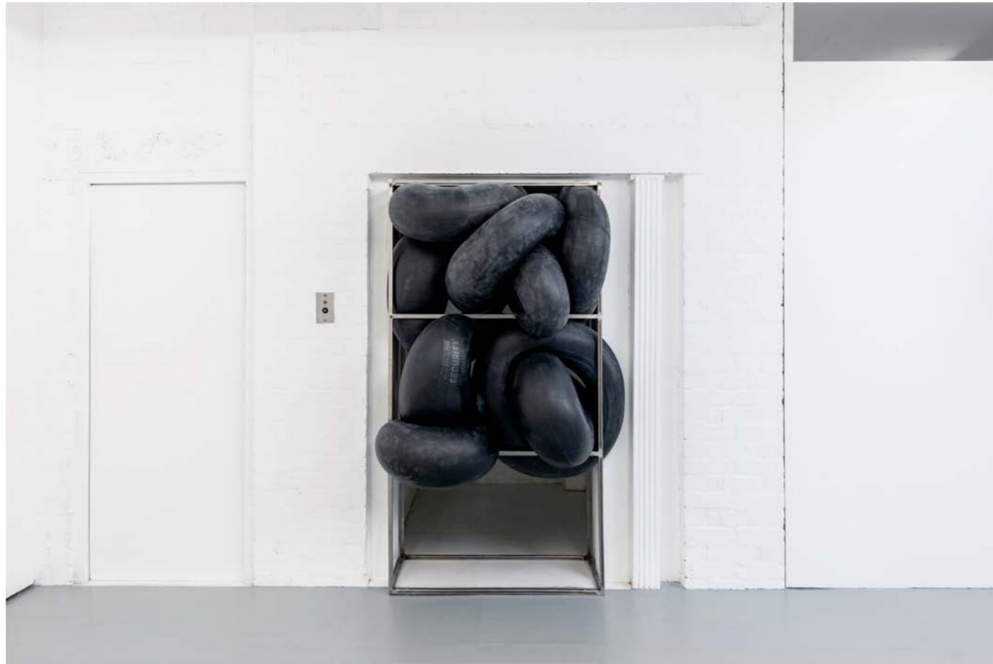
Chaotic Human Nature Exhibition view