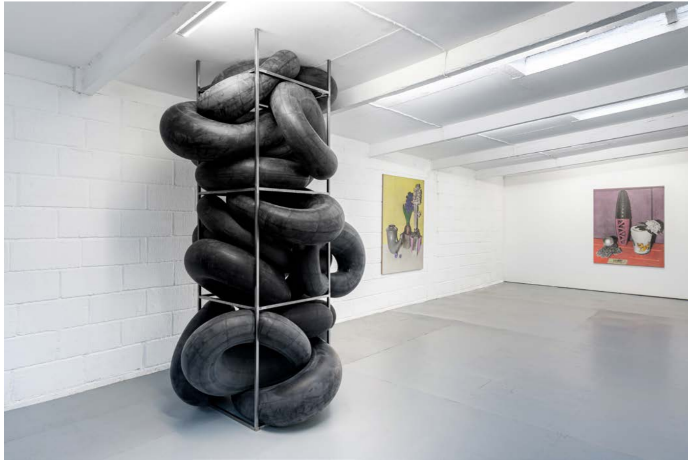
Chaotic Human Nature Exhibition view