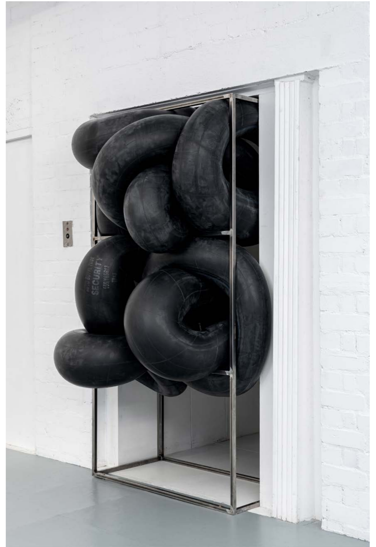
Chaotic 2, 2024 Metal, inner tubes, tuning valve cap variable dimensions