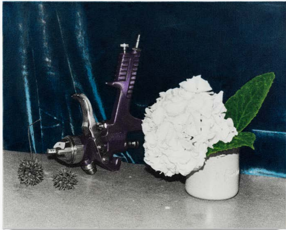
Akènes du quai Aulagnier et pistolet à peinture, 2024 silver gelatin print and oil on linen 23.6 x 28.9 in. | 50 x 120 cm