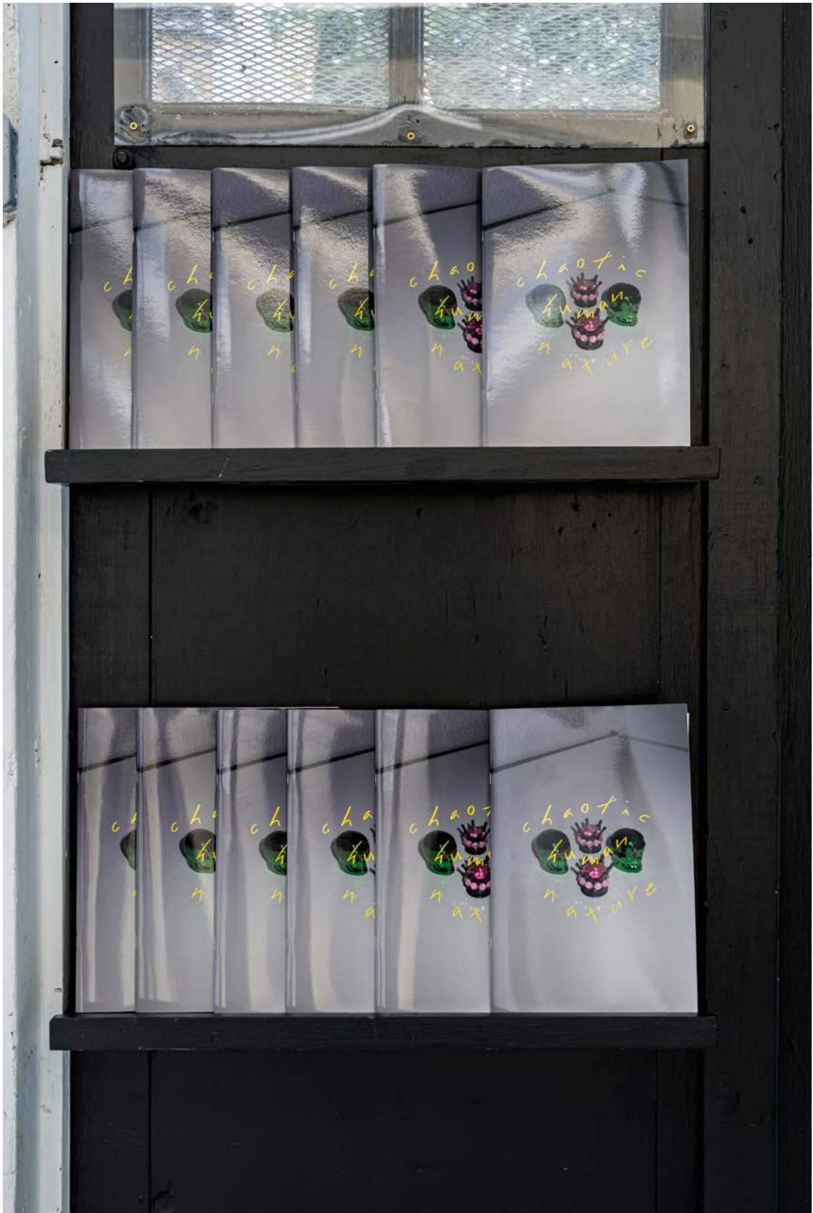
Chaotic Human Nature zine published by MÖREL Books edition of 100