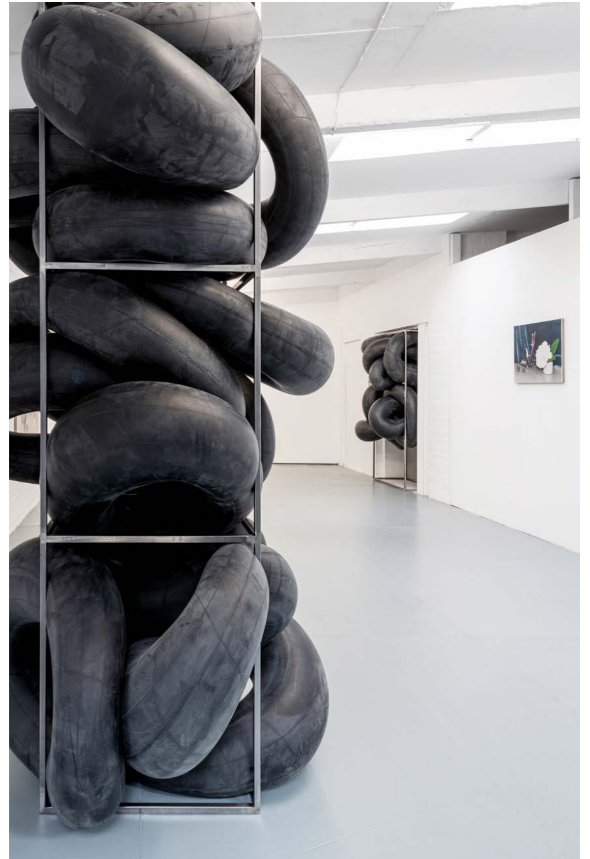
Chaotic Human Nature Exhibition view