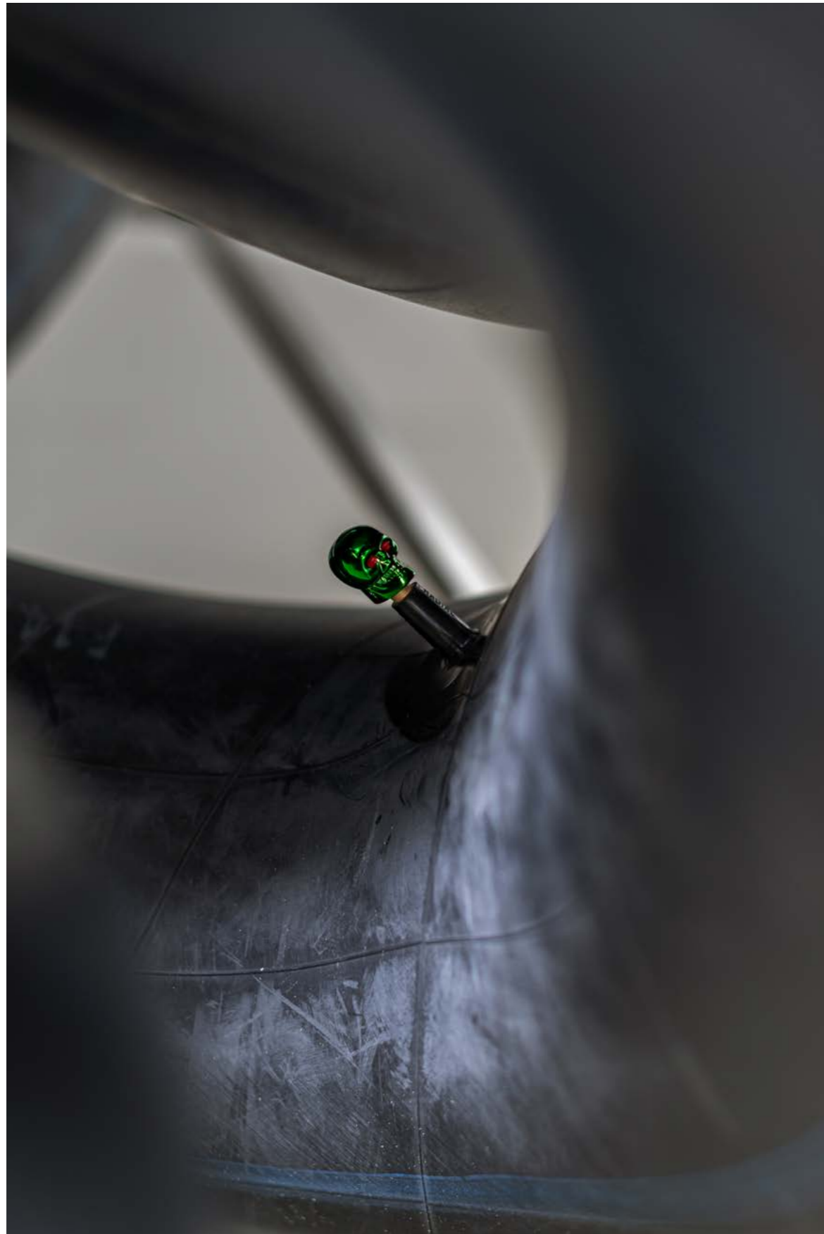
Chaotic 2, 2024 (detail) Metal, inner tubes, tuning valve cap variable dimensions