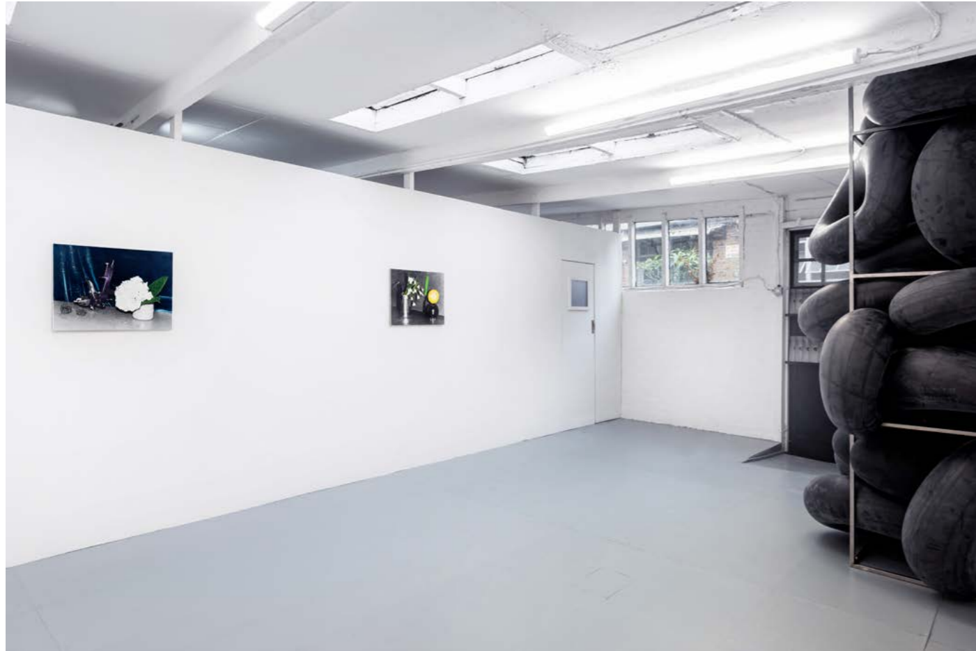
Chaotic Human Nature Exhibition view