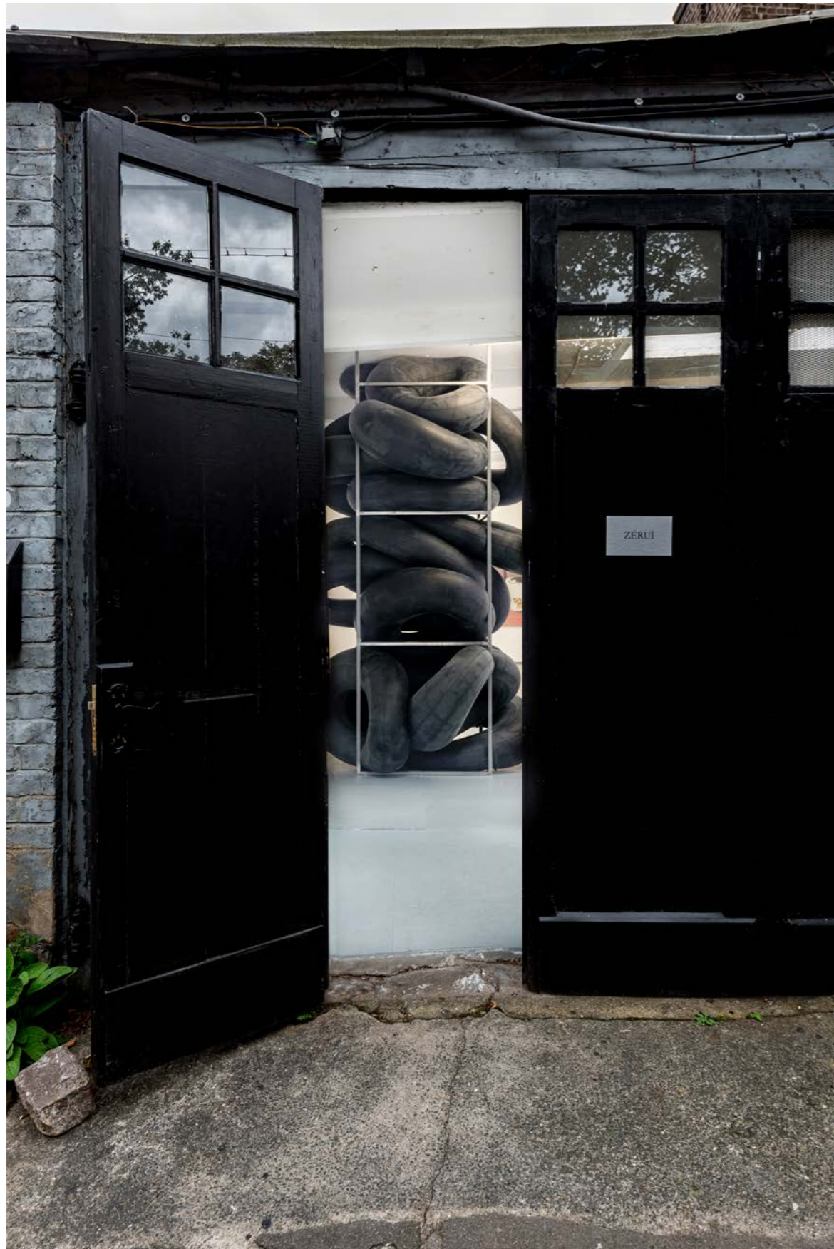
Chaotic Human Nature Exhibition view