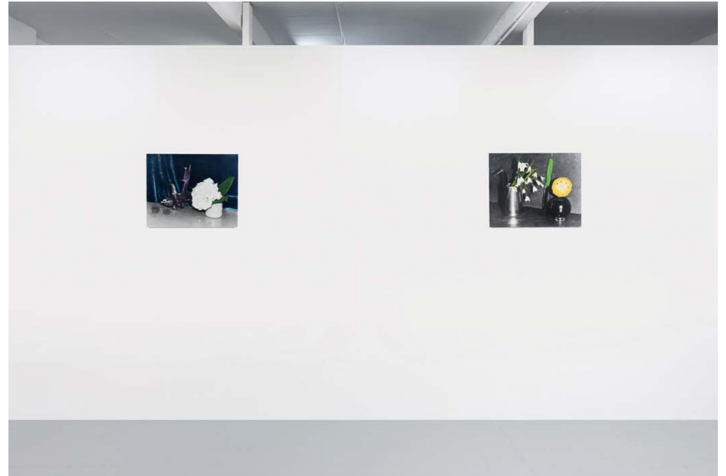
Chaotic Human Nature Exhibition view