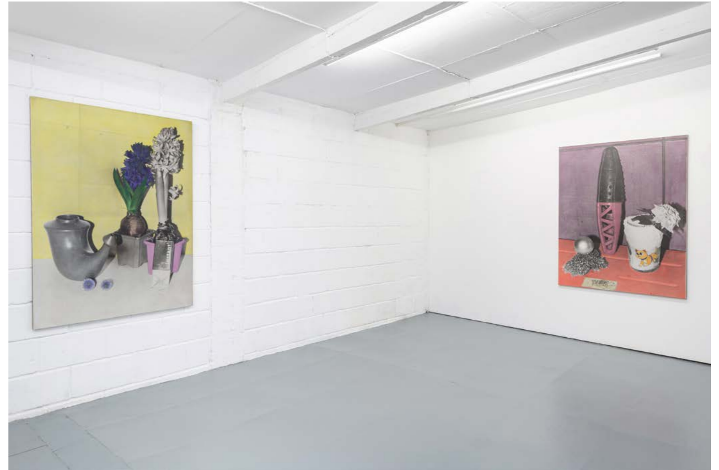
Chaotic Human Nature Exhibition view