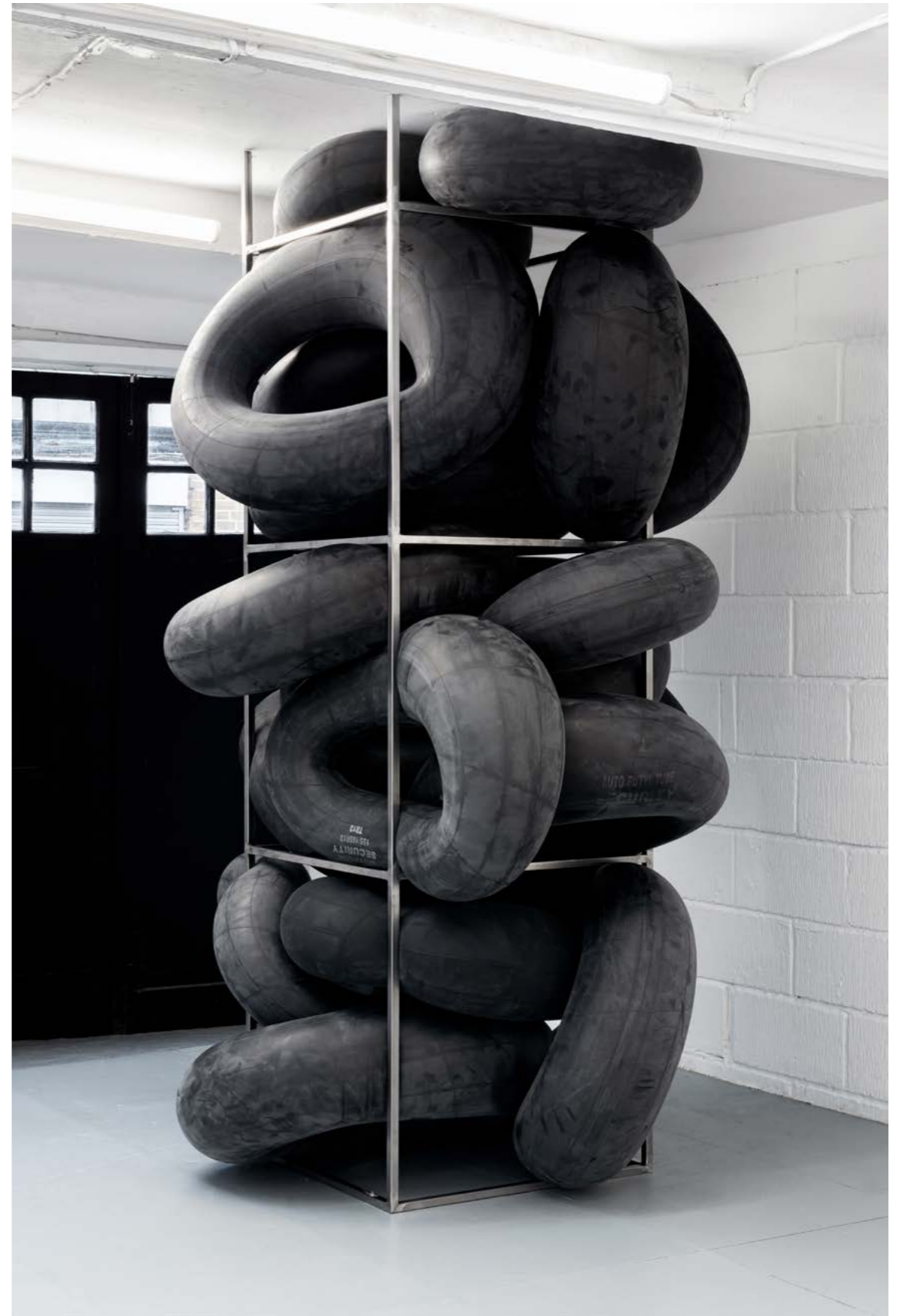
Chaotic 1, 2024 Metal, inner tubes, tuning valve cap variable dimensions