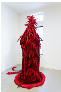
Kornelia Remø Klokk “cruor”, 2022 Textile, yarn, wadding Dimensions variable