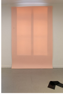
Kobie Nel Cryptic Life , 2024 Polyurethane, trilobite fossils, meteorite 78.75 x 118 inches (2 x 3 m)