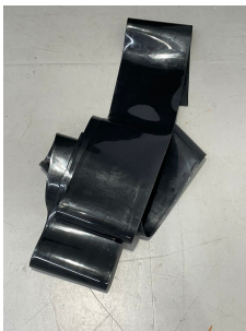
Kobie Nel Shedding II , 2024 PVC Dimensions variable