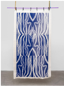
Ann Cathrin November Høibo Untitled , 2022 Silk screen print on heavy cotton, rayon and cotton rope / Fluorescent acrylic rod 102 3/8 x 51 1/8 inches (260 x 130 cm)