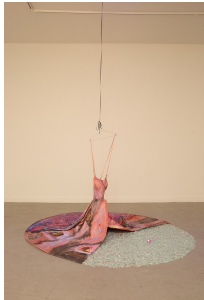
Henrik Olai Kaarstein Bliss Point , 2024 Mixed media installation: paint and acrylic print on ball gown, artificial flower, broken glass wire hanger, silk ribbons, safety pins, broken glass, UV-light Dimensions variable