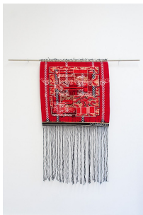
Kornelia Remø Klokk 9.20978°, 2023 Tapestry; cotton, nylon, linen, glass fiber 31.5 x 57.9 inches (80 cm x 147 cm)