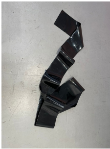
Kobie Nel Shedding I , 2024 PVC Dimensions variable