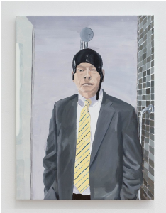
Ryan Cullen Reflexive Deletion, 2022 Oil on linen 31.5 x 23.6 inches (80 x 60 cm)