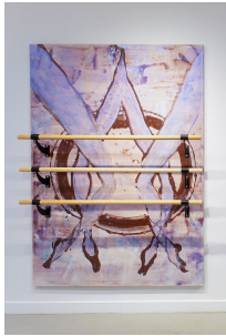
Naomi Fisher Triple Threat , 2014 Mixed media, ballet barres, metal 84 × 60 inches