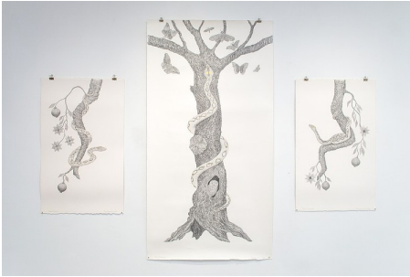
Tanja Thorjussen Naga and the Huluppi Tree (triptych) , 2023 Pencil and gold leaf on watercolor paper 106 (W) by 74 (H) inches overall