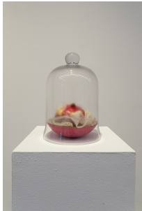
Tanja Thorjussen Naga and the Huluppi Tree - Relic , 2024 Pomegranate, snakeskin, gold leaf, honey, wooden bowl, and glass 12 x 12 x 18 inches