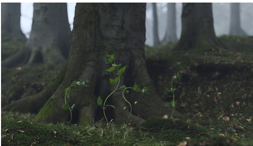
Kim Laybourn The Animate Landscape , 2023/2024 4k digital video, 3D animation, stereo sound 22.27 min duration 2/5, + 2 A.P.