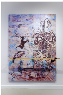
Naomi Fisher Dancarchy (Growing) , 2014 Acrylic, ballet barre on linen 84 x 60 feet