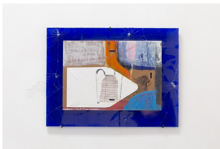
Henrik Olai Kaarstein Contempt , 2024 Mixed media collage on fiberboard, plexiglas and glass 9 x 12 inches