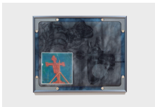
Craig Jun Li p.m. 26 2024 Pigmented cast silicone, found tip-in print, plexiglass, magnets, artist's frame 25.25 x 20.25 x 1.25 inches (64.14 x 51.44 x 3.18 cm) CJL24MM031