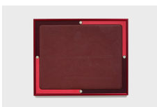
Craig Jun Li p.m. 23 2024

Pigmented cast silicone, plexiglass, magnets, artist's frame 25.25 x 20.25 x 1.25 inches (64.14 x 51.44 x 3.18 cm) CJL24MM027