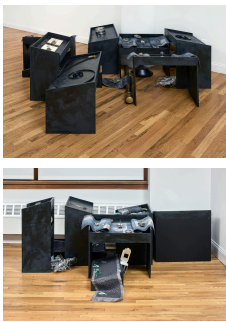
Craig Jun Li, with contributions from Clare Hu work 2024 Time lock mechanisms and parts, antique bearings, cast brass, pigmented cast silicone, synthetic weavings, found tip-in prints, inkjet prints on newsprints, stainless steel steamers, condensation-generating system, plexiglass, BIC lighters, antique children's books, slide changers, found stanchions, Walther's miniature sets, furniture nails, painted plywood Dimensions variable CJL24IN032