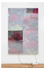
Craig Jun Li pic.04 2024

Inkjet prints on mesh, aluminum stretcher bars, PLA plastic, power supply, Arduino with TFT display, Servo PWM controller, Ethernet jacks, high torque servo motors, wood clubs, various fasteners, acrylic shelves (40 x 60 x 1 inches (101.6 x 152.4 x 2.54 cm) CJL24PR020