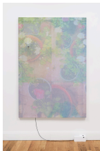
Craig Jun Li pic.03 2024

Inkjet prints on mesh, aluminum stretcher bars, PLA plastic, power supply, Arduino with TFT display, Servo PWM controller, Ethernet jacks, high torque servo motors, wood clubs, various fasteners, acrylic shelves 40 x 60 x 1 inches (101.6 x 152.4 x 2.54 cm) CJL24PR019