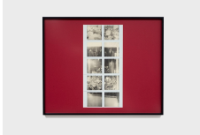
Craig Jun Li untitled 2024

Inkjet prints on mesh, aluminum stretcher bars, PLA plastic, power supply, Arduino with TFT display, Servo PWM controller, Ethernet jacks, high torque servo motors, wood clubs, various fasteners, acrylic shelves 40 x 60 x 1 inches (101.6 x 152.4 x 2.54 cm) CJL24PR023