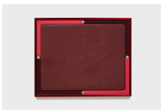
Craig Jun Li p.m. 22 2024

SX-70 films, vintage clock part, reflective mylar sheet, artist's frame 25.25 x 20.25 x 1.25 inches (64.14 x 51.44 x 3.18 cm) CJL24PR026