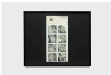
Craig Jun Li untitled 2024

SX-70 films, vintage clock part, reflective mylar sheet, artist's frame 25.25 x 20.25 x 1.25 inches (64.14 x 51.44 x 3.18 cm) CJL24PR025