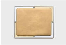
Craig Jun Li p.m. 25 2024 Pigmented cast silicone, plexiglass, magnets, artist's frame 25.25 x 20.25 x 1.25 inches (64.14 x 51.44 x 3.18 cm) CJL24MM030