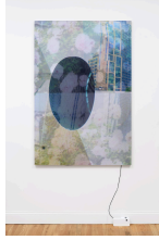
Craig Jun Li pic.06 2024

Inkjet prints on mesh, aluminum stretcher bars, PLA plastic, power supply, Arduino with TFT display, Servo PWM controller, Ethernet jacks, high torque servo motors, wood clubs, various fasteners, acrylic shelves 40 x 60 x 1 inches (101.6 x 152.4 x 2.54 cm) CJL24PR023