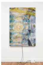
Craig Jun Li pic.05 2024

Inkjet prints on mesh, aluminum stretcher bars, PLA plastic, power supply, Arduino with TFT display, Servo PWM controller, Ethernet jacks, high torque servo motors, wood clubs, various fasteners, acrylic shelves 40 x 60 x 1 inches (101.6 x 152.4 x 2.54 cm) CJL24PR021