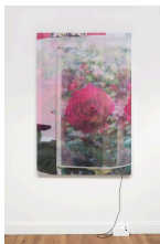
Craig Jun Li pic.02 2024

Inkjet prints on mesh, aluminum stretcher bars, PLA plastic, power supply, Arduino with TFT display, Servo PWM controller, Ethernet jacks, high torque servo motors, wood clubs, various fasteners, acrylic shelves 40 x 60 x 1 inches (101.6 x 152.4 x 2.54 cm) CJL24PR018