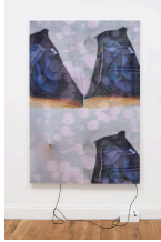
Craig Jun Li pic.01 2024

Inkjet prints on mesh, aluminum stretcher bars, PLA plastic, power supply, Arduino with TFT display, Servo PWM controller, Ethernet jacks, high torque servo motors, wood clubs, various fasteners, acrylic shelves 40 x 60 x 1 inches (101.6 x 152.4 x 2.54 cm) CJL24PR018