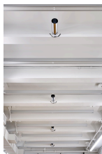
Emily Leach & Craig Jun Li "untitled" (parrots) 2024 Reflective mylar sheet, acrylic tubing, etched privacy filter, furniture nails Set of four, each 3.5 x 12 x 3.5 inches (8.89 x 30.48 x 8.89 cm) CJL24SC033