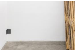
Devin T. Mays Description, 2024 silver gelatin print each 10 x 15 cm