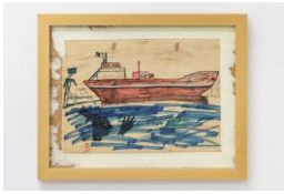
Nilbar Güres Bartok, 1998 coloured pencil on paper framed, 21 x 26,5 cm