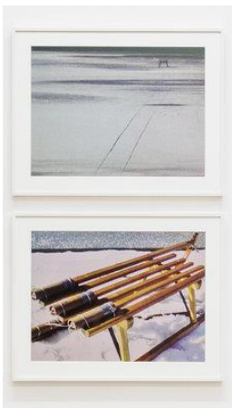
Roman Signer Schlitten, 1988 Super8-Filmstills 2 parts, each 41.5 x 56 cm Edition 1/10 + 3 E.A.