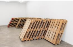
Devin T. Mays Untitled (Unnamed), 2024 pallets, wedges Overall dimensions vary with the installation