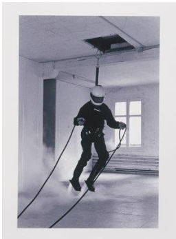
Roman Signer Schweben, 1995 b&w photograph 60 x 40 cm Edition 10/10 + 3 E.A.