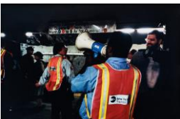
Martha Rosler Lexington Avenue Station, New York, September. From the series: Ventures Underground (1990-present), 2003 c-print