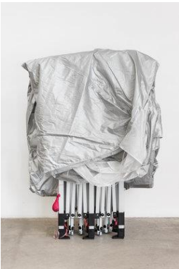
Devin T. Mays Catalog, 2024 tent, balloon overall dimensions vary with the installation