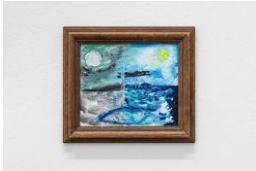
Nilbar Güres Two Moons two Suns two Waters, 2024 oil on canvas framed, 15,5 x 17,5 cm