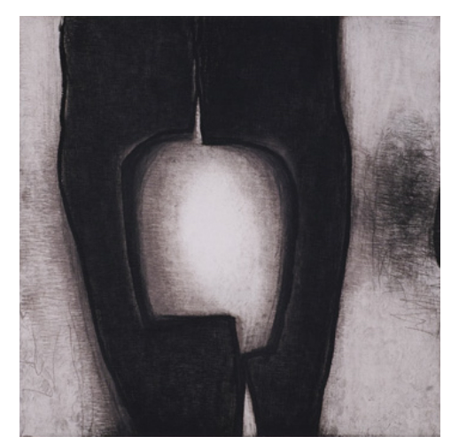
Left: 《April-1-1995》 (1995) woodblock print, paper H56xW76cm ©Toeko Tatsuno Right: 《June-19-96》 (1996) ething, aquatint, paper H82.5xW75cm ©Toeko Tatsuno

"I had a sense of space that could only exist in painting, and wanted to make it unique,"<sup>6</sup> commented Tatsuno, whose abstract motifs have figures resembling the gravitational pull of the real earth, and make a peculiar pictorial space emerge before