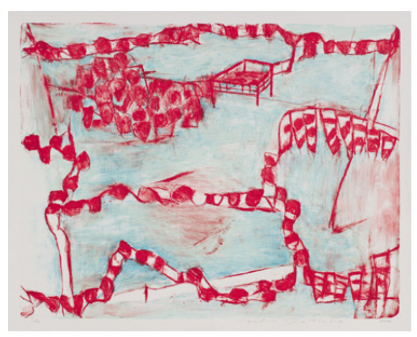
《AIWIP-25》 (2012) lithograph, paper, H69.3×W87cm ©Toeko Tatsuno

The main exhibitions at which she showed works are as follows: A Perspective on Contemporary Art: Metaphors and/or Symbols (National Museum of Modern Art, Tokyo, and National Museum of Art, Osaka, 1984); Europia '89 Japan (Municipal Museum of Contemporary Art, Ghent, Belgium, 1989); Japanese Art after 1945: Scream against the Sky (Yokohama Museum of Art; Guggenheim Museum, New York; San Francisco Museum of Modern Art, 1994); The 22nd Sao Paulo Biennial (1995); Tatsuno Toeko – 1986-1995 (National Museum of Modern Art, Tokyo, 1995); Given Forms: Toeko Tatsuno and Toshio Shibata (National Art Center, Tokyo, 2012); Toeko Tatsuno's Trajectory (BB Plaza Museum of Art, Hyogo, 2016); Toeko Tatsuno On Papers: A Retrospective, 1969-2012 (Museum of Modern Art, Saitama, and Nagoya City Art Museum, 2018).