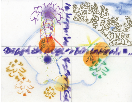
Samson Young Murdoch Notes , 2024 Soft pastel, pencil, color pencil and stamps on paper 26 × 18 cm (7 1/8 × 10 1/4 in)