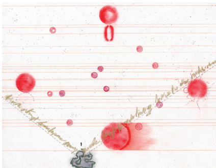
Samson Young Murdoch Notes , 2024 Soft pastel, pencil, color pencil and stamps on paper 26 × 18 cm (7 1/8 × 10 1/4 in)