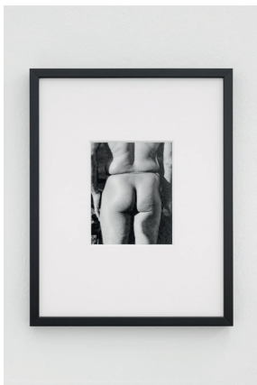
Taro Masushio Untitled (Youth #9) , 2023 Inkjet on baryta 27.9 × 21.6 cm (11 × 8 1/2 in) Ed. 3