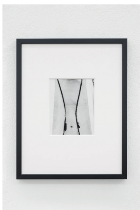
Taro Masushio Untitled (Youth #2) , 2023 Inkjet on baryta 27.9 × 21.6 cm (11 × 8 1/2 in) Ed. 3