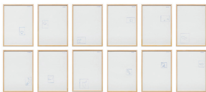
Alighiero Boetti Dodici forme dal 10 giugno , 1971 Serigraph, 12 parts 59 × 42.5 cm (26 1/8 × 19 3/4 in) Ed. 53/99