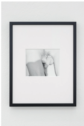
Taro Masushio Untitled (Youth #4) , 2023 Inkjet on baryta 27.9 × 21.6 cm (11 × 8 1/2 in) Ed. 3