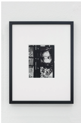
Taro Masushio Untitled (Youth #7) , 2023 Inkjet on baryta 27.9 × 21.6 cm (11 × 8 1/2 in) Ed. 3