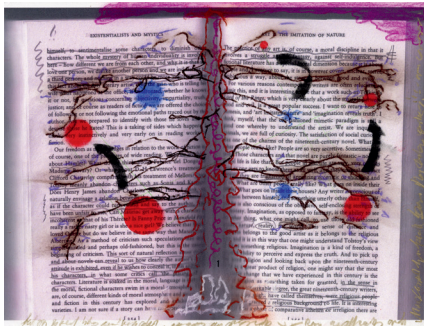
Samson Young Murdoch Notes (hermeneutics) , 2024 Soft pastel, pencil, color pencil and stamps on paper 26 × 18 cm (7 1/8 × 10 1/4 in)