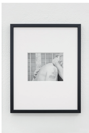
Taro Masushio Untitled (Youth #8) , 2023 Inkjet on baryta 27.9 × 21.6 cm (11 × 8 1/2 in) Ed. 3