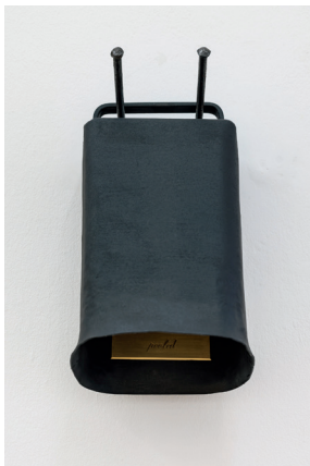
Aria Dean pooled , 2024 Iron, engraved brass plate 29 × 17 × 15 cm (11 3/8 × 6 3/4 × 5 7/8 in)