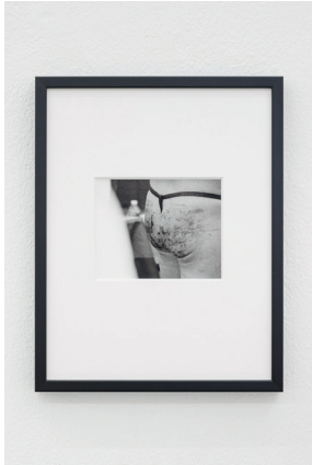
Taro Masushio Untitled (Youth #3) , 2023 Inkjet on baryta 27.9 × 21.6 cm (11 × 8 1/2 in) Ed. 3