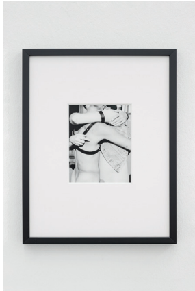
Taro Masushio Untitled (Youth #1) , 2023 Inkjet on baryta 27.9 × 21.6 cm (11 × 8 1/2 in) Ed. 3