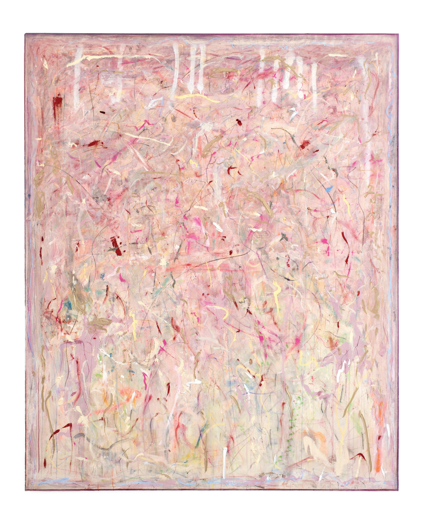
AMI MORRIS The walls around us, 2024 Glue, oil stick, pencils, oil paint, acrylic paint, paper and charcoal on cotton 167 × 137 cm