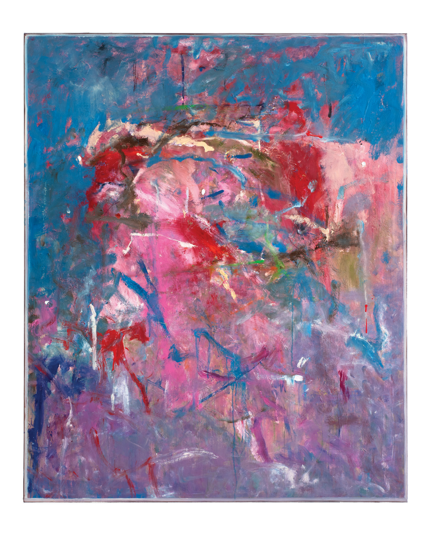
AMI MORRIS As yet untitled, 2024 Glue, oil stick, pencils, oil paint, acrylic paint and plaster on linen 167 × 137 cm