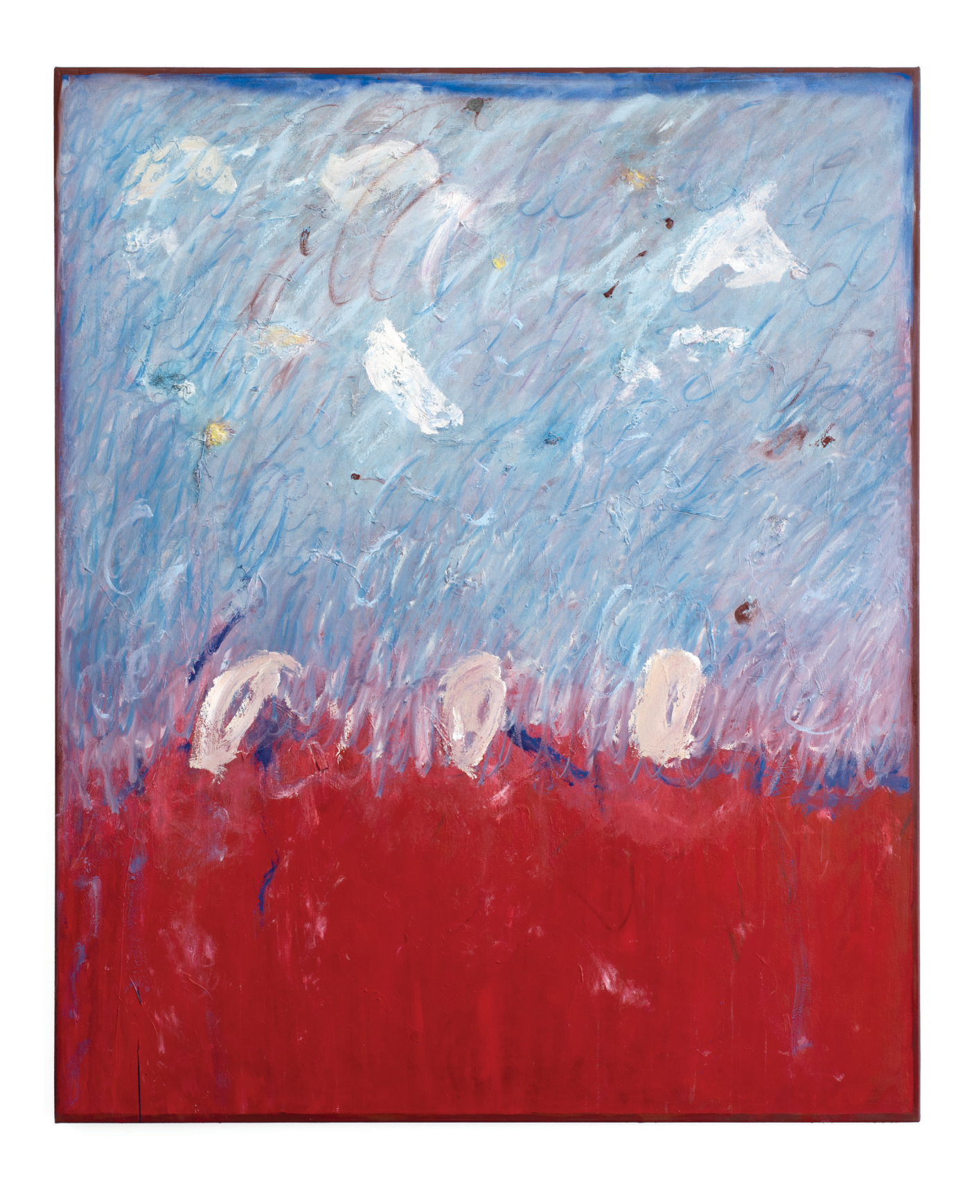
AMI MORRIS As yet untitled, 2024 Glue, oil stick, pencils, oil paint, acrylic paint, plaster, and cotton string on cotton 167 × 137 cm