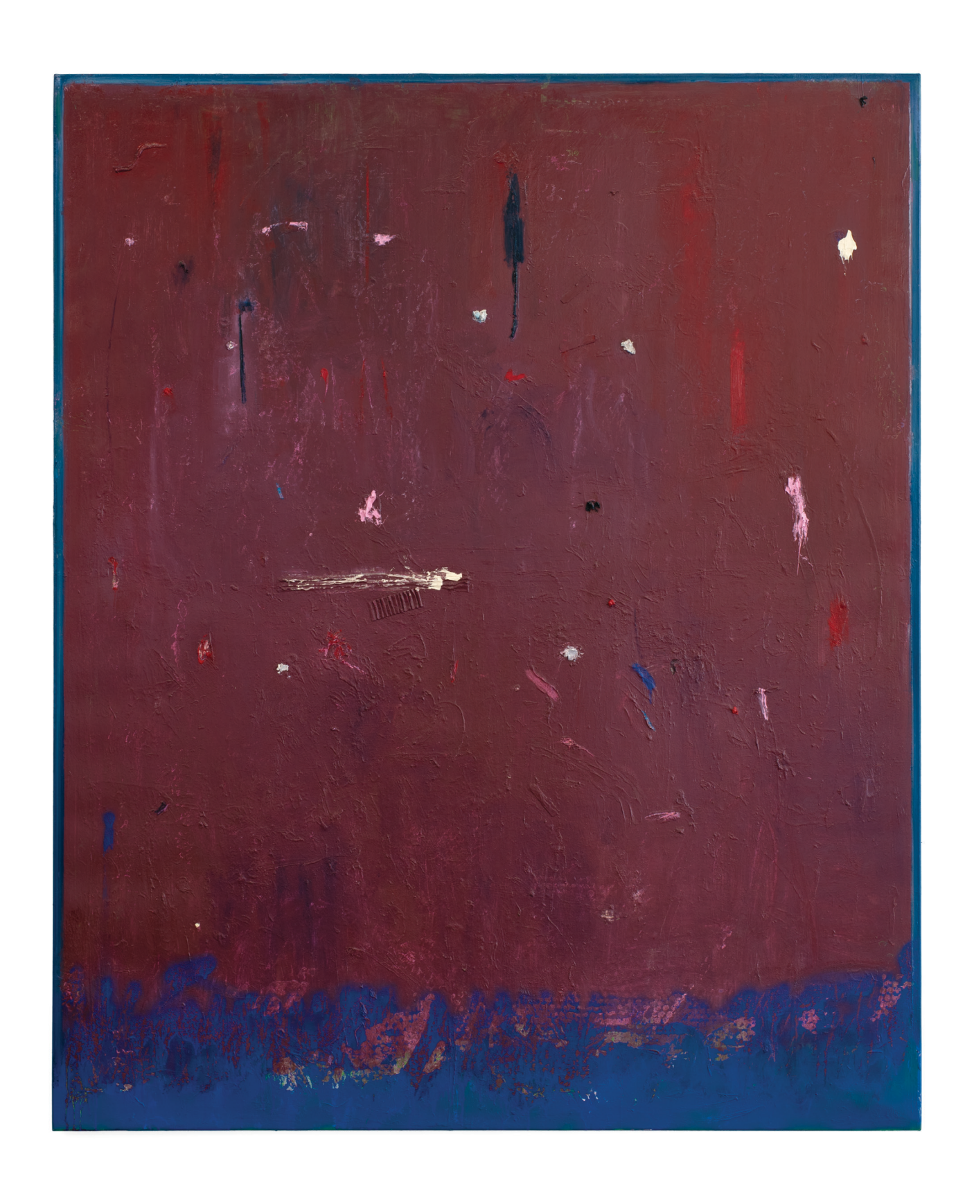
AMI MORRIS As yet untitled, 2024 Glue, oil stick, pencils, oil paint, acrylic paint, plaster and cardboard on linen 167 × 137 cm