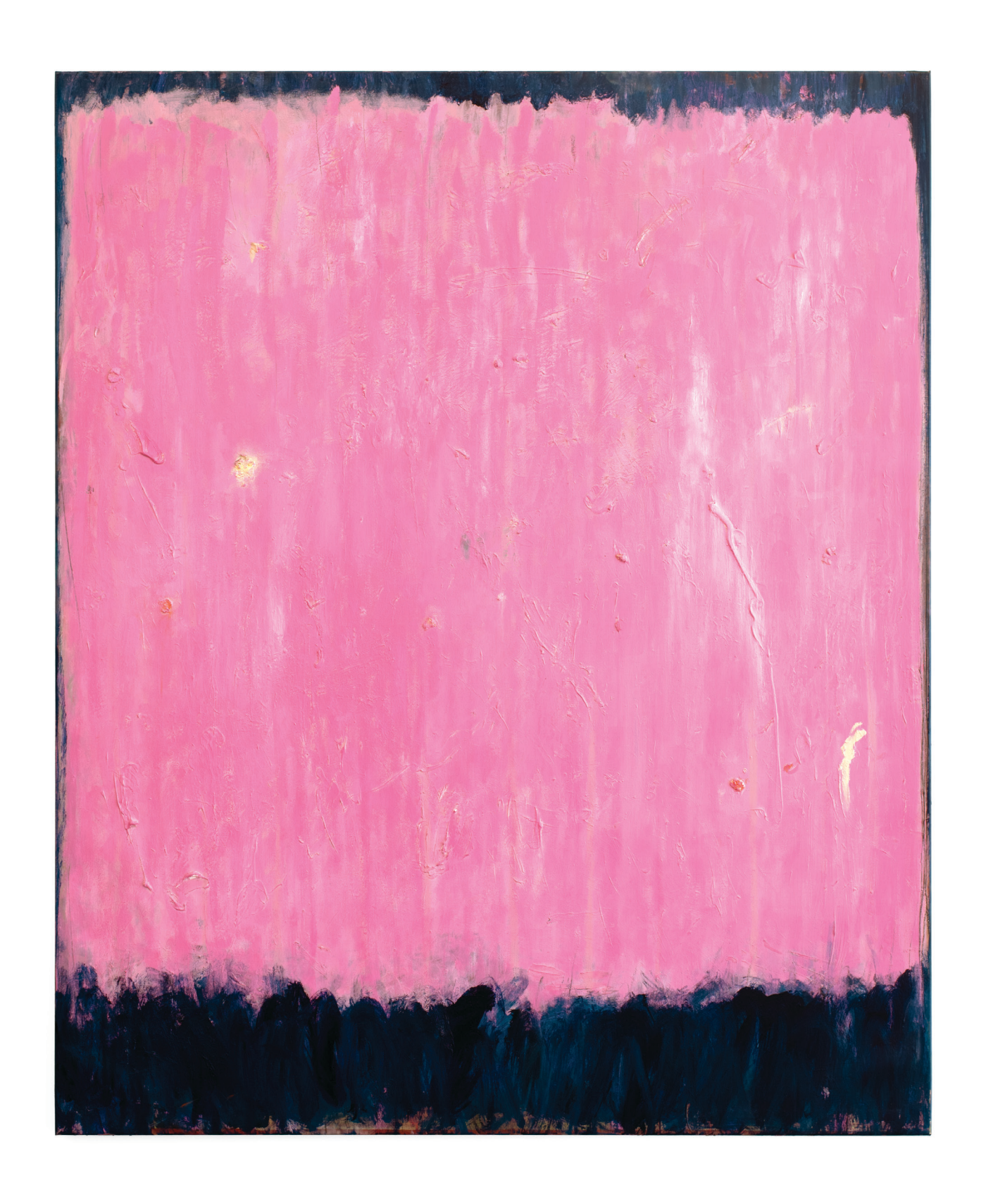
AMI MORRIS As yet untitled, 2024 Glue, oil stick, pencils, oil paint, acrylic paint, paper and plaster on linen 167 × 137 cm