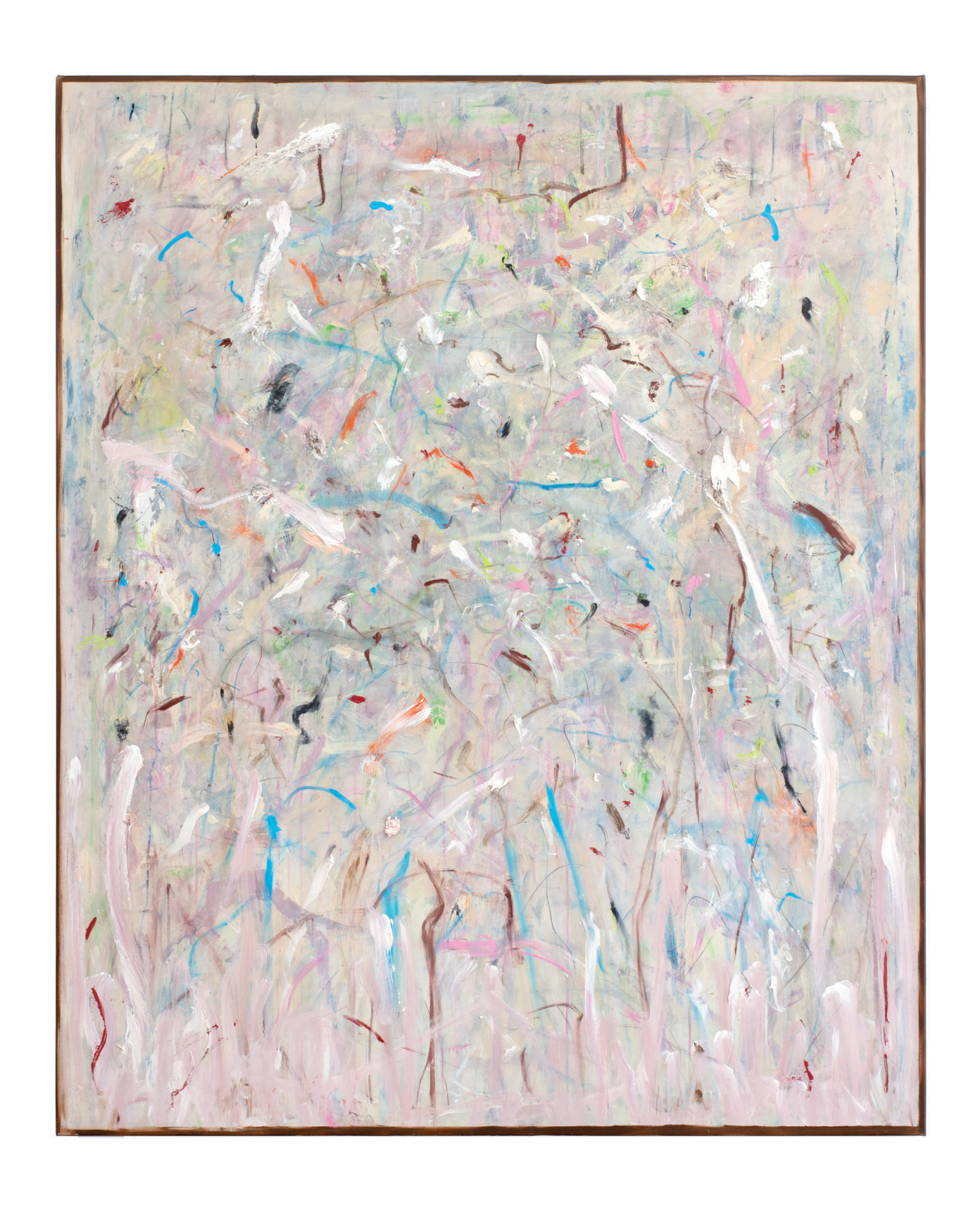
AMI MORRIS As yet untitled, 2024 Glue, oil stick, pencils, oil paint, acrylic paint, paper and plaster on linen 167 × 137 cm