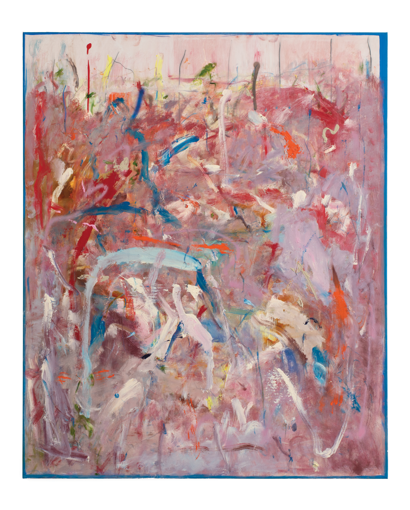
AMI MORRIS As yet untitled, 2024 Glue, oil stick, pencils, oil paint, acrylic paint and charcoal on linen 167 × 137 cm