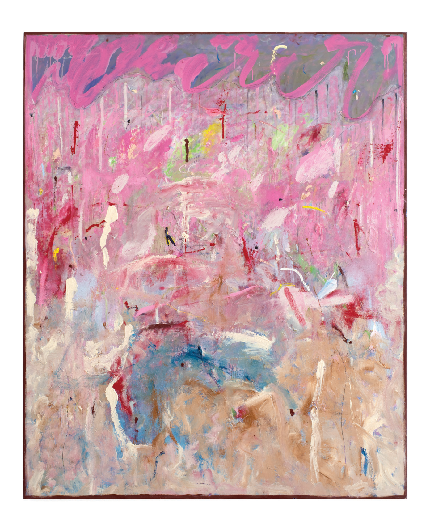
AMI MORRIS As yet untitled, 2024 Glue, oil stick, pencils, oil paint, and acrylic paint on linen 167 × 137 cm