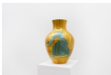
Ala Savashevich Girls, strike when the iron is hot II (Series Vases), 2024 straw marquetry 42 x 25 25 cm (SA24)