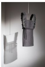
Ala Savashevich Sew On Your Own, 2022 steel 80 x 26,5 x 40 cm (SA01)