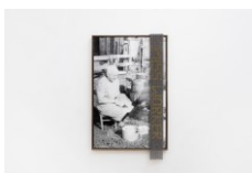
Ala Savashevich Nadzia at work, 2024 giclée print, cotton paper, Hahnemühle Photo Rag 308 g/m 2 , 100 x 65,5 cm Edition of 3 (SA27)