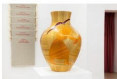
Ala Savashevich Girls, strike while the iron is hot I (Series Vases), 2024 straw marquetry 42 x 25 x 25 cm (SA20)