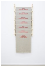
Ala Savashevich 82 hours, 2024 cotton, wood 200 x 75 cm Edition of 2 plus 1AP (SA26)