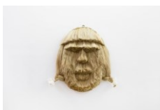
Ala Savashevich Exercise is Technique, 2024 linen fibers, steel, chainmail 100 x 90 cm (SA23)