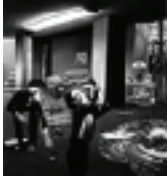
Homage to Catatonia (1) , 1975 Gouache 14 x 11 1/2 in.