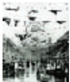
Poor but Loyal , 1982 Collage 7 3/4 x 6 in.