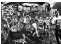
Christ the Album , 1981 Gouache and collage 17 3/4 x 24 3/4 in.