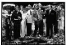
Nagasaki Nightmare , 1980