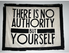
Crass Banner, c. 1983 Paint on bedsheet 69 x 89 in.