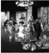
Homage to Catatonia (2) , 1975 Gouache 14 x 11 1/2 in.