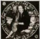
Thatcher CusTurd , 1982 Collage 11 3/4 x 11 3/4 in.