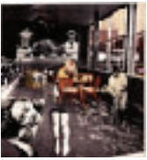
Domestic Violence , 1979 Collage 11 3/4 x 9 1/2