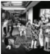
Homage to Catatonia (3) , 1975 Gouache 14 x 11 1/2 in.