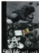
Still Life with Nude , 1983 Collage 11 1/2 x 8 1/4 in.