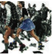
Best Before 1984 , 1989 Gouache 8 1/2 x 8 1/4 in.