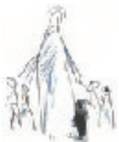
Much Ado About Something , 1996 Drawing and collage 14 framed drawings with collage, 22 x 18 in. each