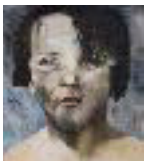
Children Who Have Seen Too Much Too Soon, c. 2006 Oil paint, acrylic, oil pastels on canvas 85 1/2 x 76 1/2 in.