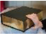
Lost: A Modern Bible, 2018 Book 12 1/2 x 9 1/2 in.