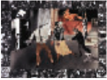
Stations of the Cross , 1979 Gouache and collage 22 3/4 x 32 1/4 in.