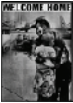
Welcome Home , 1982 Collage 13 1/4 x 9 1/2 in.