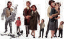
Domestic Violence , 1979 Collage 22 x 14 1/2 in.