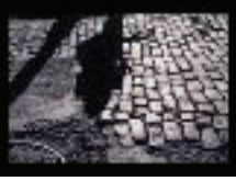
Cobblestones , 2014 16 black and white photographs 14 x 21 in. each