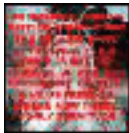
Gee Vaucher / Penny Rimbaud Oh, America (with text) , 2006 Digital print 35 1/2 x 34 1/2 in.