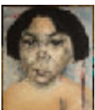
Children Who Have Seen Too Much Too Soon, c. 2006 Oil paint, acrylic, oil pastels on canvas 89 x 76 in.