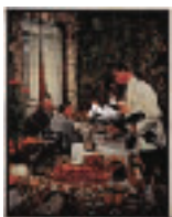
Meat with Everything , 1982 Collage 11 1/4 x 8 1/4 in.