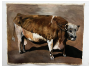
The Great Contender , 1997 Oil paint on canvas 72 x 96 in.