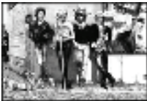
Bloody Revolutions , 1980