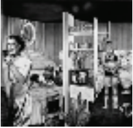
Domestic Violence , 1979 Gouache 11 3/4 x 11 1/2 in.