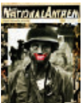
Smile , 1979 Collage 13 1/4 x 10 1/2 in.