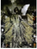
Penis Envy , 1981 Collage, ink and gouache 11 1/2 x 8 1/4 in.