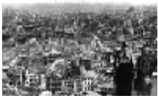
Ideal Home , 1983 Collage 12 1/4 x 16 in.