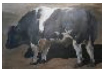
The Great Contender , n.d. Oil paint on canvas 72 x 96 in.