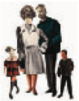
Family , 1977 Collage 16 1/2 x 11 1/2 in.