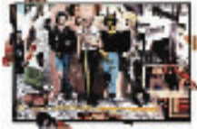
Best Before 1984 , 1989 Color photographic print with collage and hand-coloring 11 1/2 x 17 3/4 in.