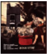
Irish Stew , 1981 Collage 15 x 11 in.