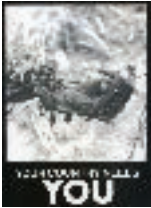
Your Country Needs You , 1978