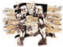
Penis Envy , 1981 Collage, ink, gouache 15 x 19 1/2 in.