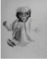
Hunger , 1983 Gouache 8 1/2 x 4 1/2 in.