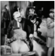
Education , 1977 Gouache 9 1/2 x 9 1/2 in.