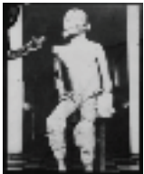
Pacify , 1982 Xerox print 13 x 11 in.