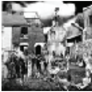
Feeding of the 5000 , 1978