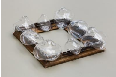
Maria Roosen Untitled , 2024 glass, wood 28 x 90 x 98 cm