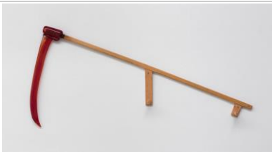
Maria Roosen Scythe , 2012 glass, wood 73 x 163 cm