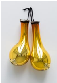
Maria Roosen Golden breasts , 2023 mirrored glass 55 x 45 x 23 cm