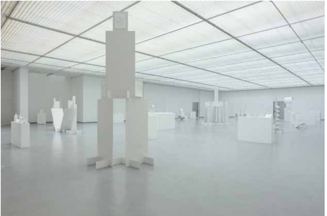
White Suprematism Installation view Contemporary Art Centre (CAC) Vilnius, Lithuania 2016

Courtesy of the artists and Contemporary Art Centre (CAC), Vilnius