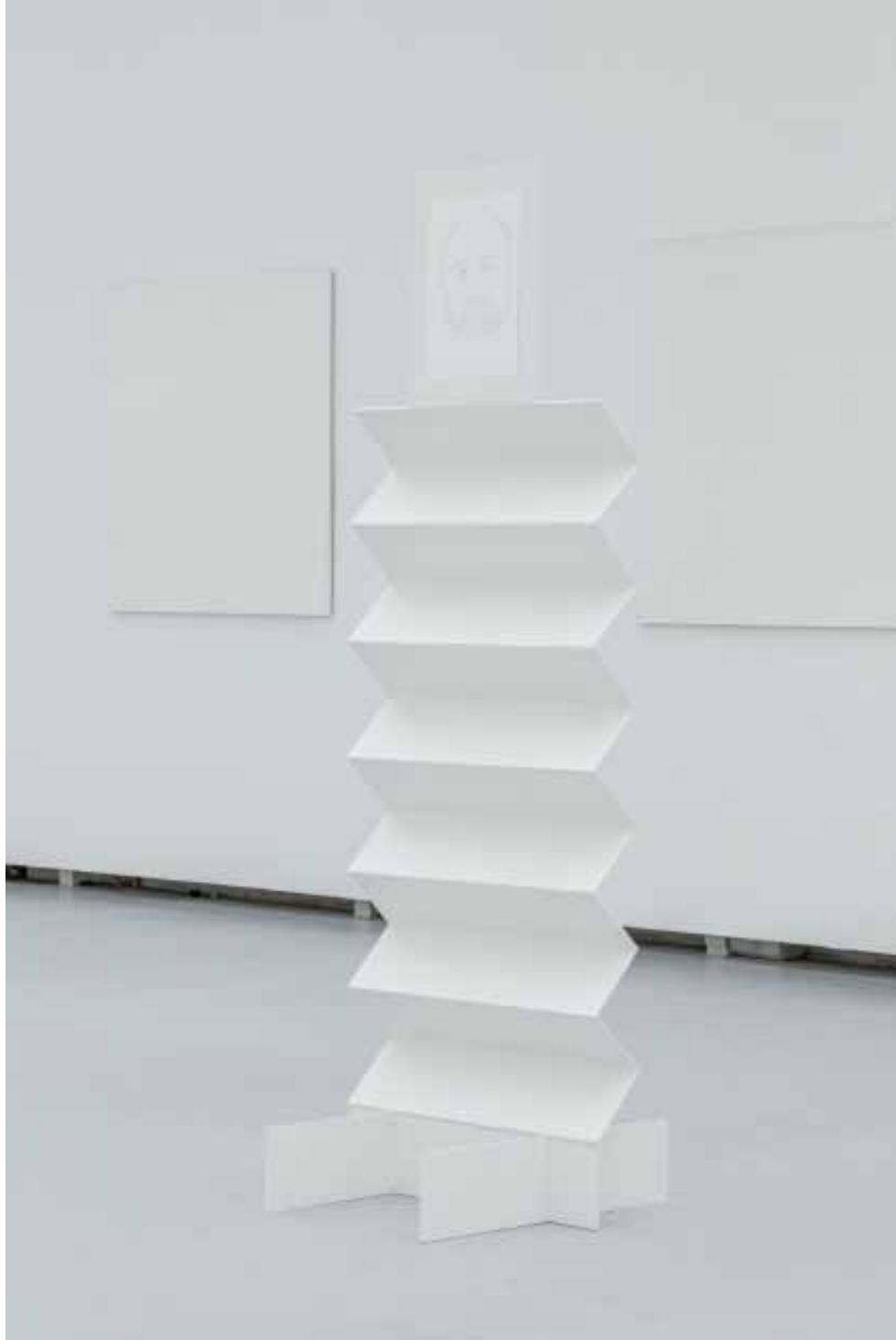
White Suprematism Installation view Contemporary Art Centre (CAC) Vilnius, Lithuania 2016