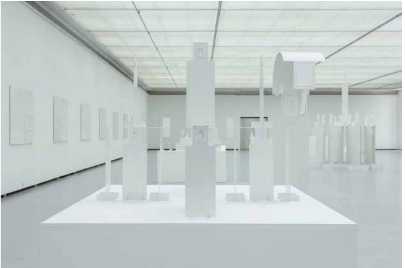
White Suprematism Installation view Contemporary Art Centre (CAC) Vilnius, Lithuania 2016