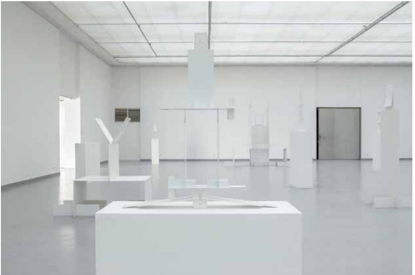
White Suprematism Installation view Contemporary Art Centre (CAC) Vilnius, Lithuania 2016