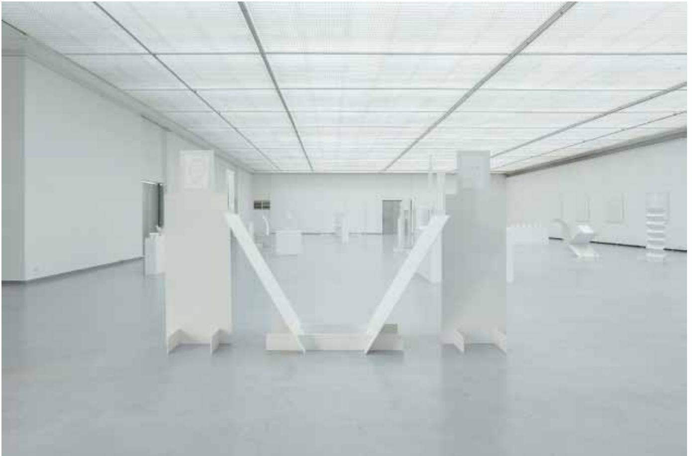
White Suprematism Installation view Contemporary Art Centre (CAC) Vilnius, Lithuania 2016