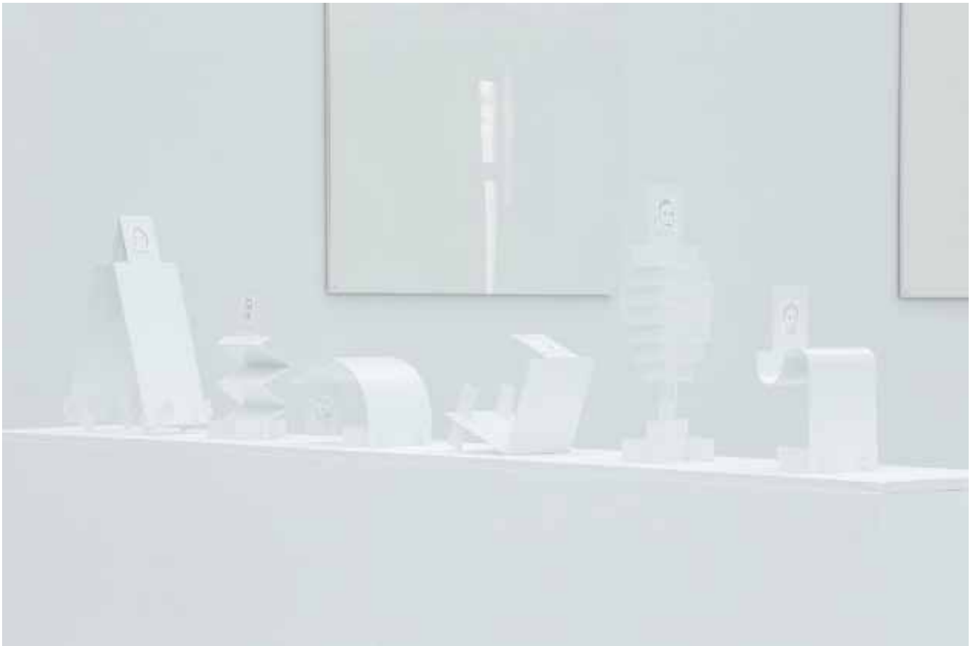
White Suprematism Installation view Contemporary Art Centre (CAC) Vilnius, Lithuania 2016