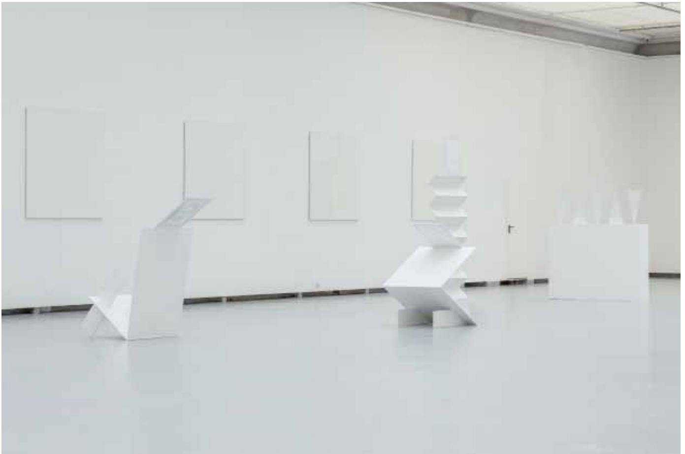
White Suprematism Installation view Contemporary Art Centre (CAC) Vilnius, Lithuania 2016