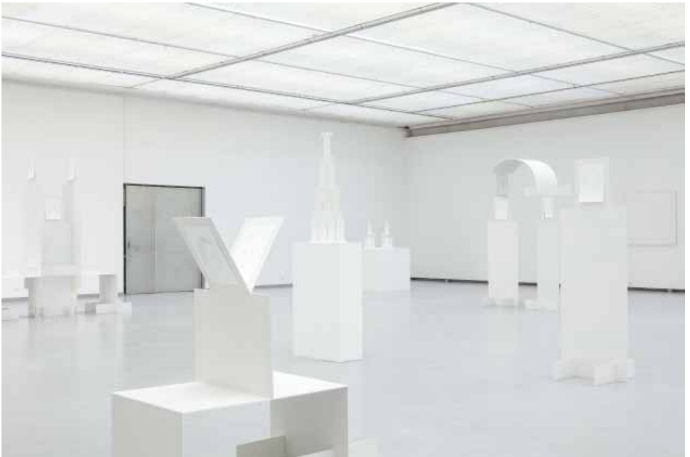
White Suprematism Installation view Contemporary Art Centre (CAC) Vilnius, Lithuania 2016