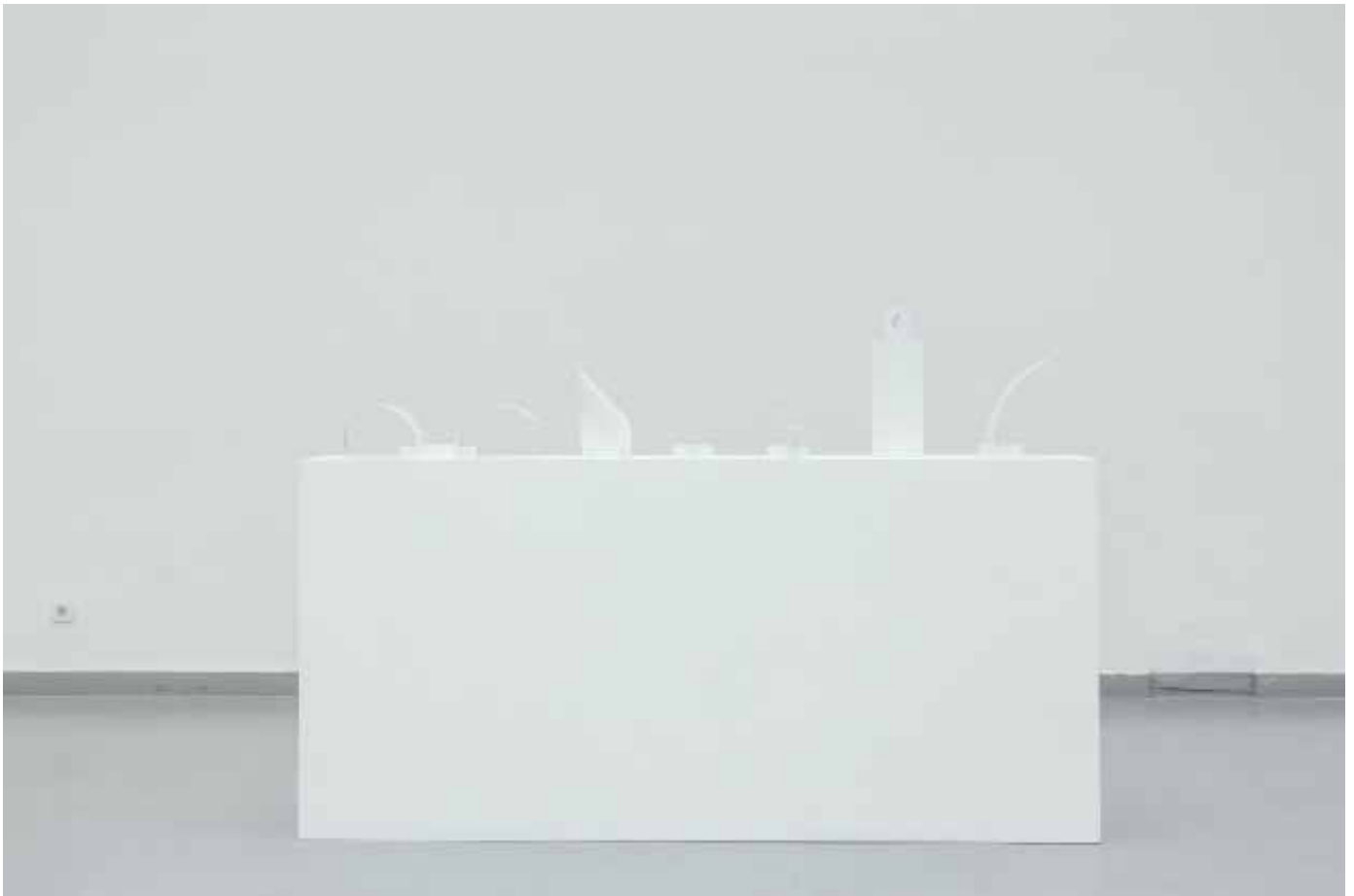
White Suprematism Installation view Contemporary Art Centre (CAC) Vilnius, Lithuania 2016