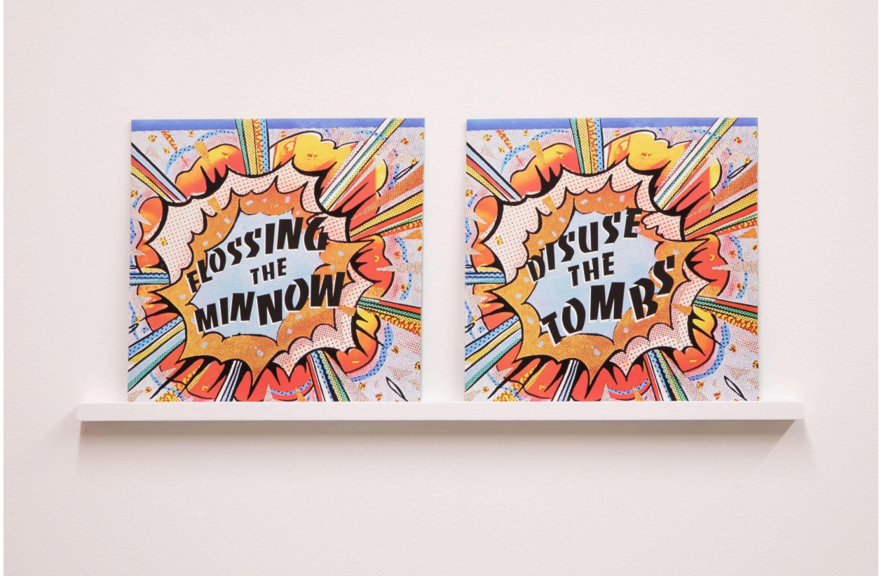
Darren Bader Document (11*) dimensions variable

The work is a document, *perhaps the eleventh of its kind. The document is in fact 10 very similar documents, each provided to the owner on a schedule agreed upon between the owner and the artist.