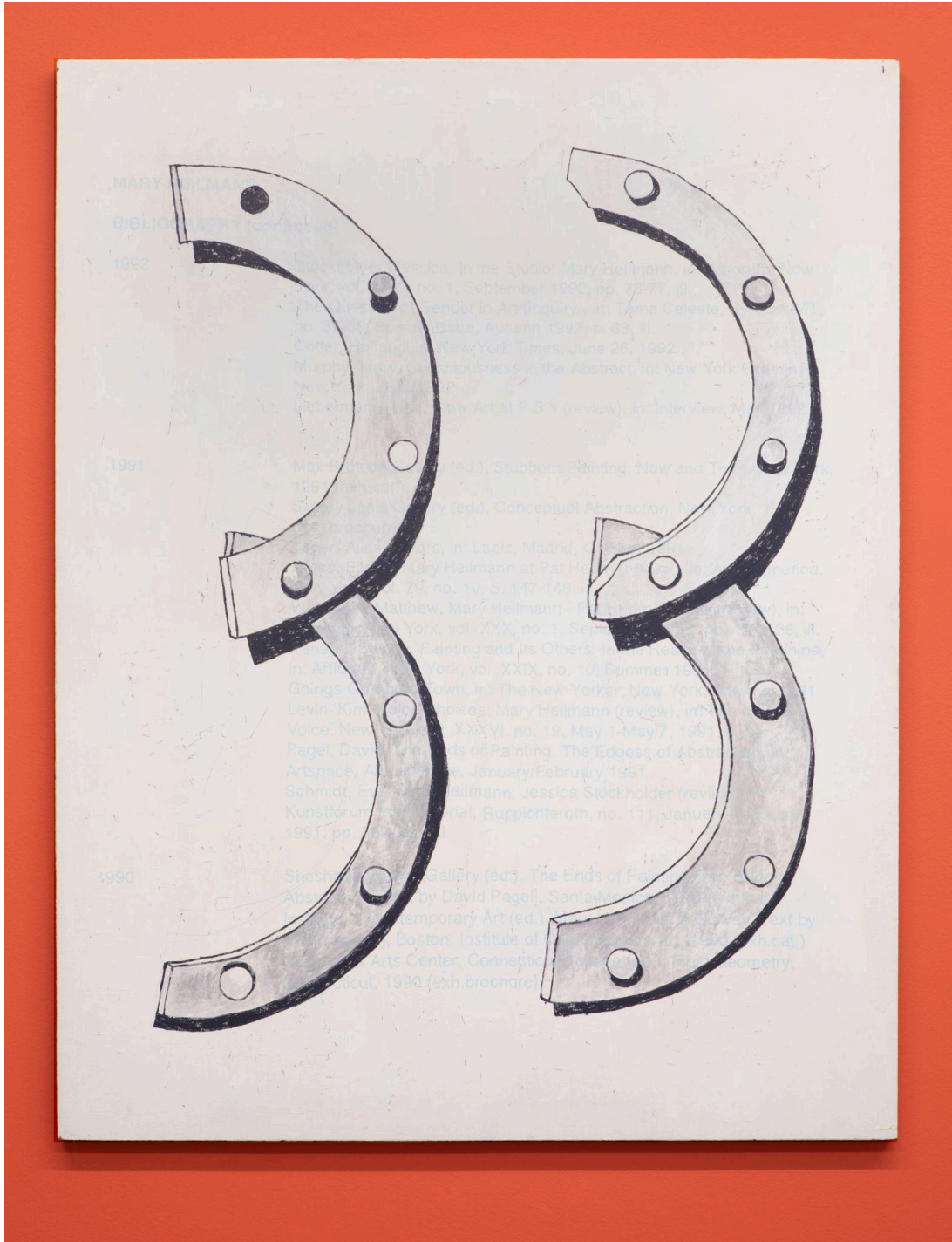
Brian Sharp Untitled (MH w/33) , 2019 oil, marble dust on linen over panel 48 x 36 inches