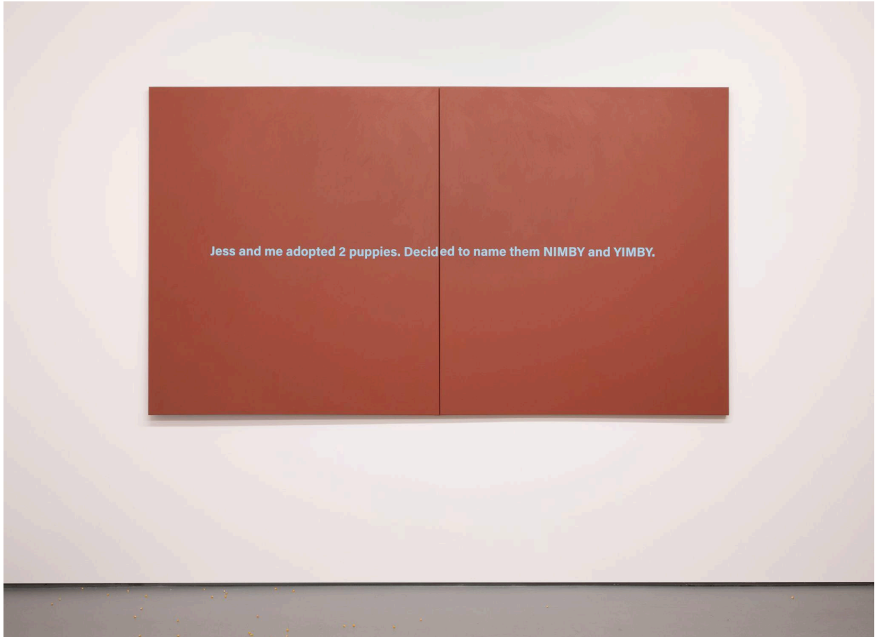
Darren Bader Document (10*) 54 x 96 x 1 1/4 in.

The work is a document, *perhaps the tenth of its kind.