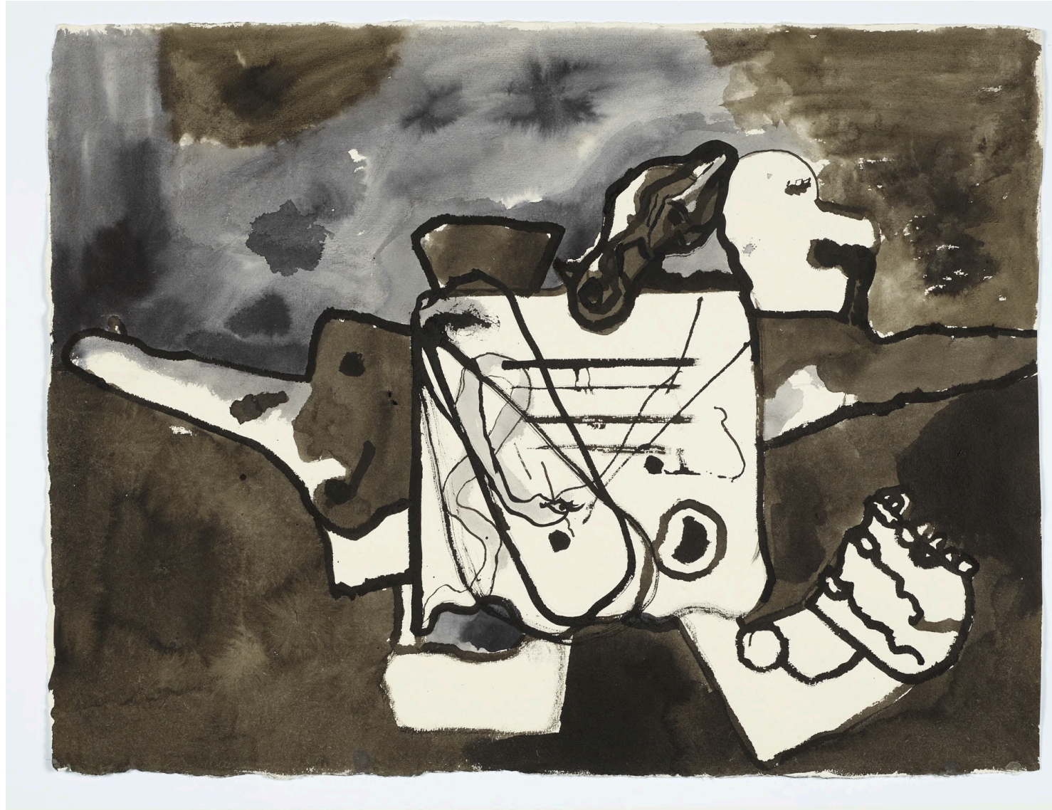
Joe Bradley & Tobias Pils Untitled 2024 Ink on paper 56 x 74,5 cm