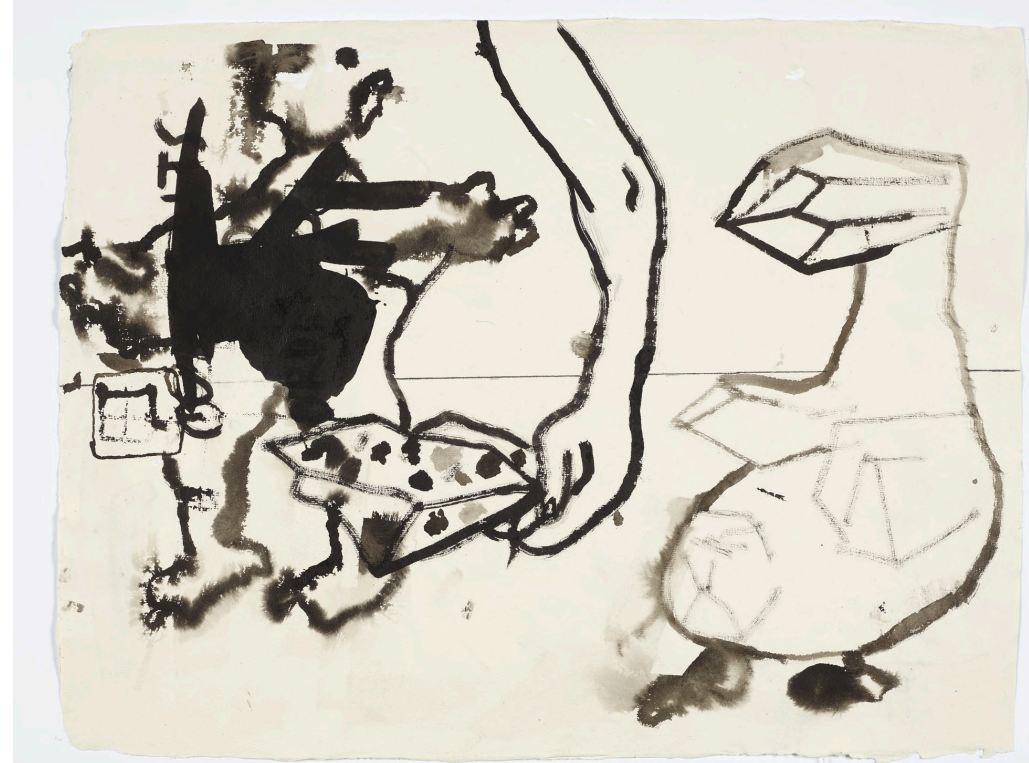
Joe Bradley & Tobias Pils Untitled 2024 Ink on paper 56,5 x 73,8 cm