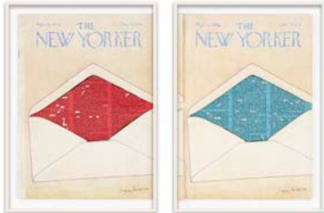
A window view by Hannah Weiner, 2021 (The New Yorker, May 14, 1979, page 26 "Goings On About Town")

2 archival pigment prints, framed behind museum glass