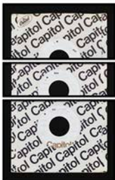
A poem by repetition by Larry Eigner (Capitol s/w), 2021

each: 86,1 × 67,3 (total dimension: 86,1 x 210 cm)