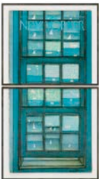
A window view by Langston Hughes (Boats), 2021 (The New Yorker, July 11th, 1977, page 23 "The Talk Of The Town - Garland Jeffreys") 2 archival pigment prints, framed behind museum glass 55,3 × 65,5 cm, 63 × 65,5 cm (total dimension: 116 x 65,5 cm)