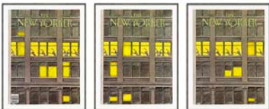
A window view by Vsevolod Nekrasov (Dancing), 2021 (The New Yorker, March 21th, 1983, page 26 "Goings On About Town")

86,1 × 63,2 cm, 99 × 69,6 cm (total dimension: 99 × 143 cm)