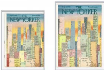
A window view by Robert Creeley (Skyline), 2021 (The New Yorker, September 8th, 1962, page 2 "Goings on about Town")

83 × 58,4 cm, 83 × 58,6 cm (total dimension: 83 × 126 cm)