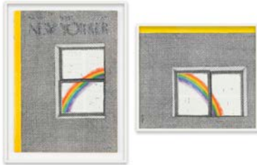
A window view by Tim Dlugos, 2021 (The New Yorker, April 18, 1977, page 4 / 24 "Goings On About Town") 2 archival pigment prints, framed behind museum glass 83 × 62,1 cm, 54,3 × 61,8 cm (total dimension: 83 × 130 cm)