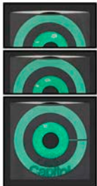
A poem by repetition by Larry Eigner (greentarget), 2021 3 archival pigment prints, framed behind museum glass 31,3 × 66 cm, 30,3 × 66 cm, 64,5 × 66 cm (total dimension: 133,9 × 67,7 cm)