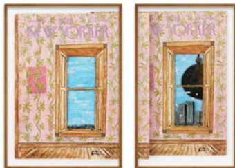
A window view by Anne Waldman, 2021 (The New Yorker, November 14, 1970, page 154 "On and Off the Avenue - Feminine Fashions") 2 archival pigment prints, framed behind museum glass 83 × 58,4, right: 83 × 50,3 cm (total dimension: 83 × 118,7 cm)