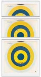
A poem by repetition by Larry Eigner (Capitol yellow target), 2021 3 archival pigment prints, framed behind museum glass 28,7 × 66 cm, 33,9 × 66 cm, 64 × 66 cm (total dimension: 134,4 × 67,7 cm)