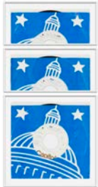
A poem by repetition by Larry Eigner (Capitol blue), 2021 3 archival pigment prints, framed behind museum glass 30,4 × 66,6 cm, 30,6 × 66,6 cm, 65,9 × 66,6 cm (total dimension: 135 × 68,3 cm)