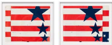
A poem by repetition by Eileen Myles, 2021 2 archival pigment prints, framed behind museum glass 67,6 × 78,3 cm, 67,6 × 81,1 cm (total dimension: 67,6 × 169 cm)