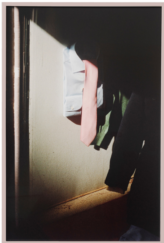
Tongue - from the series Body parts, 2020