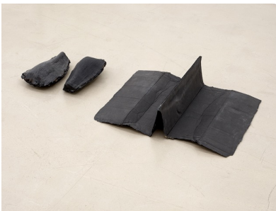
++ ^, 2020 water based resin, pigment each 11 x 40 x 42 cm; 18,5 x 75 x 60 cm total dimension 18,5 x 129 x 60 cm