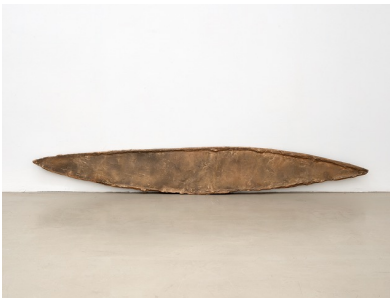
A (2), 2020 Bronze 29 x 196 x 4 cm