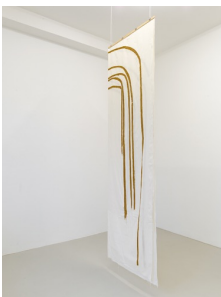
Riso ( b ), 2020

linen, oil paint, wood, metal clips 265 × 97 cm