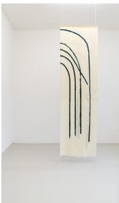
Riso ( v ), 2020

colored silicon, water based resin, chalk, wire 193 x 203 x 237 cm; chalk writing variable