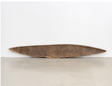
A (3), 2020 Bronze 29 x 196 x 4 cm