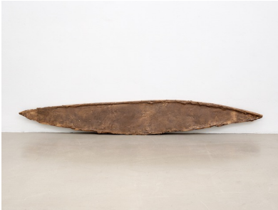
A (1), 2020 Bronze 29 x 196 x 4 cm