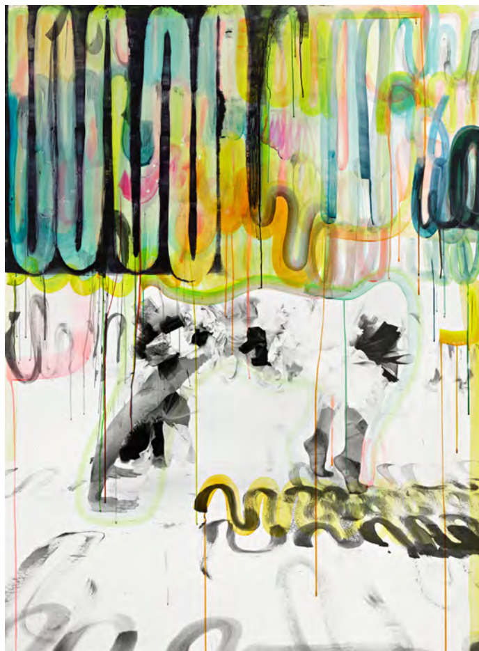
Stage 4, 2020

The combination of aspects of performance and body art, stage design, fashion design, photography, sculpture, and abstract painting is characteristic of Helen Feifel's new series of painted photographs titled "Stages" and her film "Infinite". The production process is always complex and time-consuming, integrating forgotten techniques and combining popular and high culture in a seemingly natural way. At the same time, Helen Feifel's works possess a directness in the sense of the current exhibition title "Visual Truths Are Blunt," a quote from the underground filmmaker Jack Smith.