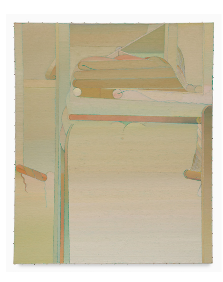
Engelson , 1974 Oil on canvas 46 ¾ × 38 ¾ inches (118.7 × 98.4 cm)