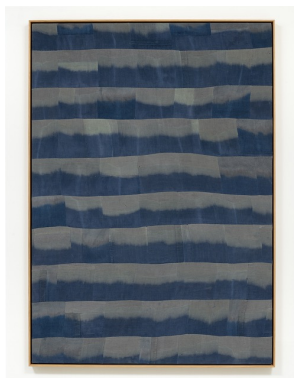
Ayan Farah Fabaceae, 2018 Carob, rust and indigo on linen, 170 x 120 cm