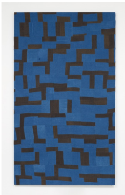
Ayan Farah Desré, 2019 Indigo carob and embroidery on linen and hemp, 240 x 140 cm