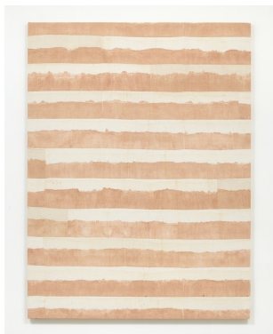
Ayan Farah Wave - Saline, 2018 Terracotta and sea salt on linen, embroidery, 200 x 150 cm