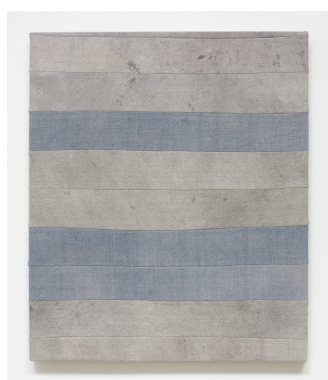
Ayan Farah Untitled (Beachy Head), 2019 clay, chalk, rust and indigo on linen, silk and hemp, 60 x 50 cm