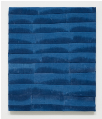
Ayan Farah Sky - Saline, 2019 Indigo and sea salt on linen, 60 x 50 cm

info@kadel-willborn.de www.kadel-willborn.de