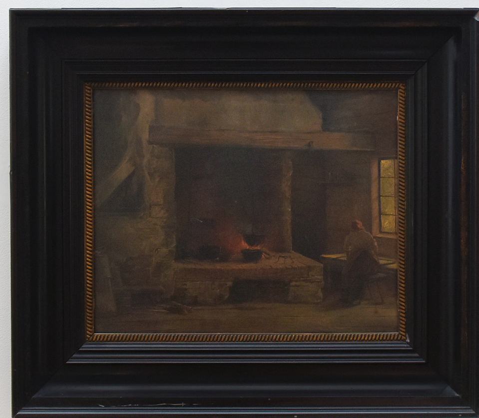
03. Paul Hoecker. Um die Ecke (Au coin de l'âtre) . 1905. Oil on wood. 32cm x 42. Private collection.