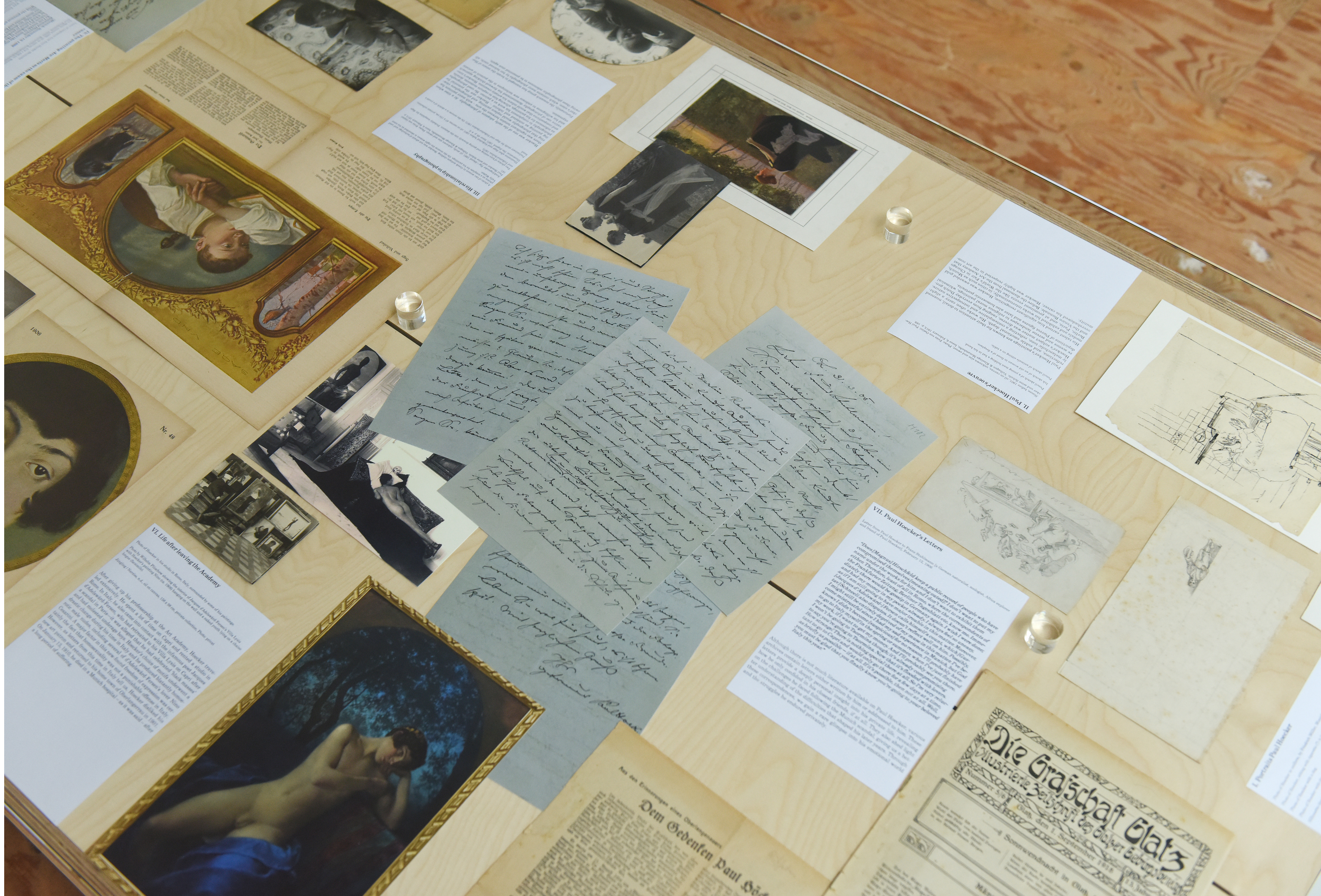
09. Overview of archive material on loan from Forum Queeres Archive München containing photographs, magazines, sketches and additional copies of letters.