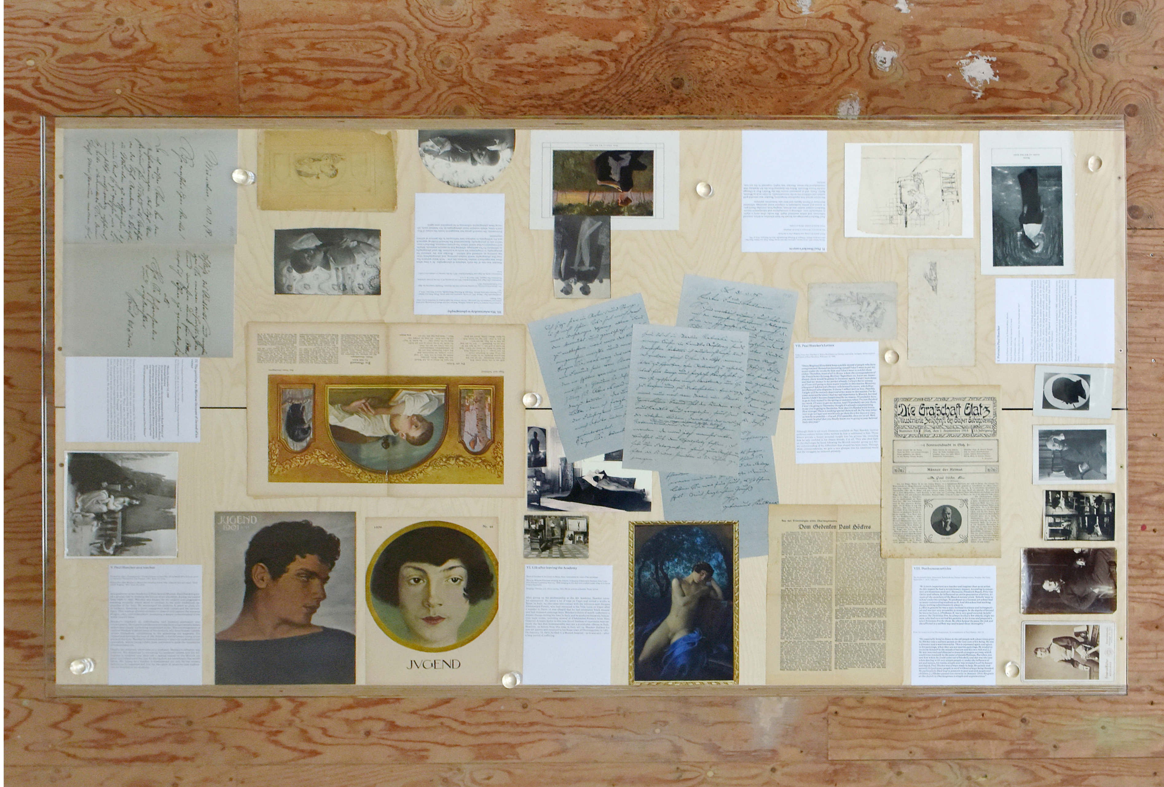
07. Overview of archive material on loan from Forum Queeres Archive München containing photographs, magazines, sketches and additional copies of letters.