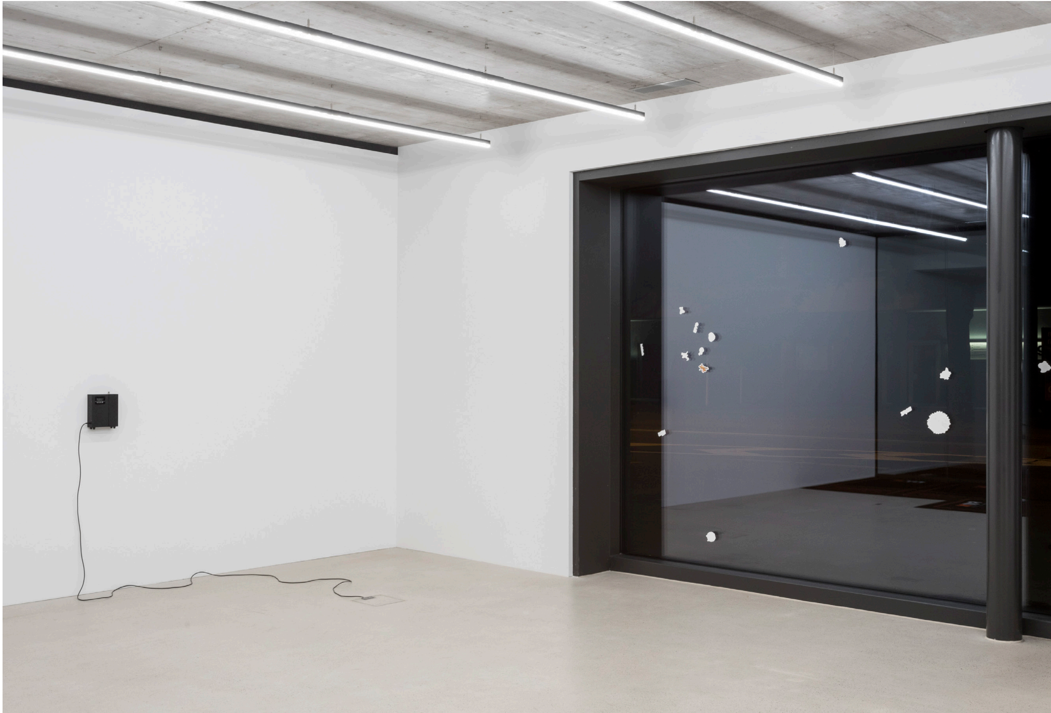
Installation view, Shared Location , at Windhager von Kaenel, Zug, 2024