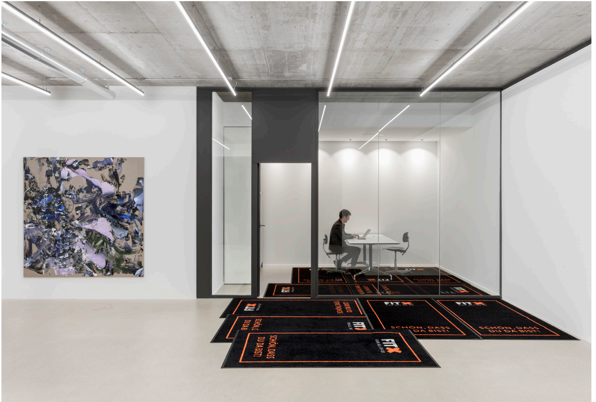
Installation view, Shared Location , at Windhager von Kaenel, Zug, 2024