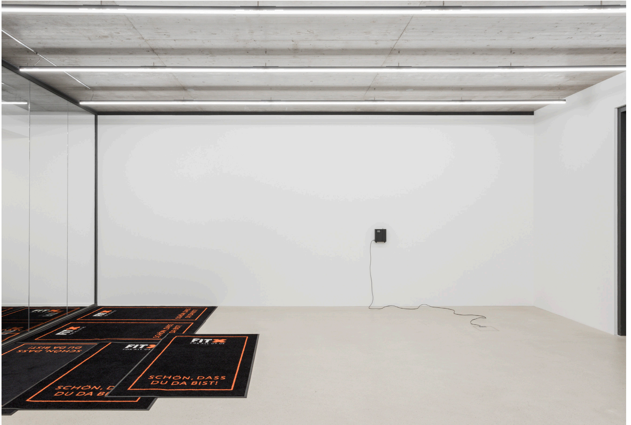
Installation view, Shared Location , at Windhager von Kaenel, Zug, 2024