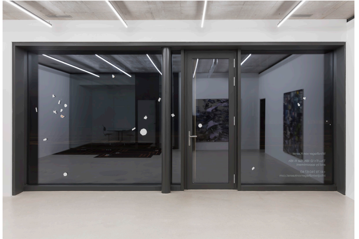
David Moser Intervention-Piece , 2024 Stickers, wite out solution (tipp-ex) Dimension variable