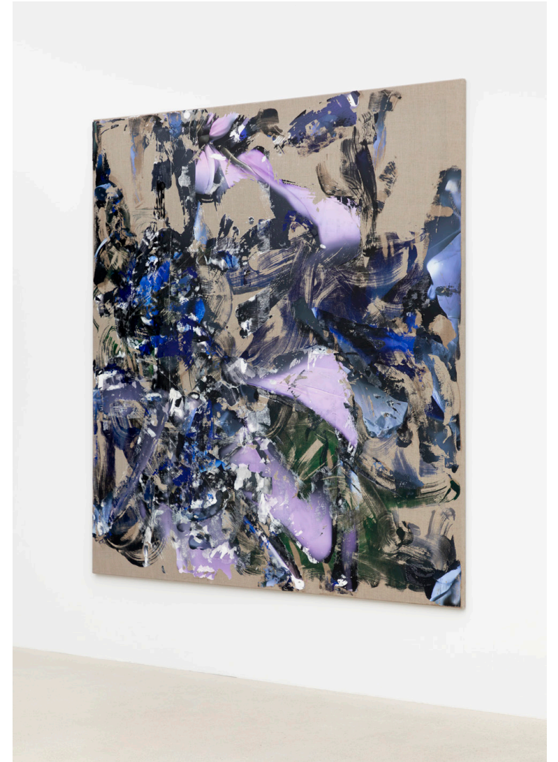
Dorota Gawęda and Eglė Kulbokaitė Grafted Landscapes (b563304ac836a78128f5022f5864), 2024 Gesso and digital ink transfer onto raw linen canvas 180 x 180 x 2cm