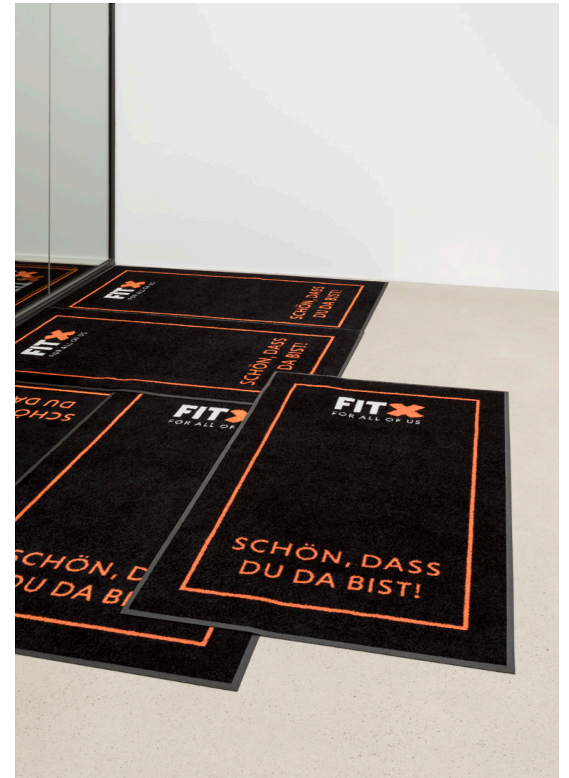
David Moser Doormats, 2023 Doormats/dirt collector Each 200 x 100cm