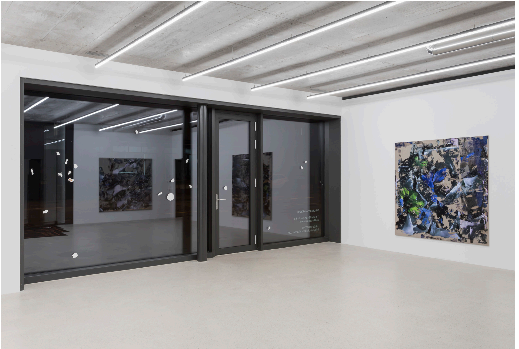
Installation view, Shared Location , at Windhager von Kaenel, Zug, 2024