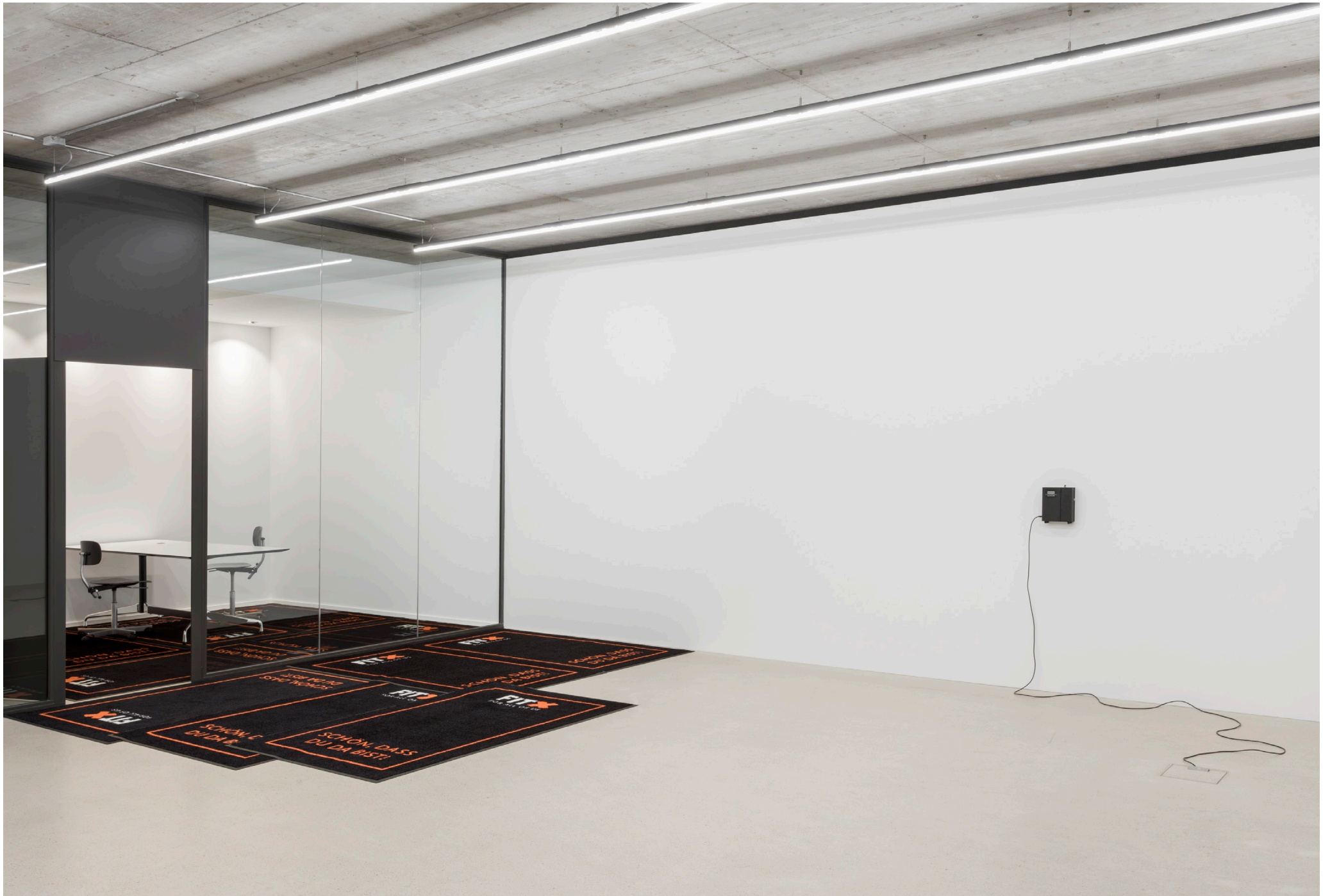
Installation view, Shared Location , at Windhager von Kaenel, Zug, 2024