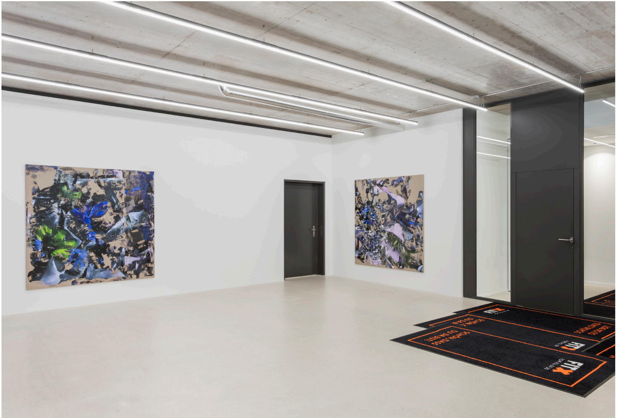
Installation view, Shared Location , at Windhager von Kaenel, Zug, 2024 / Photo: Oliver Kümmerli / Courtesy: the artists and Windhager von Kaenel