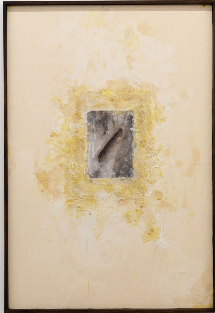
Cooling System 2024

Transfer on canvas, tape, bees wax, palm wax, wood. 178,5 x 126 x 6 cm