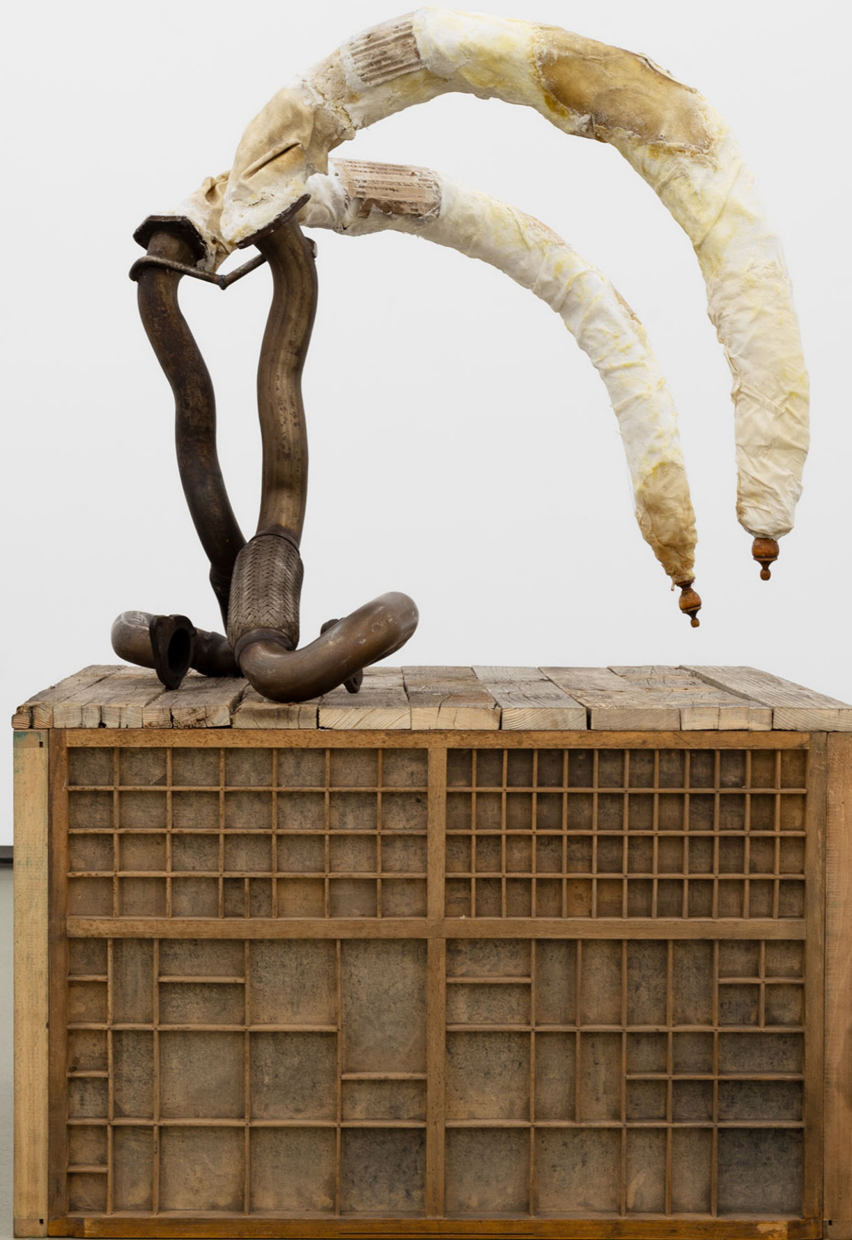
feeding, falling, flying 1