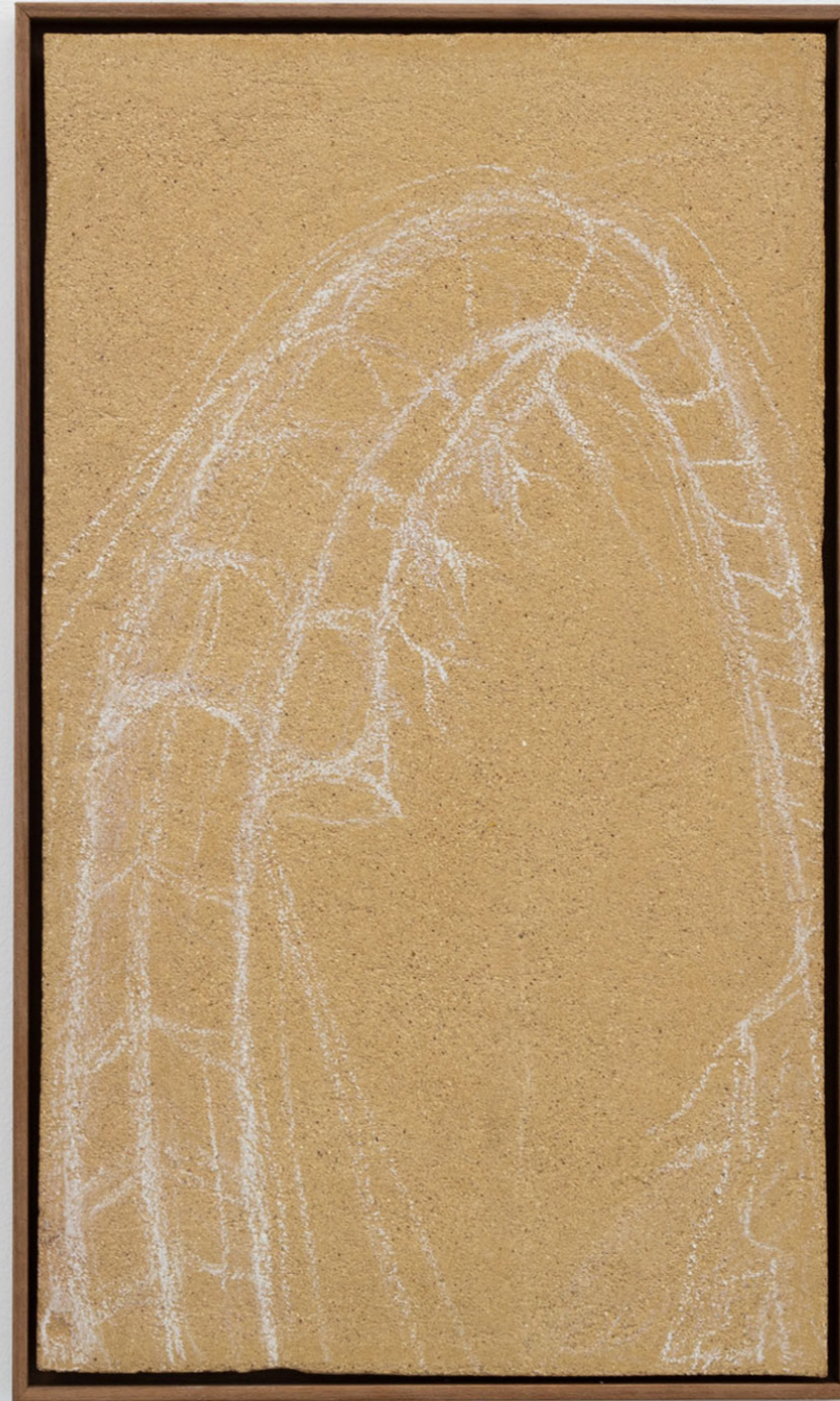
Traction 1 2024 Stoneware, wood. 48 x 30 x 3,5 cm