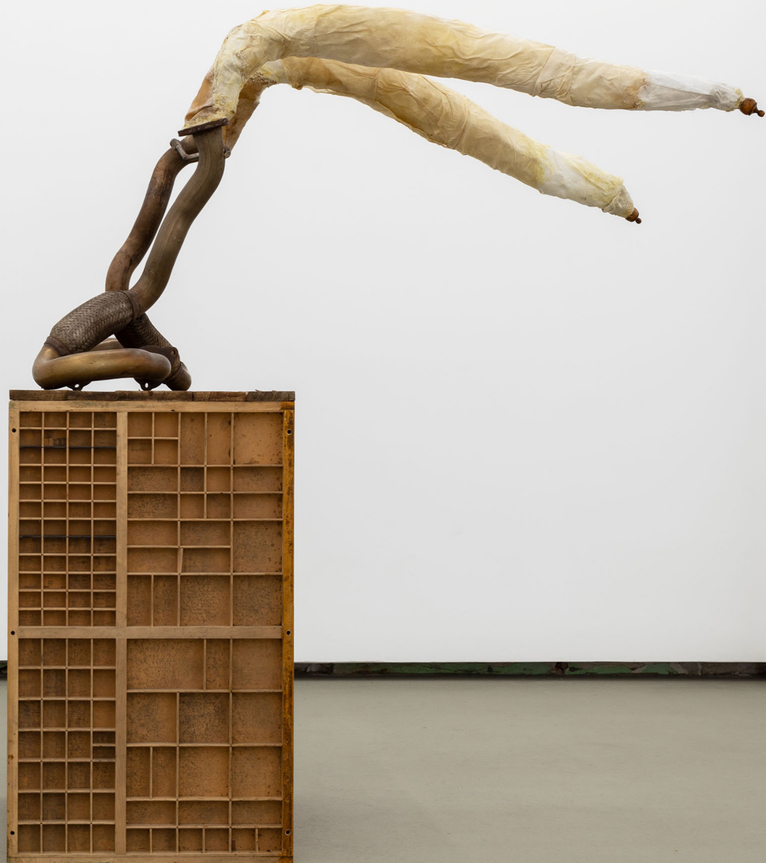
feeding, falling, flying 2