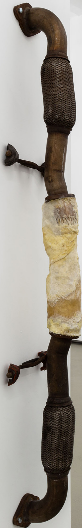
Dos Cantos 2024

Exhausts, gesso, fabric, vellum, palm wax, bees wax, tress resins, cardboard, steel. 135 x 25 x 17 cm