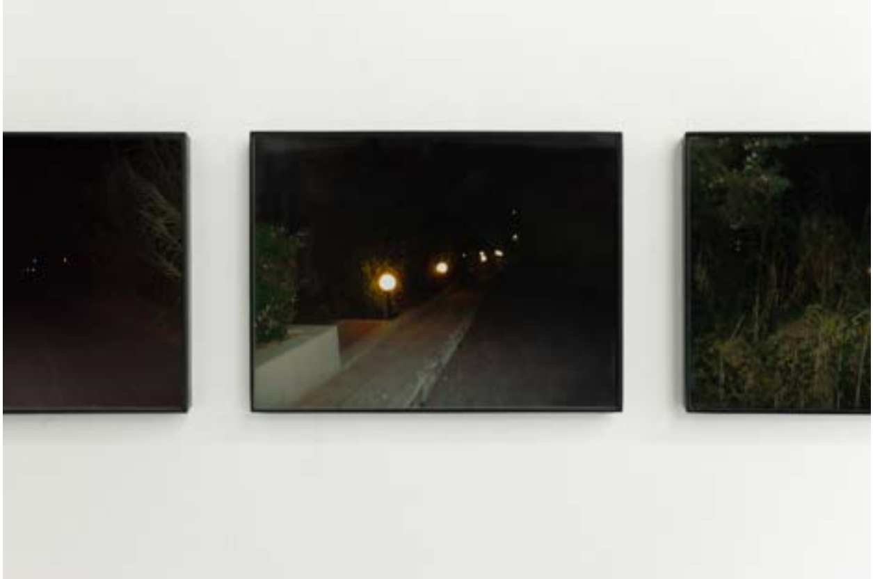
Sara Yukiko Illuminated Path 6" × 8" Inkjet Print on Gloss Paper 2024