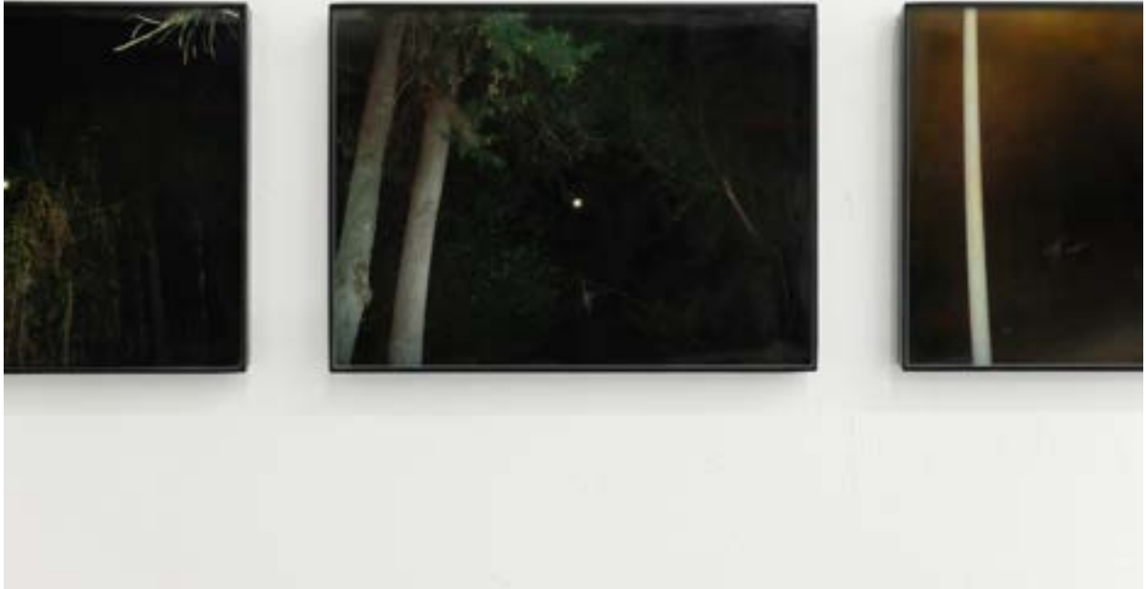
Sara Yukiko Full Moon 2 6" × 8" Inkjet Print on Gloss Paper 2024