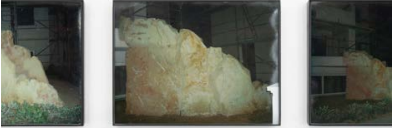
Sara Yukiko Stairs 2 6" × 8" Inkjet Print on Gloss Paper 2024