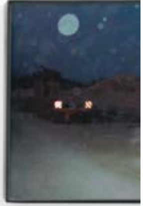
Sara Yukiko Loading Ramps 6" × 8" Inkjet Print on Gloss Paper 2024