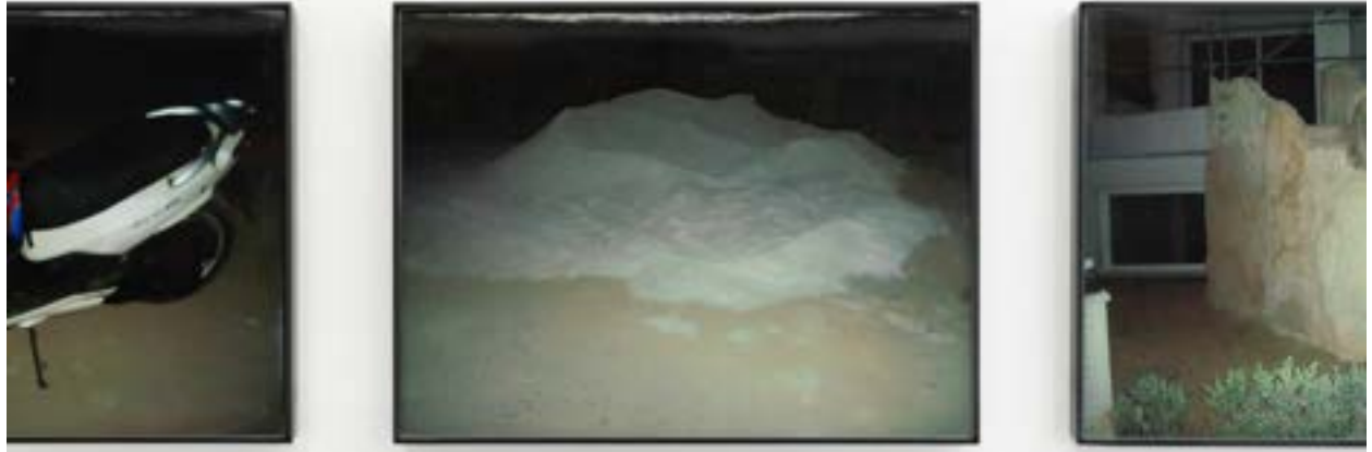
Sara Yukiko Sand Mound 1 6" × 8" Inkjet Print on Gloss Paper 2024