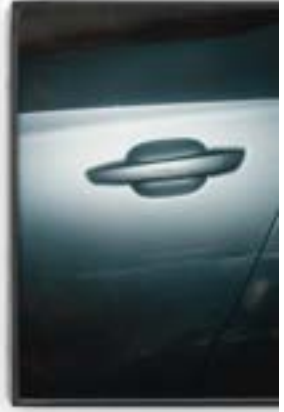
Sara Yukiko Rental Car Damage (Mirror, Left) 6" × 8" Inkjet Print on Gloss Paper 2024