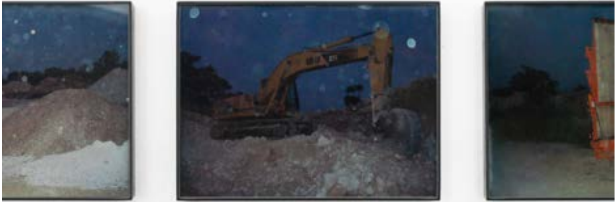
Sara Yukiko CAT 6" x 8" Inkjet Print on Gloss Paper 2024