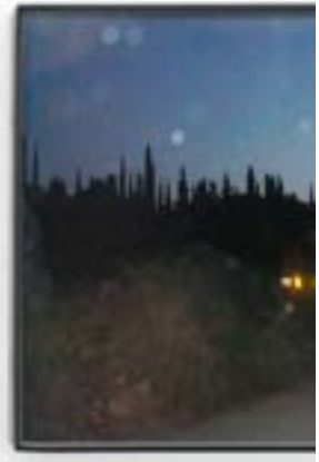
Sara Yukiko Reflectors 1 6" × 8" Inkjet Print on Gloss Paper 2024