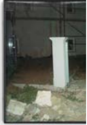
Sara Yukiko Stairs 5 6" × 8" Inkjet Print on Gloss Paper 2024