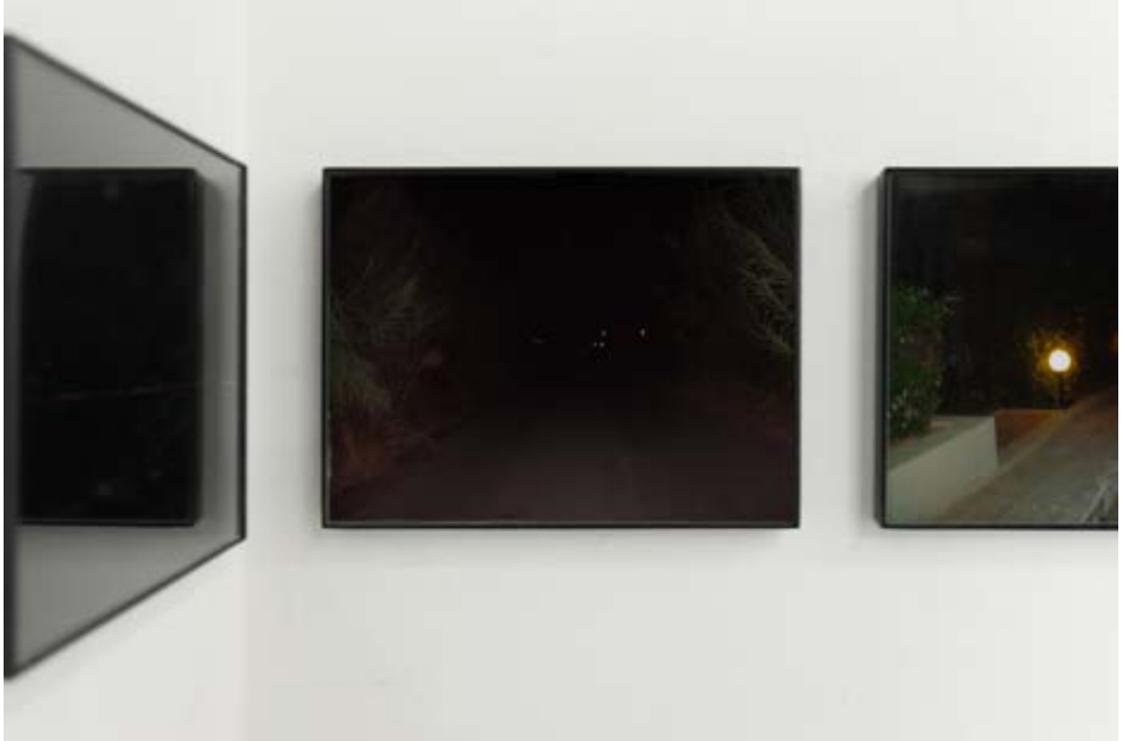
Sara Yukiko Dark Path 6" × 8" Inkjet Print on Gloss Paper 2024