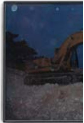
Sara Yukiko Construction Site 6" × 8" Inkjet Print on Gloss Paper 2024