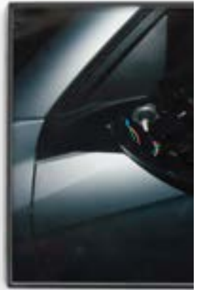
Sara Yukiko Sand Mound 2 6" × 8" Inkjet Print on Gloss Paper 2024