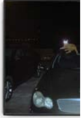
Sara Yukiko Reflectors 2 6" × 8" Inkjet Print on Gloss Paper 2024