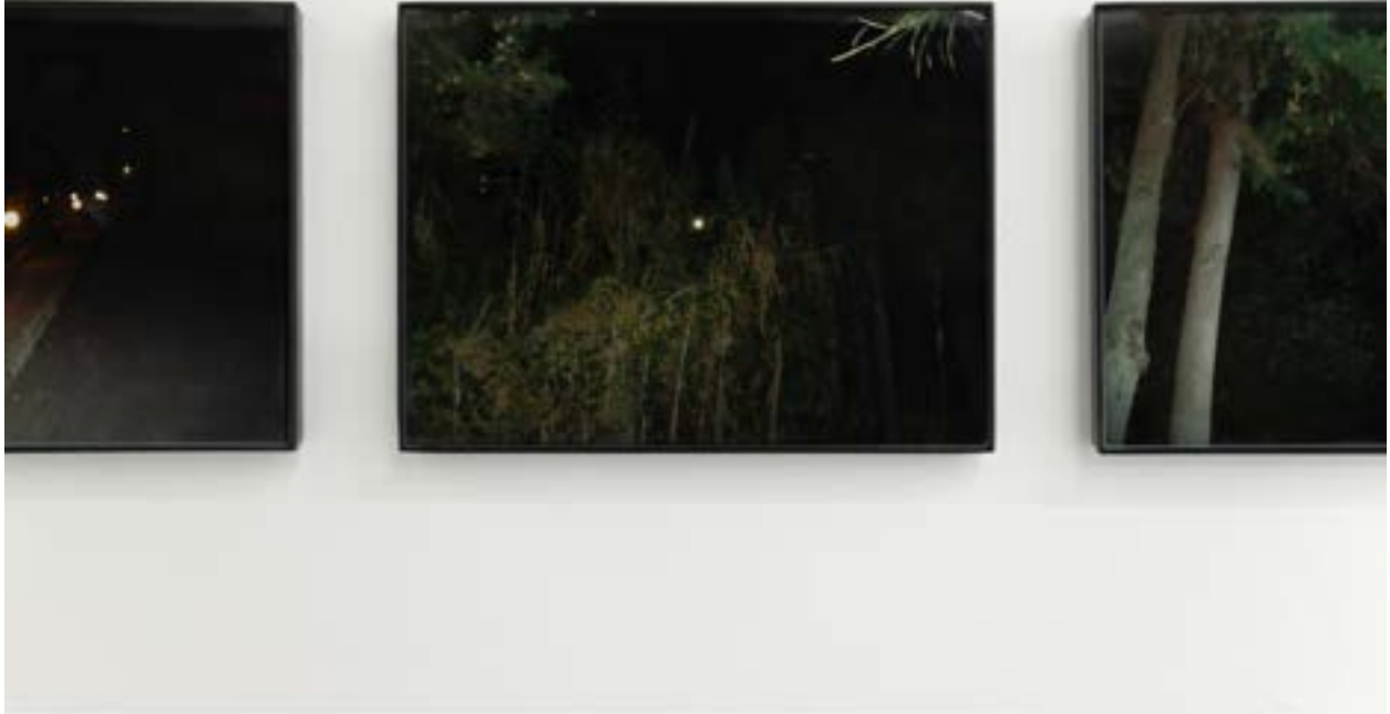
Sara Yukiko Full Moon 1 6" × 8" Inkjet Print on Gloss Paper 2024