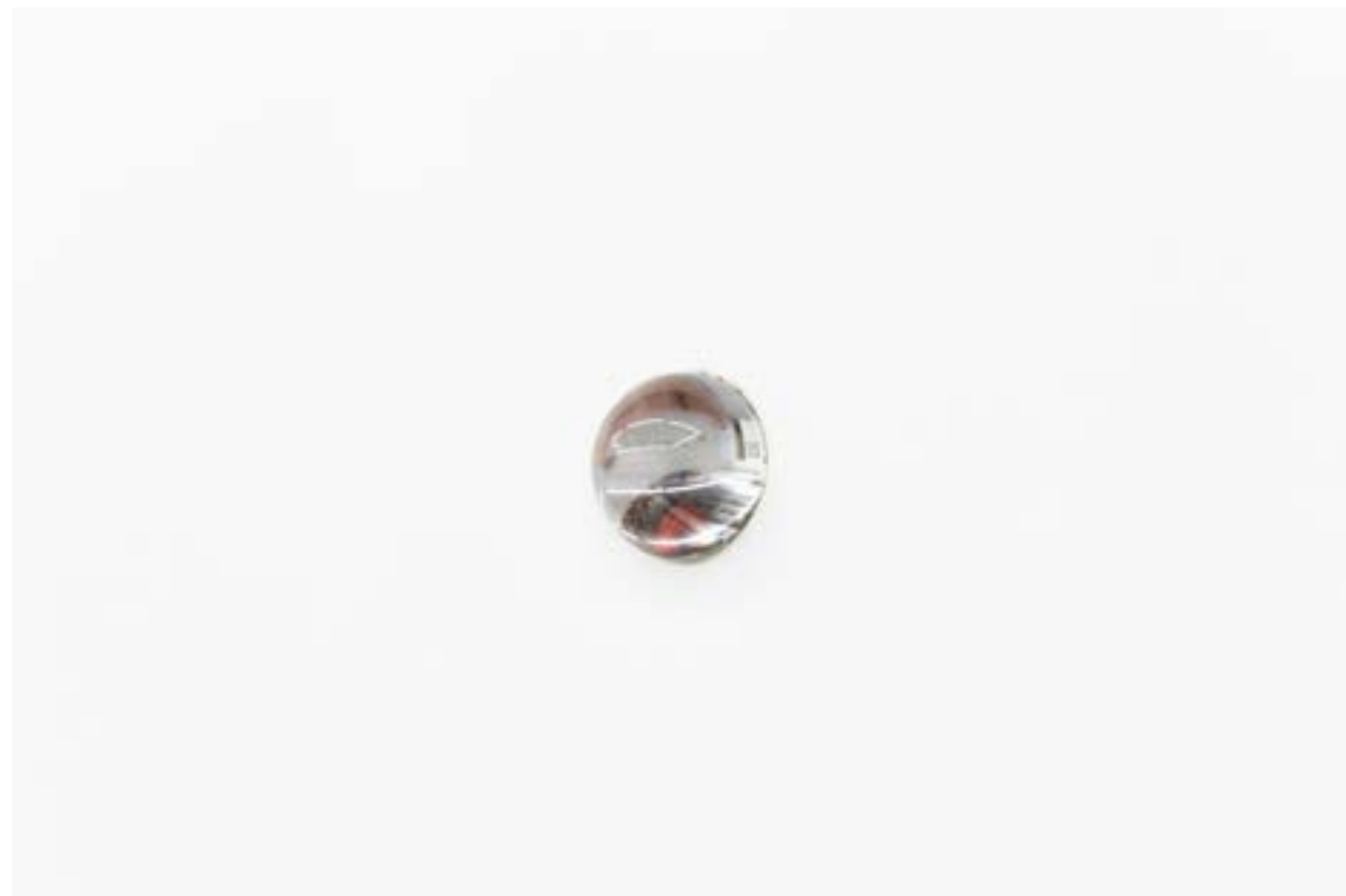
Alli Melanson Transparent Eye (I) 2" x 2" x 2" Acrylic dome, digital print 2024