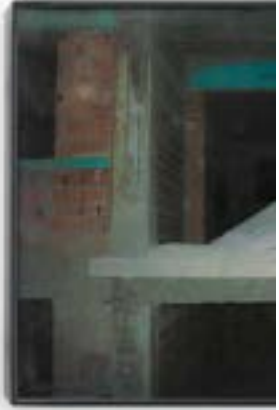
Sara Yukiko Entryway 6" × 8" Inkjet Print on Gloss Paper 2024