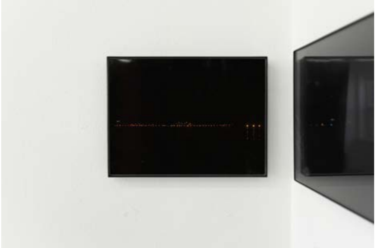
Sara Yukiko Artificial Horizon 6" × 8" Inkjet Print on Gloss Paper 2024