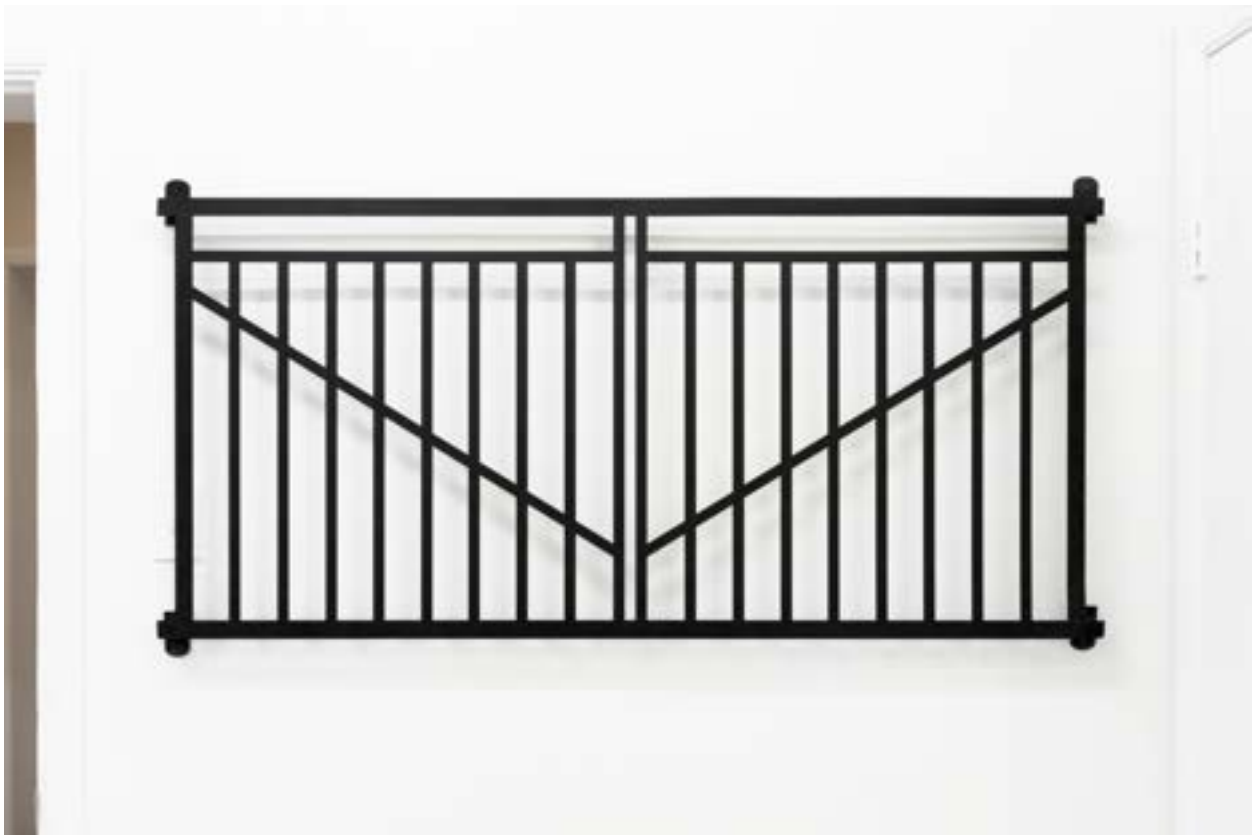
Jesse Benson Survival Sculpture 7 (Faux Discontent) ~ 29" x 55.5" x 2.5" Powder-coated Metal 2024