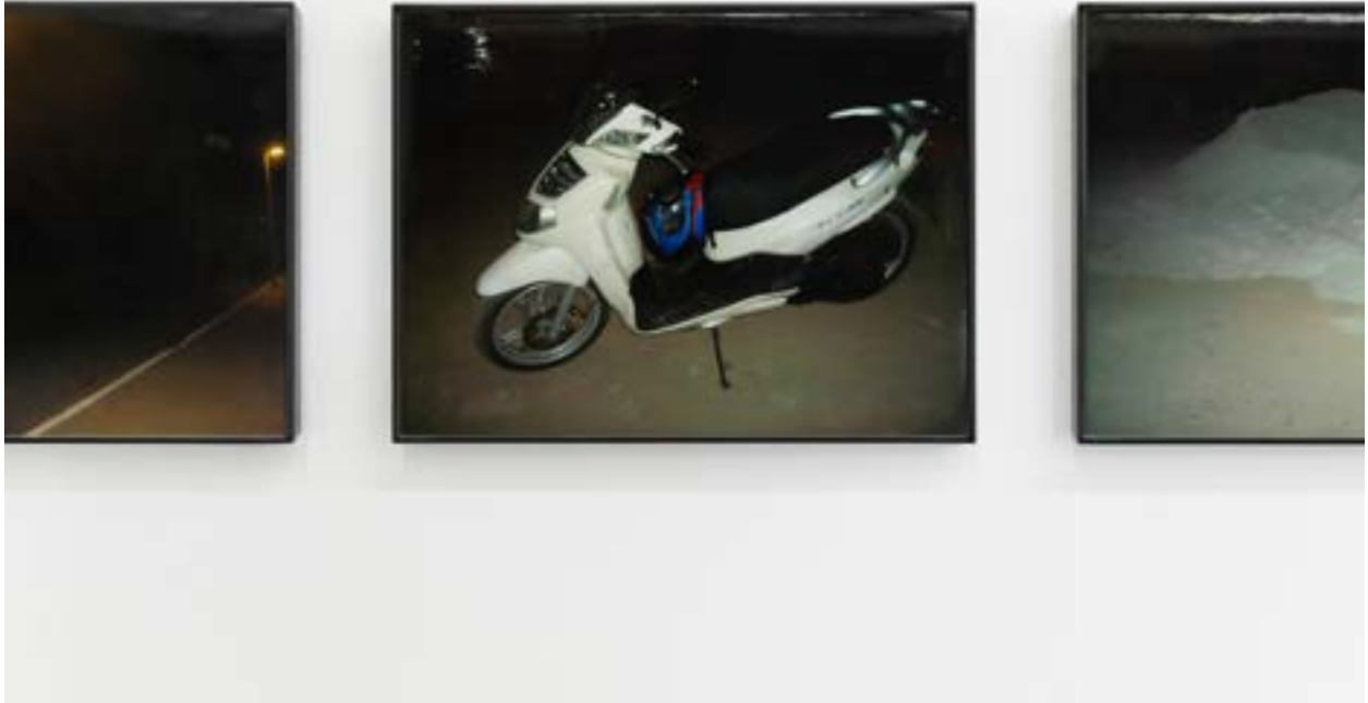
Sara Yukiko Bike (Near) 6" × 8" Inkjet Print on Gloss Paper 2024