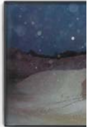
Sara Yukiko Rental Car Damage (Rear Door, Left) 6" × 8" Inkjet Print on Gloss Paper 2024