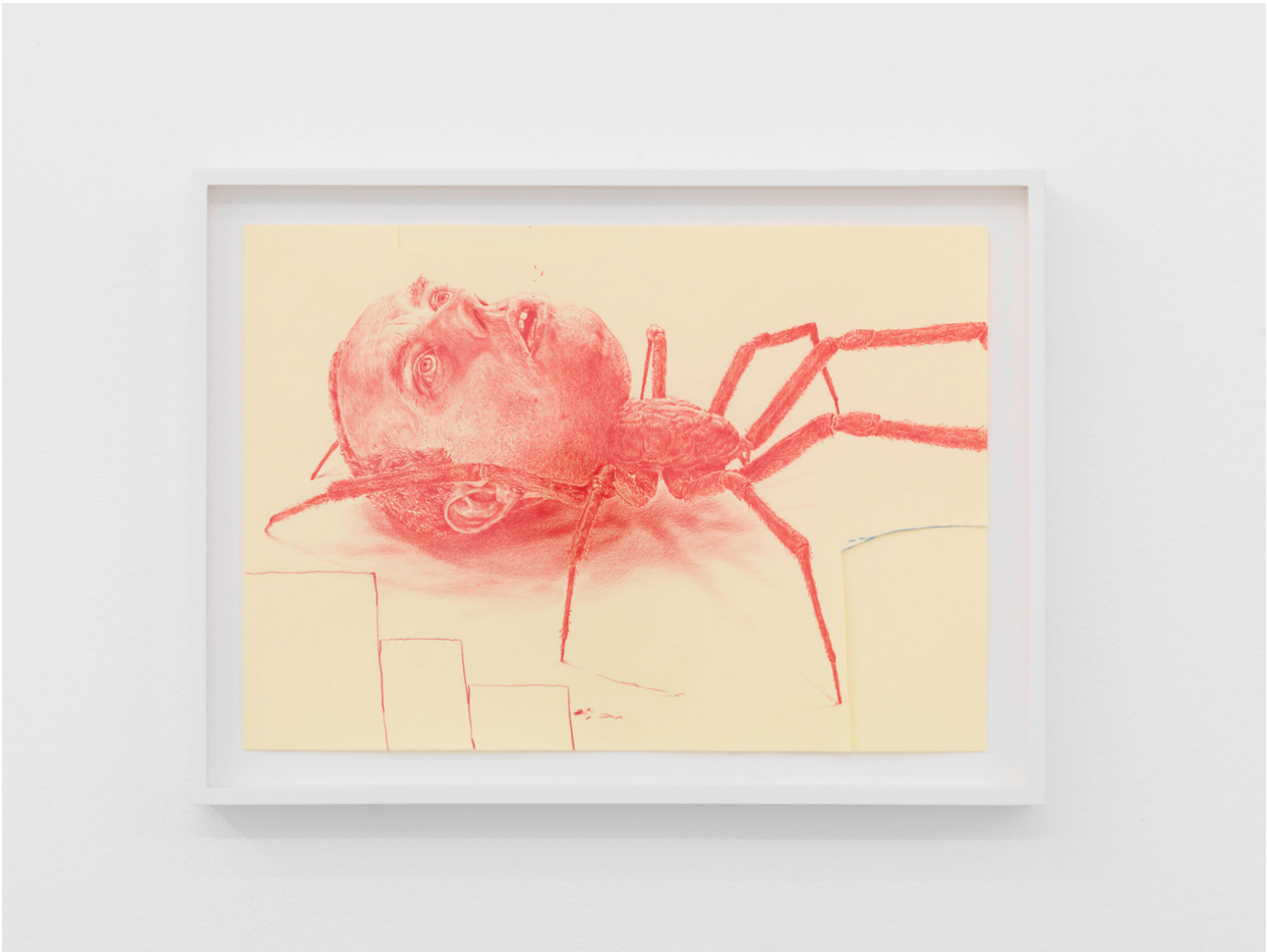
Ed Atkins: Copenhagen #6 . 2023. Coloured pencil on paper. 35,5 x 48 cm. Courtesy of the artist & Cabinet, London.