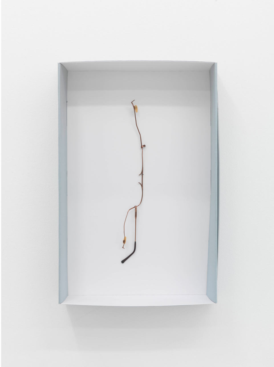
Win McCarthy: Val (Shoebox Portrait) . 2023. Archival shoebox, eyeglass frame. 56 x 37 x 13 cm. Courtesy of the artist & Galerie Neu, Berlin.