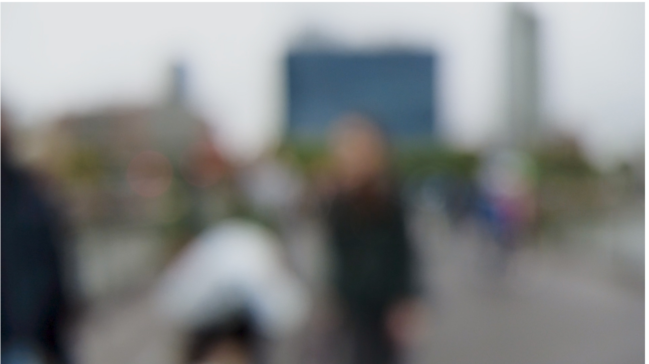
Dora Budor: Passive Recreation , (still). 2024. HD video. 7 minutes, 8 seconds.