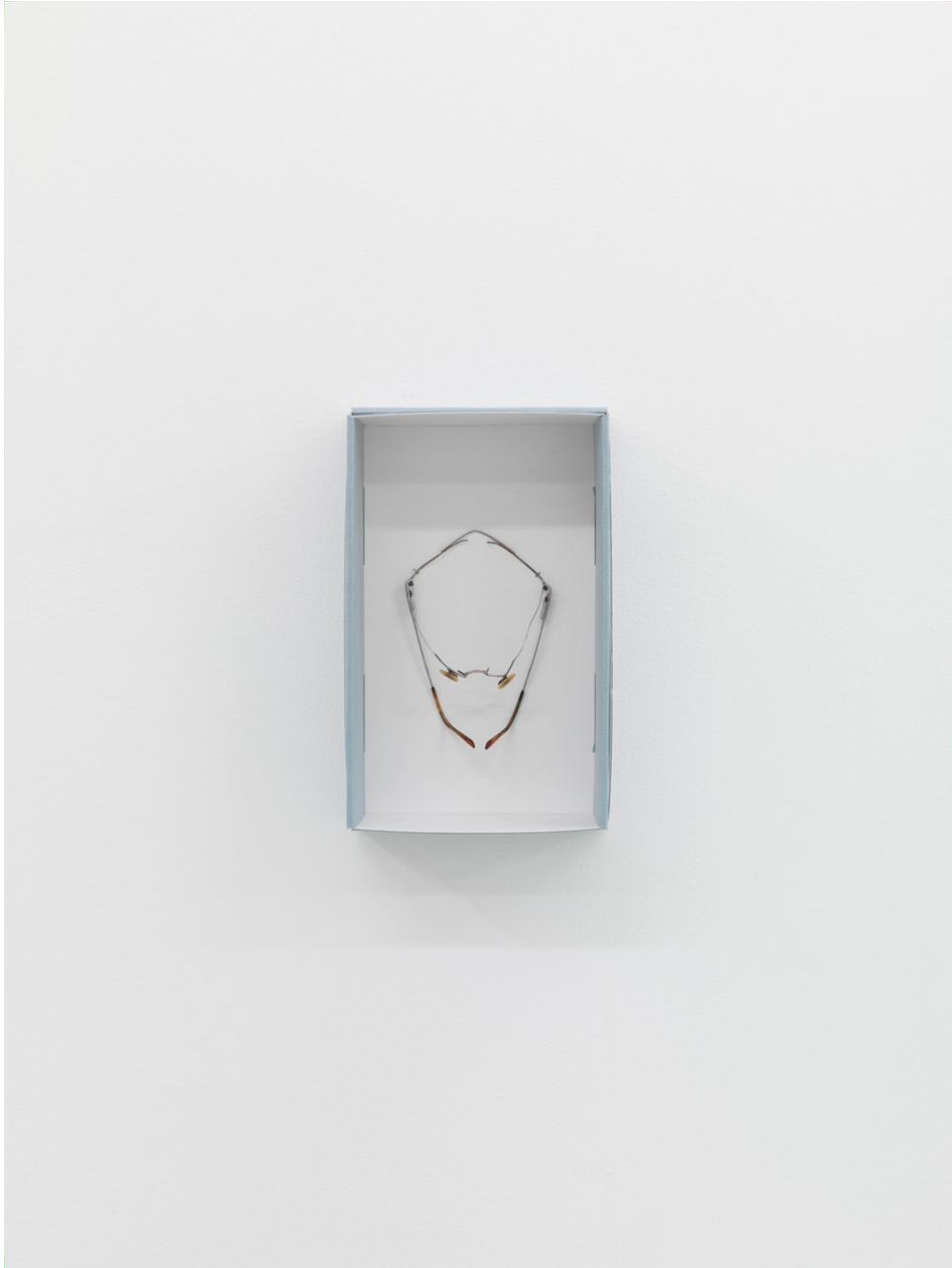
Win McCarthy: Lucas (Shoebbox Portrait) . 2023. Archival shoebox, eyeglass frame. 31 x 20 x 11 cm.