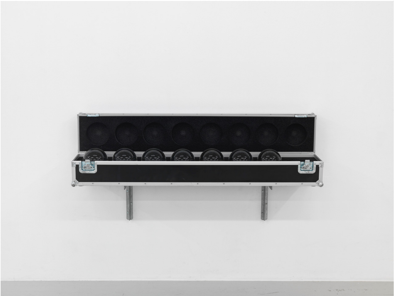
Henrik Plenge Jakobsen: Eight ball (the Seine) . 2009. Crystal glass, flight case, one ball thrown in the river Seine. 35 x 140 x 22 cm.