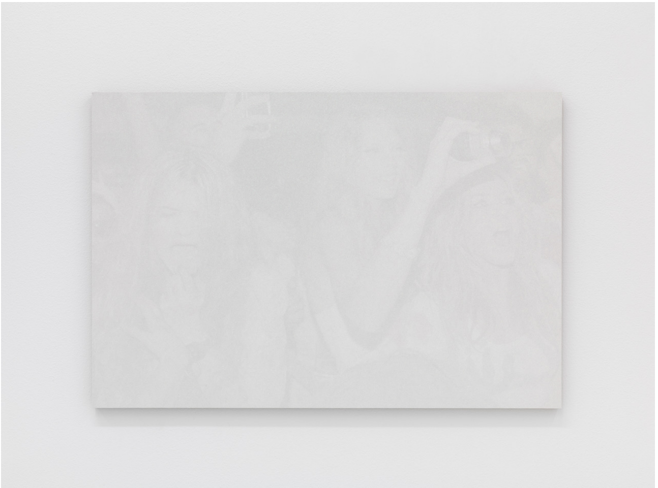
Jakob Ohrt: Untitled . 2024. Inkjet on custom glitter paper mounted on MDF. 53 x 80 cm.