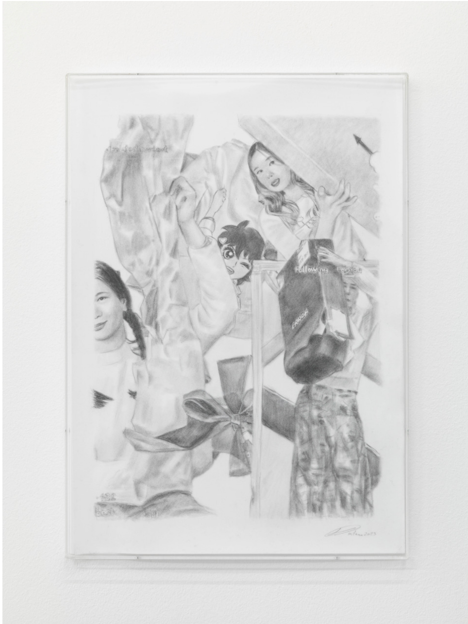
Jijia Zhang: Best Haul . 2023. Pencil on paper mounted in perspex frame. 50 x 35 cm.