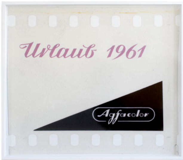
DOUGLAS GORDON Holiday Painting #1 2010