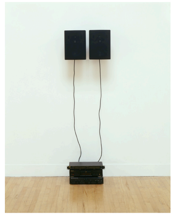
SEB PATANE So this song kills fascists 2007