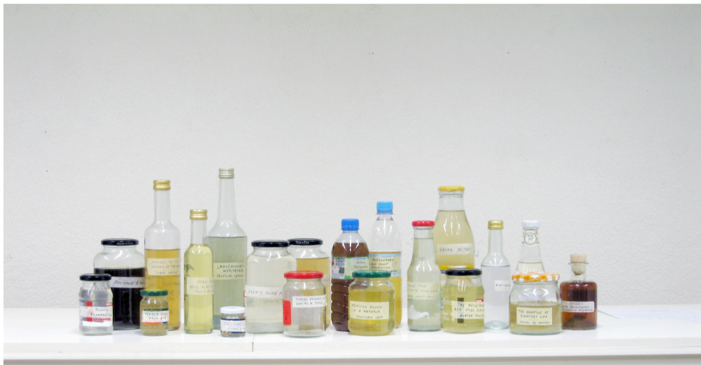
KIRSTEN PIEROTH Bottled 2010