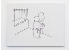
Steve Bishop Chutchie (bathroom 2) , 2015 Pen on canvas 30 x 40 cm (11 3/4 x 15 3/4 inches)