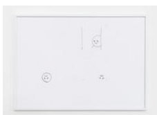
Steve Bishop Chutchie (feeling shy) , 2015 Pen on Paper 21.5 x 30 cm (8 1/2 x 11 3/4 inches)