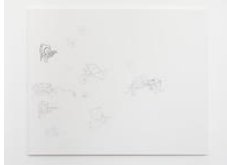
Steve Bishop Chutchie (Zz) , 2015 Pen on canvas 61 x 76 cm (24 x 29 7/8 inches)