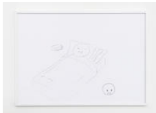
Steve Bishop Chutchie (5 more minutes) , 2015 Pen on Paper 21.5 x 30 cm (8 1/2 x 11 3/4 inches)