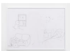
Steve Bishop Chutchie (home alone) , 2015 Pen on Paper 21.5 x 30 cm (8 1/2 x 11 3/4 inches)