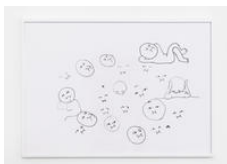
Steve Bishop Chutchie (confusion) , 2015 Pen on paper 21.5 x 30 cm (8 1/2 x 11 3/4 inches)