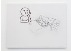
Steve Bishop Chutchie (Texting) , 2015 Pen on canvas 30 x 40 cm (11 3/4 x 15 3/4 inches)