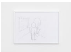
Steve Bishop Chutchie (bathroom) , 2015 Pen on paper 15.5 x 21.5 cm (6 1/8 x 8 1/2 inches)