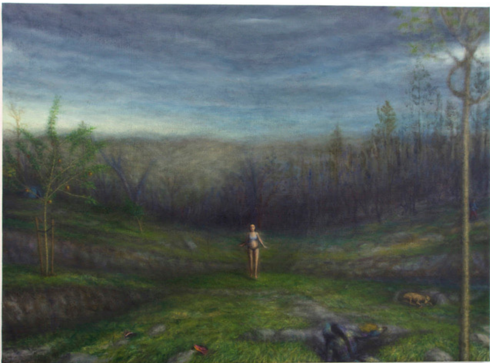
For Annie 2024