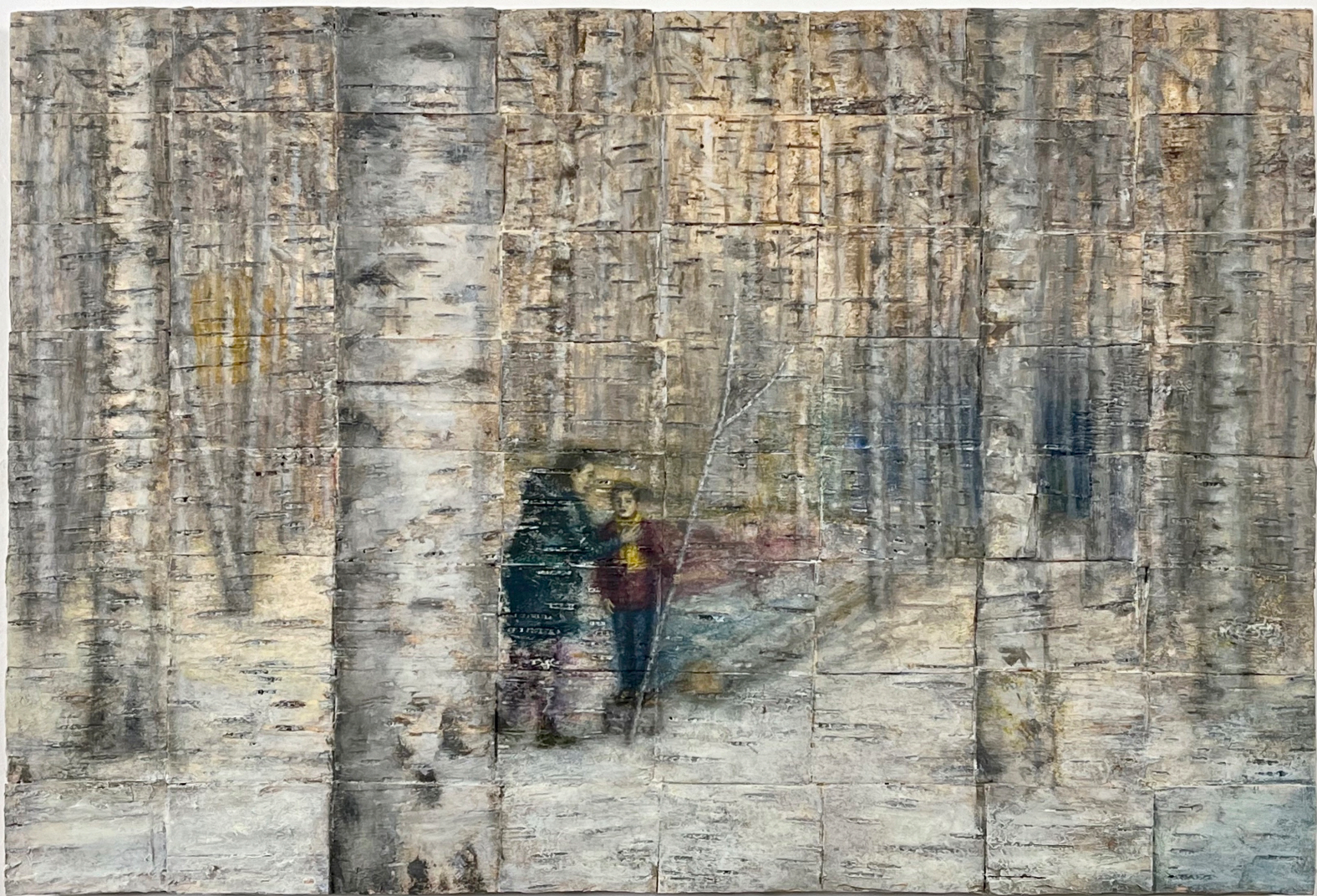
Out of body 2024

Oil, beeswax, resin on birch bark 27,5 × 56 cm