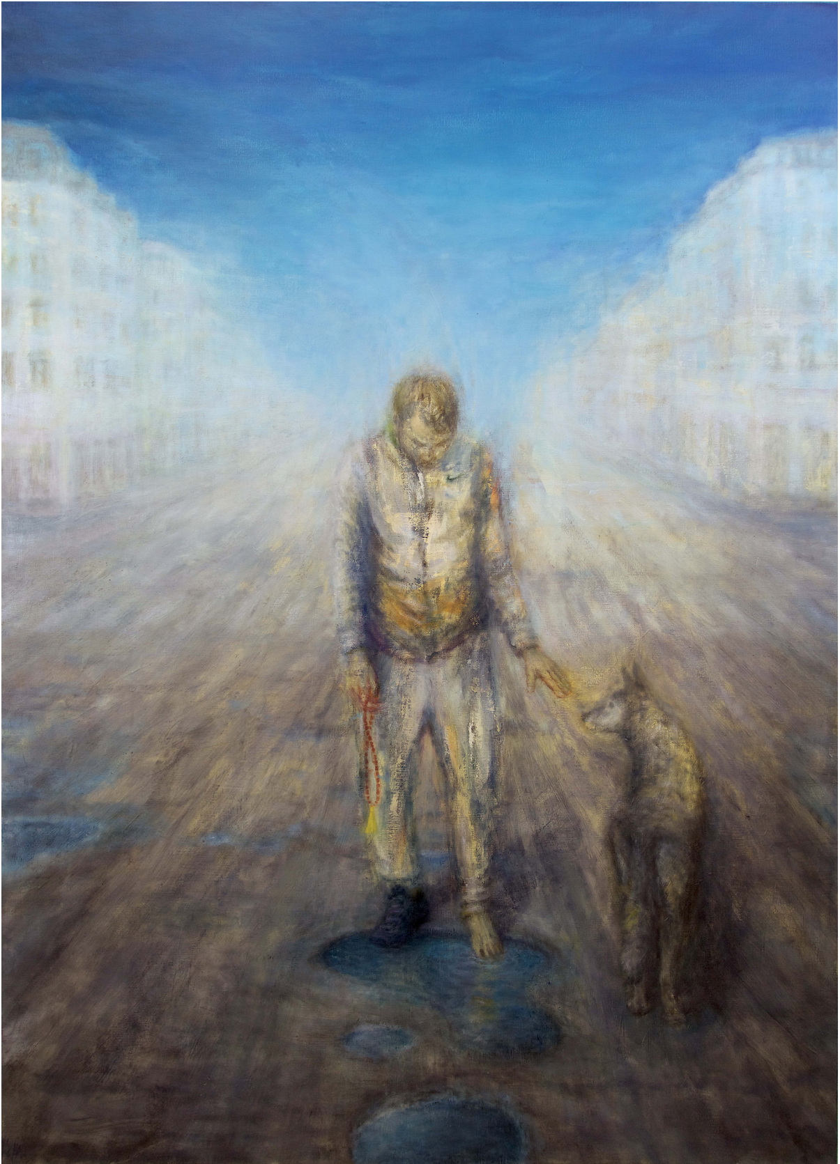
The odd one out 2023

Oil, beeswax, resin on canvas 185 × 125 cm