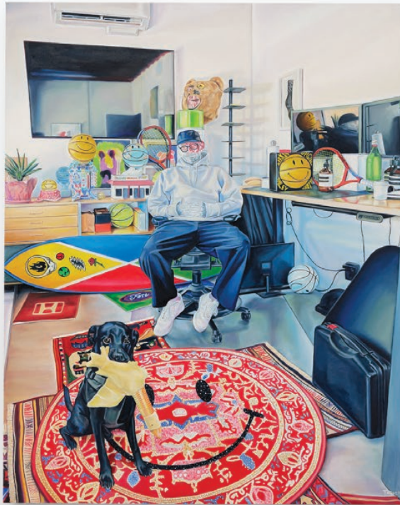
Troy Lamarr Chew II All Smiles , 2024 Oil on canvas 60 x 48 in 152.4 x 121.9 cm (TLC-P24-05) $ 20,000