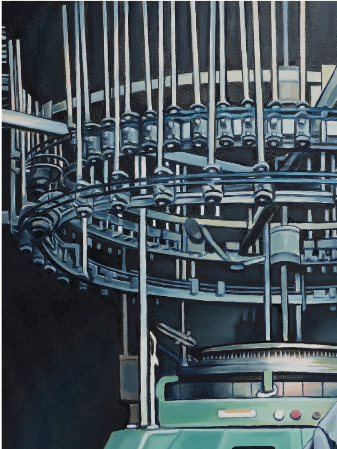
Troy Lamarr Chew II The T-shirt Pusher (detail), 2024 Oil on canvas 48 x 48 in 121.9 x 121.9 cm (TLC-P24-06) $ 20,000