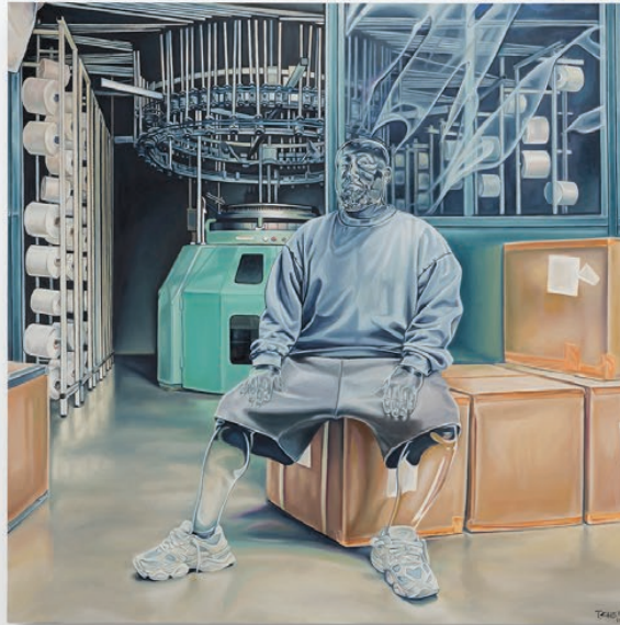
Troy Lamarr Chew II The T-shirt Pusher , 2024 Oil on canvas 48 x 48 in 121.9 x 121.9 cm (TLC-P24-06) $ 20,000