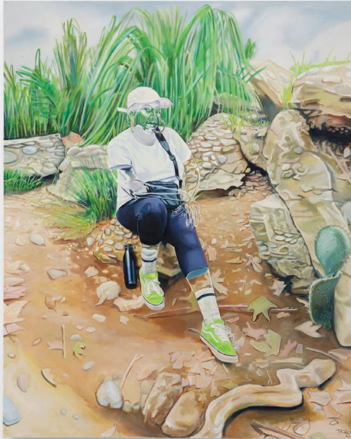
Troy Lamarr Chew II Office Break , 2024 Oil on canvas 60 x 48 in 152.4 x 121.9 cm (TLC-P24-09) $ 20,000