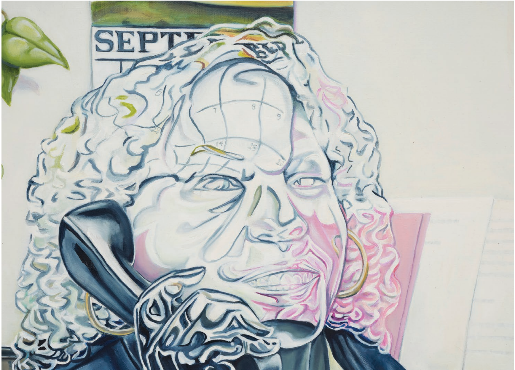
Troy Lamarr Chew II, Overly Dedicated (detail), 2024, Oil on canvas, 50 1/8 x 60 in, 127.3 x 152.4 cm, (TLC-P24-01), $ 20,000