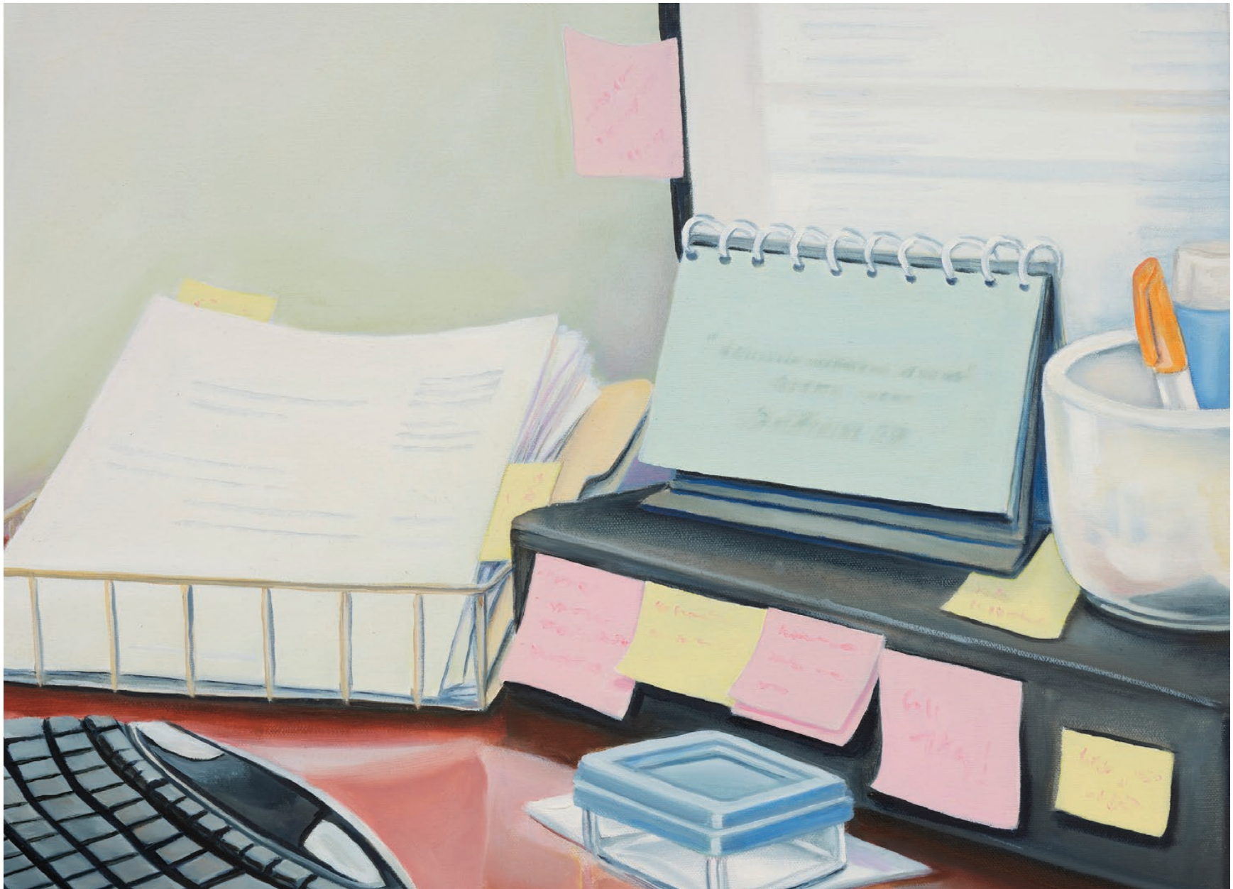
Troy Lamarr Chew II, Overly Dedicated (detail), 2024, Oil on canvas, 50 1/8 x 60 in, 127.3 x 152.4 cm, (TLC-P24-01), $ 20,000