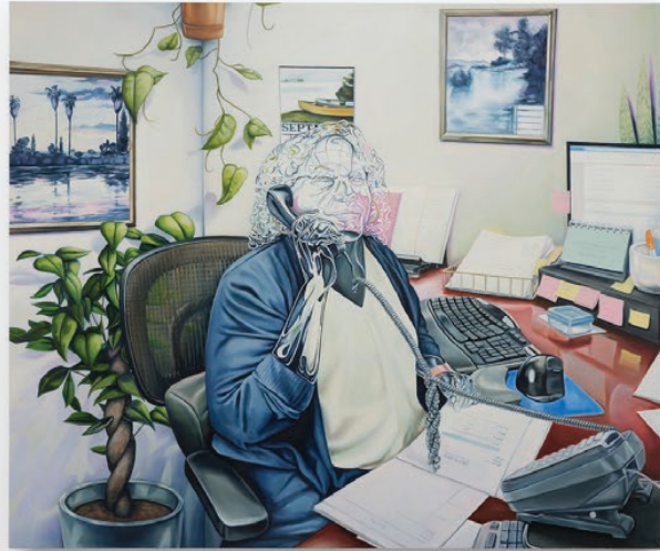
Troy Lamarr Chew II Overly Dedicated , 2024 Oil on canvas 50 1/8 x 60 in 127.3 x 152.4 cm (TLC-P24-01) $ 20,000