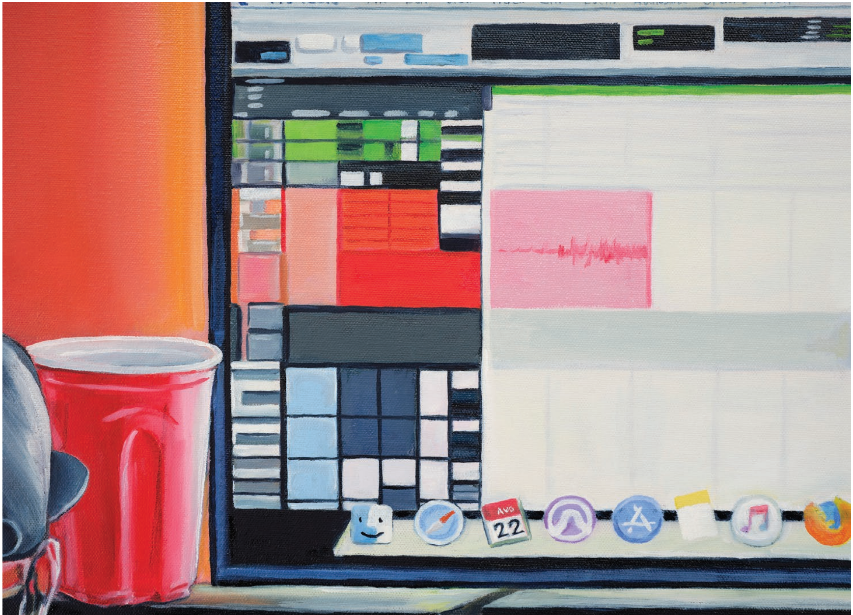
Troy Lamarr Chew II, Sweet Lullabies (detail), 2024, Oil on canvas, 36 x 67 5/8 in, 91.4 x 171.8 cm, (TLC-P24-08), $ 20,000