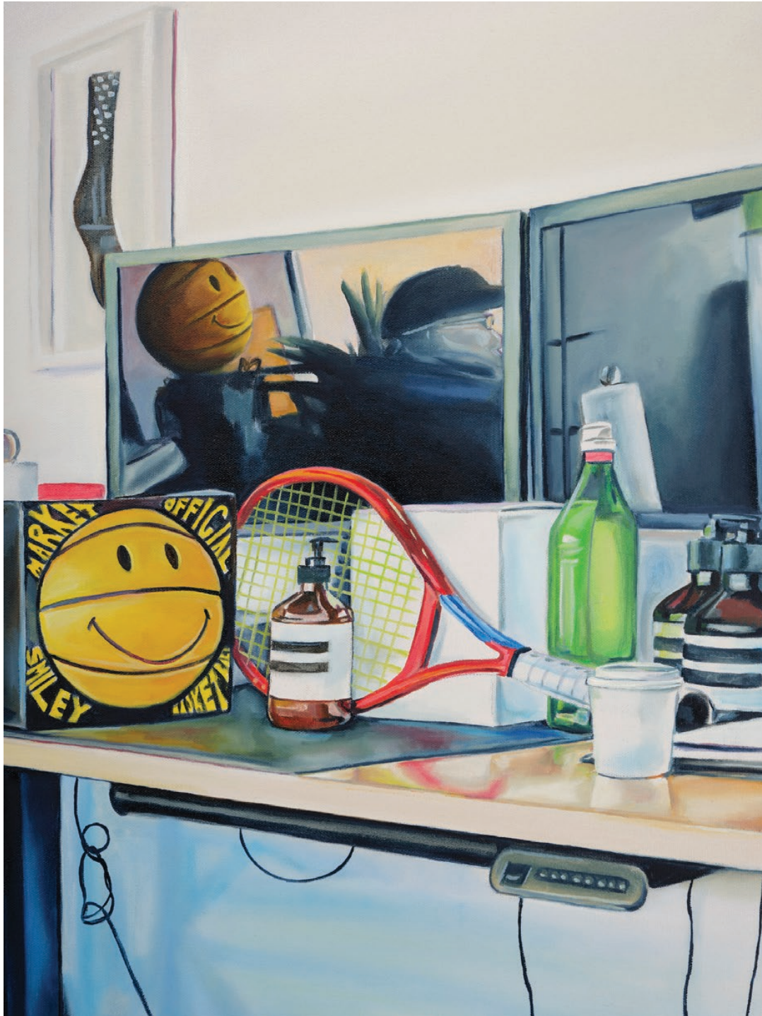
Troy Lamarr Chew II All Smiles (detail), 2024 Oil on canvas 60 x 48 in 152.4 x 121.9 cm (TLC-P24-05) $ 20,000