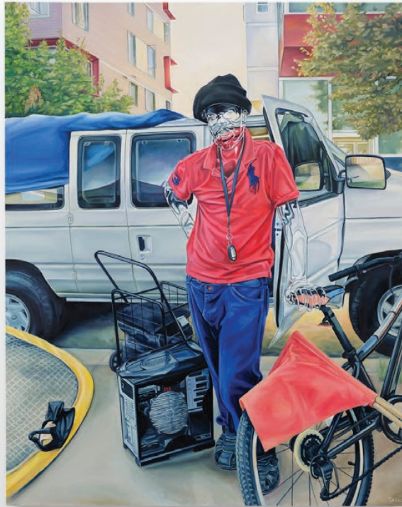
Troy Lamarr Chew II Hold the blocc down , 2024 Oil on canvas 60 x 48 in 152.4 x 121.9 cm (TLC-P24-02) $ 20,000