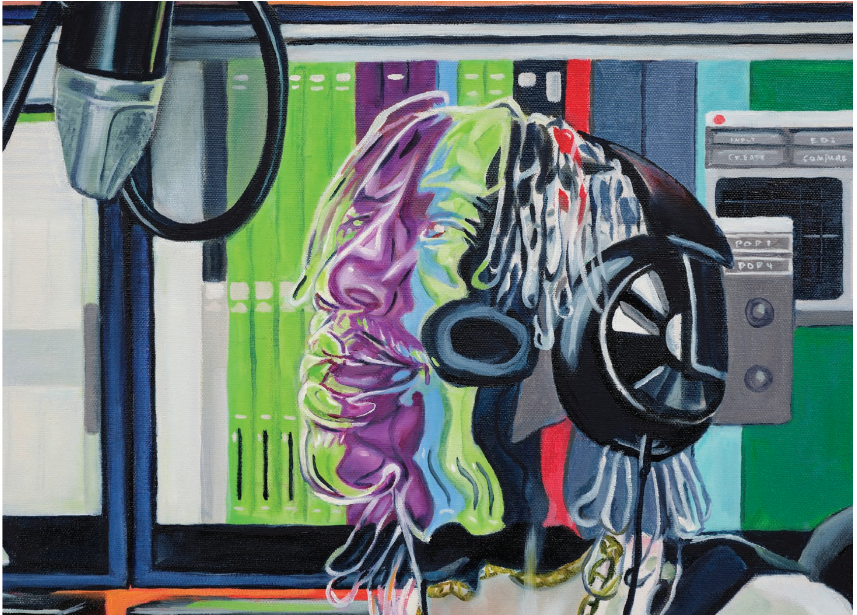
Troy Lamarr Chew II, Sweet Lullabies (detail), 2024, Oil on canvas, 36 x 67 5/8 in, 91.4 x 171.8 cm, (TLC-P24-08), $ 20,000