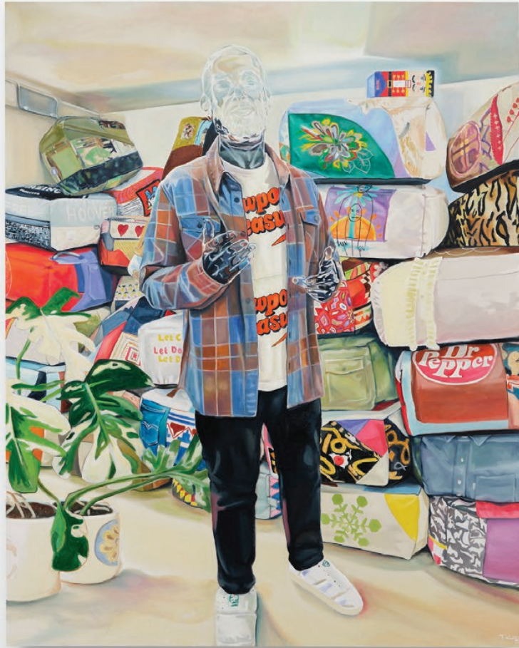
Troy Lamarr Chew II The Good Will Hunter , 2024 Oil on canvas 60 x 48 in 152.4 x 121.9 cm (TLC-P24-10) $ 20,000