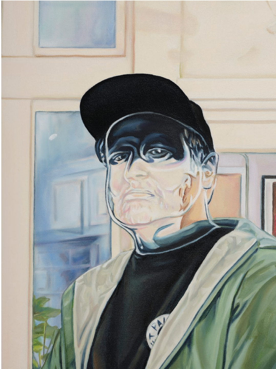
Troy Lamarr Chew II Invisible Inspiration (detail), 2024 Oil on canvas 54 x 48 in 137.2 x 121.9 cm (TLC-P24-03) $ 20,000