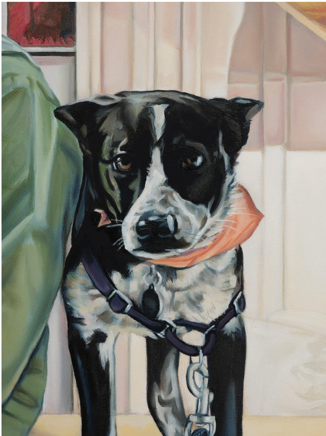
Troy Lamarr Chew II Invisible Inspiration (detail), 2024 Oil on canvas 54 x 48 in 137.2 x 121.9 cm (TLC-P24-03) $ 20,000