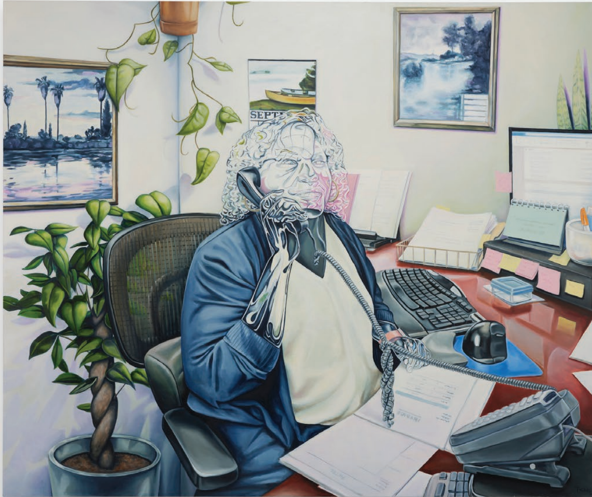
Troy Lamarr Chew II, Overly Dedicated , 2024, Oil on canvas, 50 1/8 x 60 in, 127.3 x 152.4 cm, (TLC-P24-01), $ 20,000