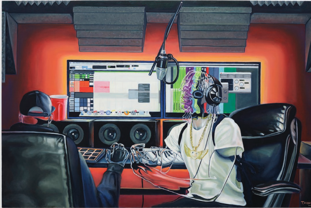
Troy Lamarr Chew II, Sweet Lullabies , 2024, Oil on canvas, 36 x 67 5/8 in, 91.4 x 171.8 cm, (TLC-P24-08), $ 20,000