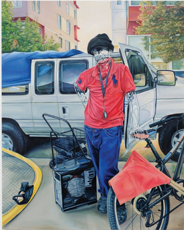
Troy Lamarr Chew II Hold the blocc down , 2024 Oil on canvas 60 x 48 in 152.4 x 121.9 cm (TLC-P24-02) $ 20,000