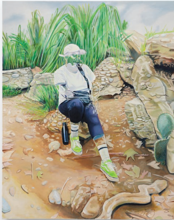
Troy Lamarr Chew II Office Break , 2024 Oil on canvas 60 x 48 in 152.4 x 121.9 cm (TLC-P24-09) $ 20,000