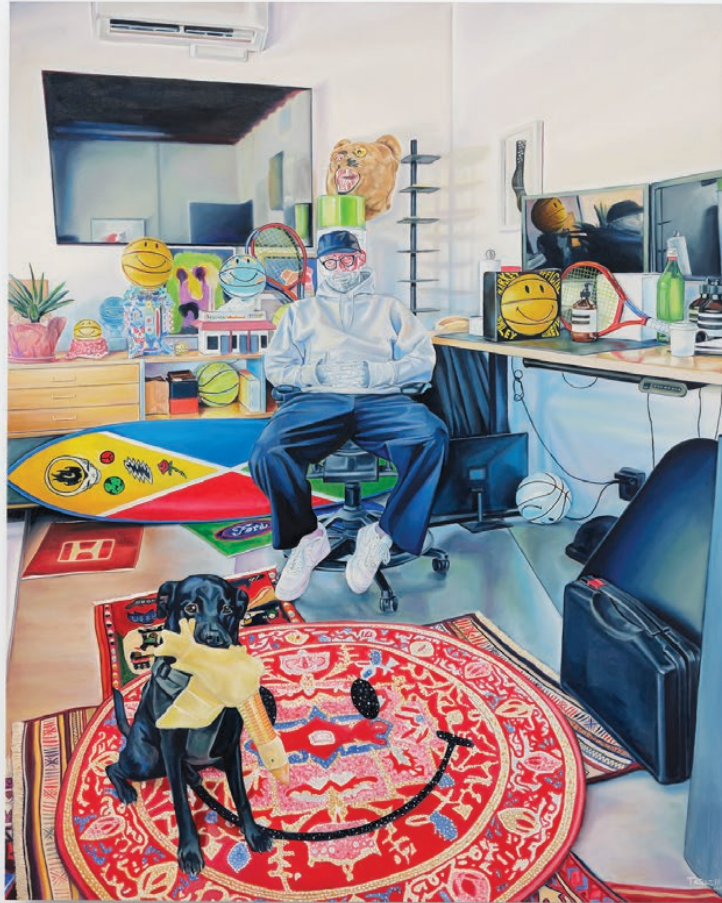
Troy Lamarr Chew II All Smiles , 2024 Oil on canvas 60 x 48 in 152.4 x 121.9 cm (TLC-P24-05) $ 20,000