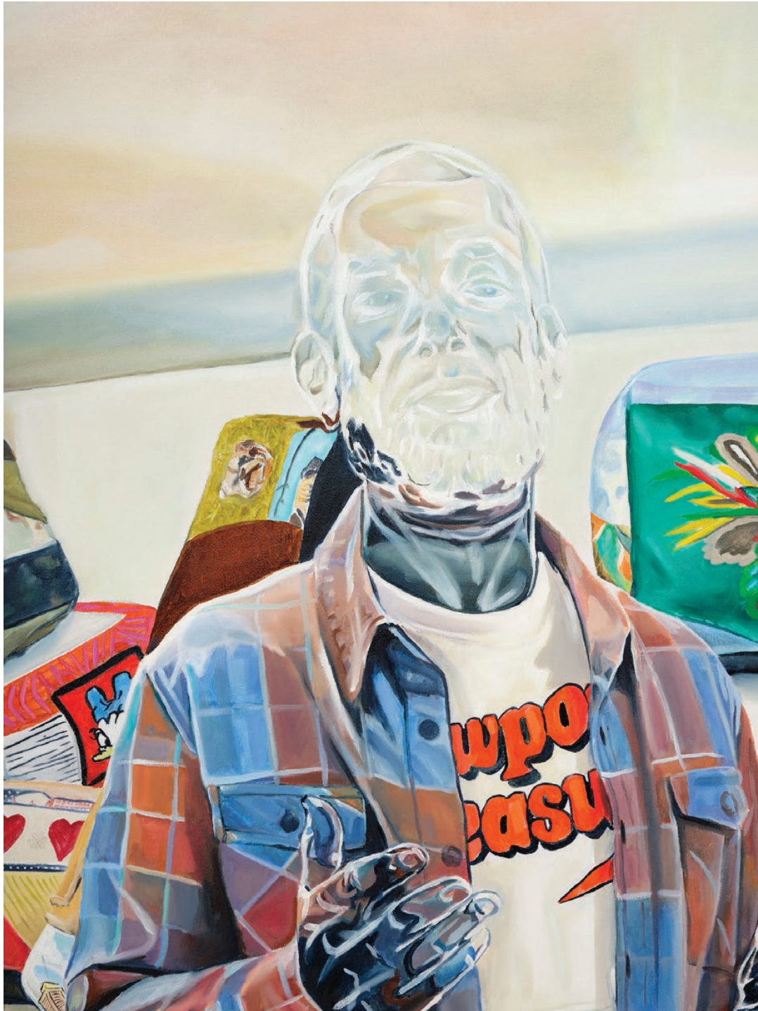
Troy Lamarr Chew II The Good Will Hunter (detail), 2024 Oil on canvas 60 x 48 in 152.4 x 121.9 cm (TLC-P24-10) $ 20,000