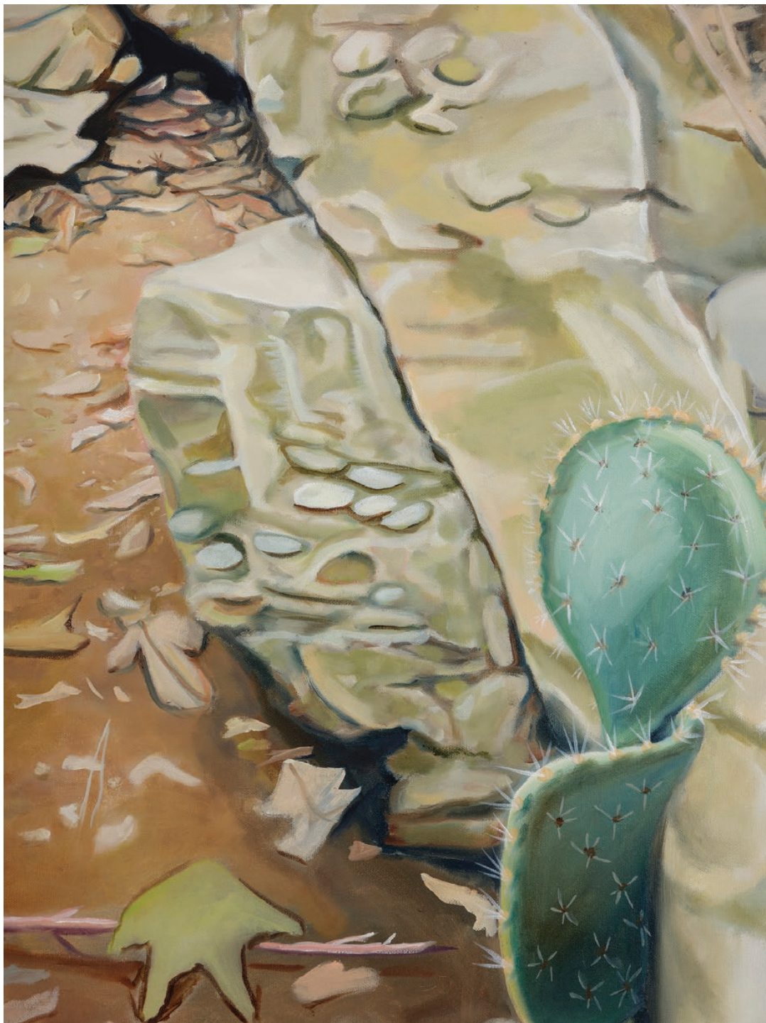
Troy Lamarr Chew II Office Break (detail), 2024 Oil on canvas 60 x 48 in 152.4 x 121.9 cm (TLC-P24-09) $ 20,000