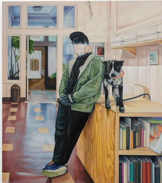
Troy Lamarr Chew II Invisible Inspiration , 2024 Oil on canvas 54 x 48 in 137.2 x 121.9 cm (TLC-P24-03) $ 20,000