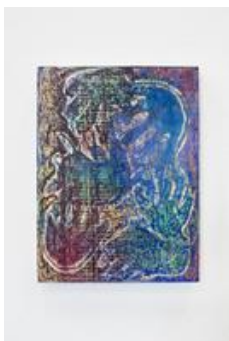
Natalie Häusler Rue Desert (No.5) , 2017 Acrylic and oil pastel on wood 19.5 x 14.5 x 1.5 cm (7 5/8 x 5 3/4 x 5/8 inches)