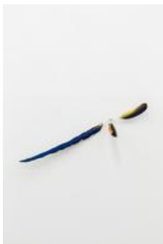
Natalie Häusler The Bird , 2017 Parrot feathers, clockwork approx.: ø 60 cm (ø 23 5/8 inches) Edition 1/3