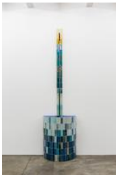
Natalie Häusler The Source / Die Quelle (for Josephine Saladyak) , 2017 Ceramic tiles, stained glass, mortar, fountain pump, plastic hose, copper pipe, wood 347 x 90 x 45 cm (136 5/8 x 35 3/8 x 17 3/4 inches)