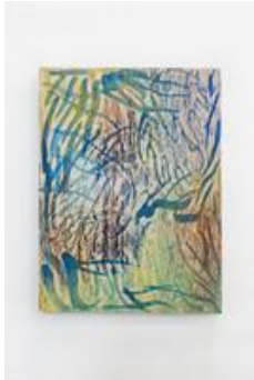
Natalie Häusler Rue Desert (No.9) , 2017 Acrylic and oil pastel on wood 19.5 x 14.5 x 1.5 cm (7 5/8 x 5 3/4 x 5/8 inches)