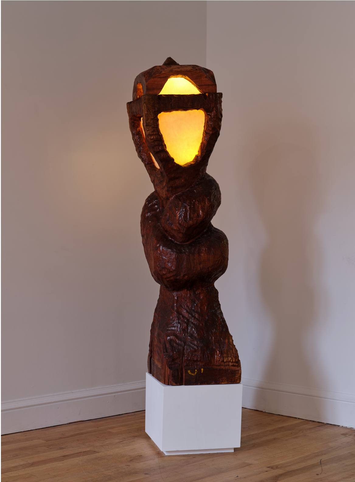
lamp (the embrace) mahogany, pine, electrical hardware, and acid-free canson paper 13 1/2 x 55 x 13 1/2 in. | 34.3 x 139.7 x 34.3 cm. | 2024