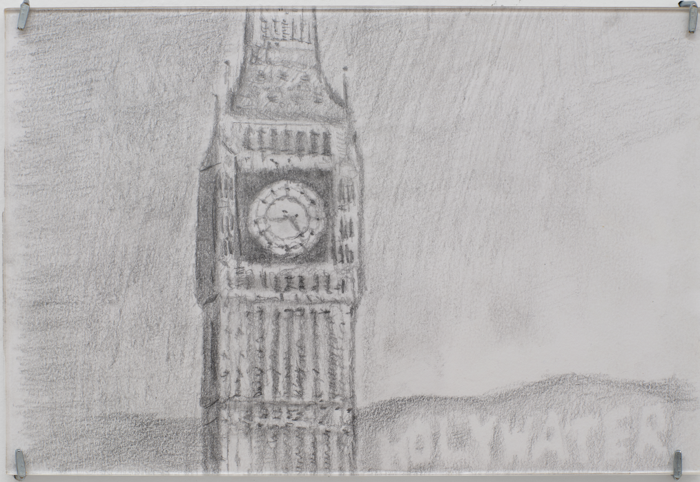
an alternate ending pencil on paper, acrylic, and hardware 6 x 9 x 0.75 in. | 15.2 x 22.9 x 1.9 cm. | 2024