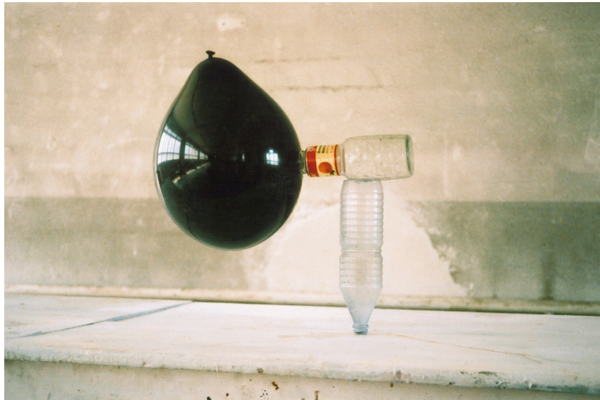
Peter Fischli and David Weiss, Artificial Intelligence , 1984/1986, C-print, 30 x 40 cm, edition 2/3