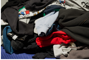
D'Ette Nogle Jeans and Sweatshirts , 2024 Jeans, sweatshirts 18 x 52 x 29 in (45.7 x 132.1 x 73.7 cm)