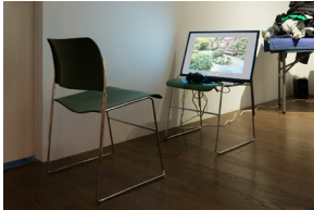
D'Ette Nogle St. Luke in the Fields, New York , 2024 Two local parish chairs, monitor, media player, headphones, digital video (color, duration 3 min 11 sec) 31 x 58 x 26 in (78.7 x 147.3 x 66 cm) The artist and Derosia would like to thank St. Luke in the Fields for the loan of two parish chairs.