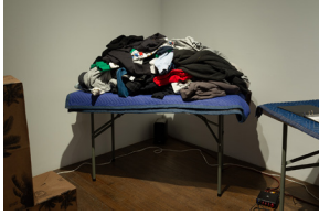
D'Ette Nogle Folding Devotion Table , 2024 Folding table, moving blanket 30 x 50 x 27 in (76.2 x 127 x 68.6 cm)