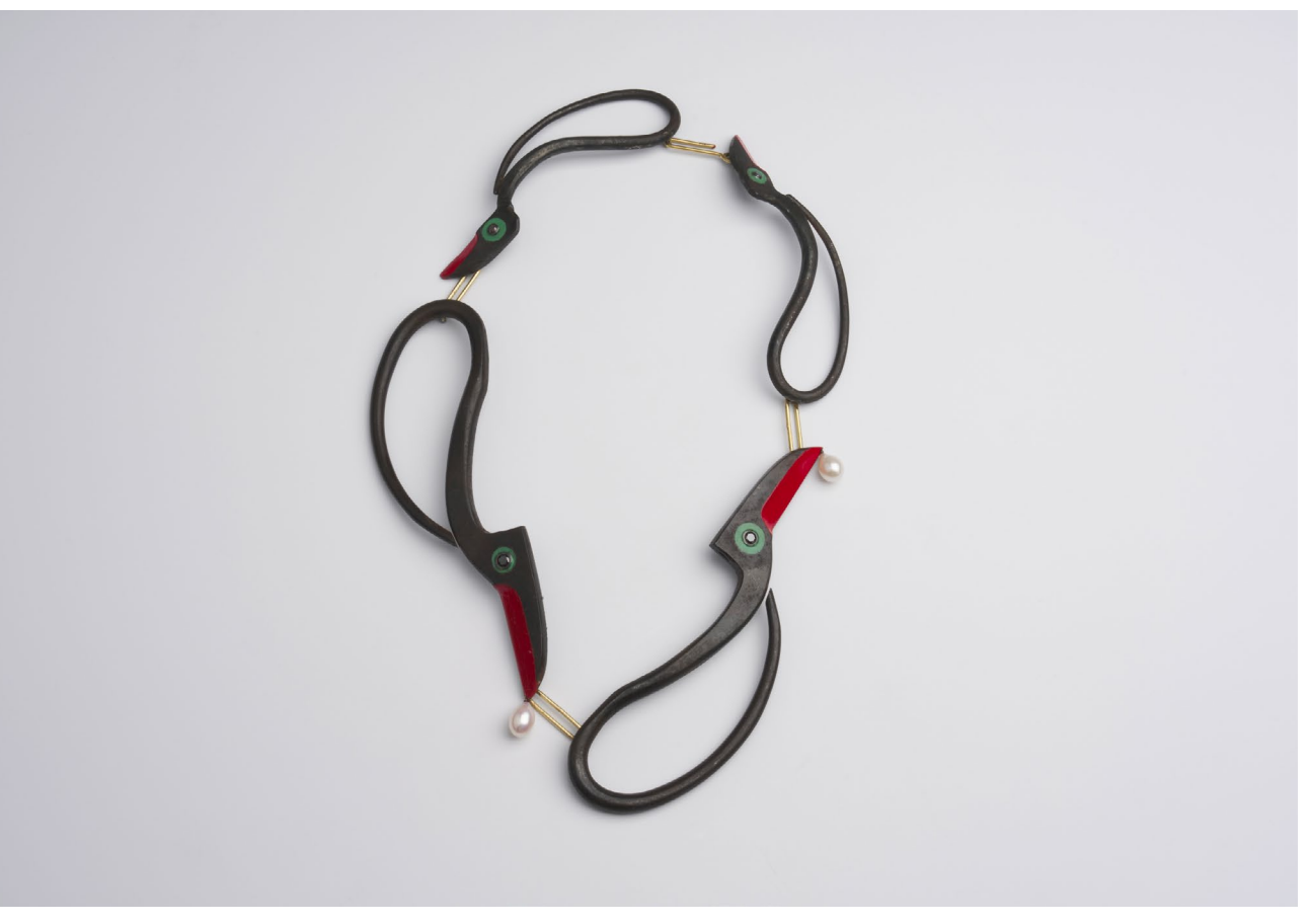
Bernhard Schobinger, Japanese Scissor Birds, 2024.

Bernhard Schobinger's work can be found in a number of important public collections, including Victoria & Albert Museum, London; Museum of Fine Arts, Boston; Museum of Fine Arts, Houston; LACM, Los Angeles; Philadelphia Museum of Art, Philadelphie; Rotasa Collection Trust, California; National Museum of Australia, Canberra; National Gallery of Victoria, Melbourne; Stedelijk Museum, Amsterdam; Museum Boijmans Van Beuningen, Rotterdam; Pinakothek der Moderne, Die Neue Sammlung, Münich; Musée des Arts Décoratifs, Palais du Louvre, Paris; mudac, Lausanne; Museum Bellerive/Museum für Gestaltung, Zurich; Kunsthaus Zug; Schweizerisches National Museum, Zurich and the Museum für angewandte Künste, Cologne.