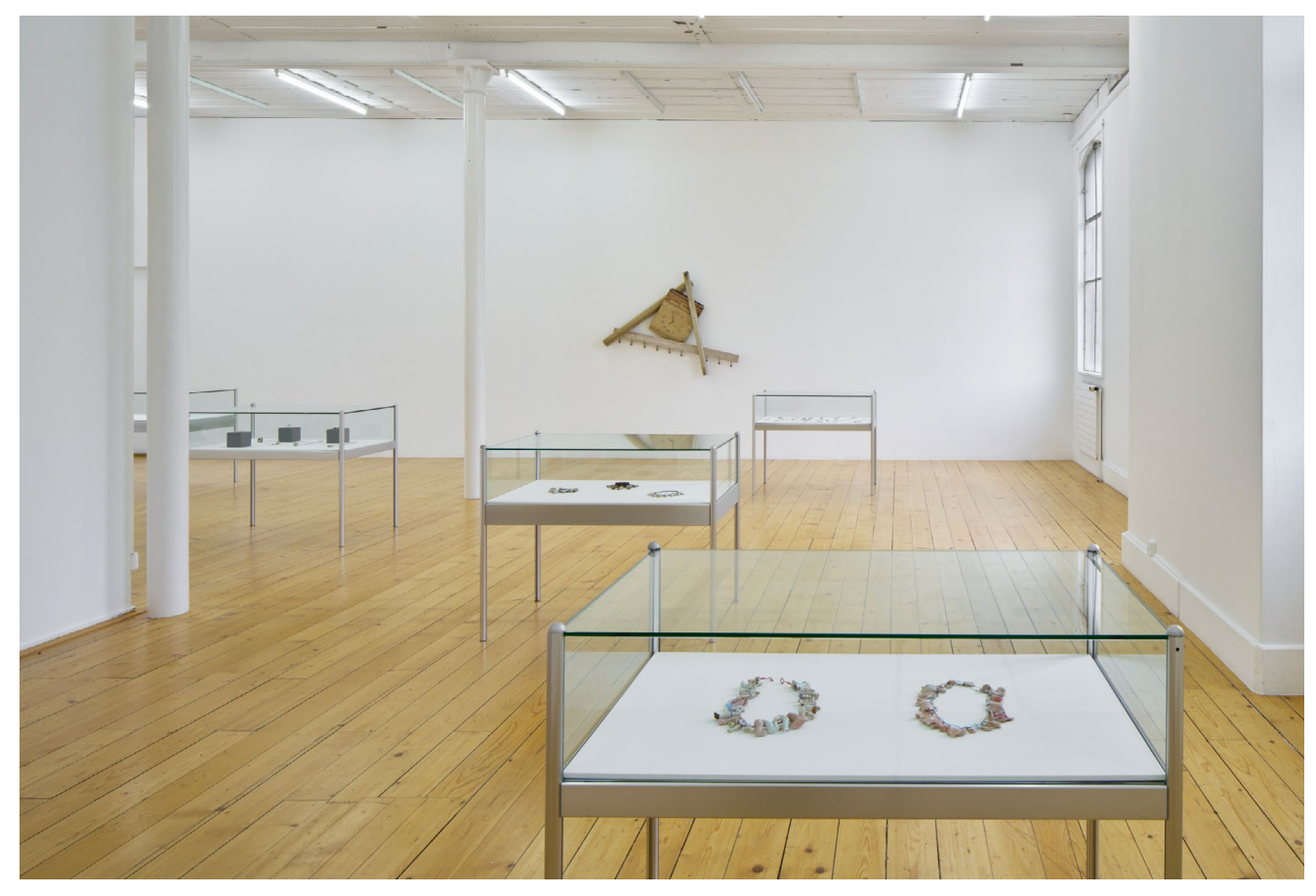
Exhibition view, Bernhard Schobinger, Berlin, Kunsthalle Friart Fribourg, 2024.

A jewel condenses space into a single point. The smallest of objets d'art is also the most powerful. Technique is expression, accident intention. In opposition to any reflection on formal approach, it's the practice that counts. A nail pierces a carved stone (Nagel-Ring, 2011).