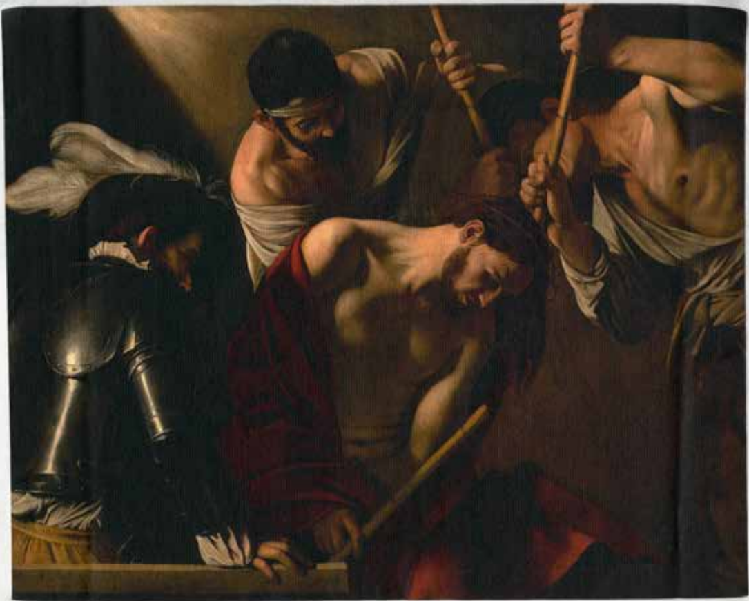
The Crowning with Thorns, 2024 / C-print in artists frame / 30.5 x 40.6 cm