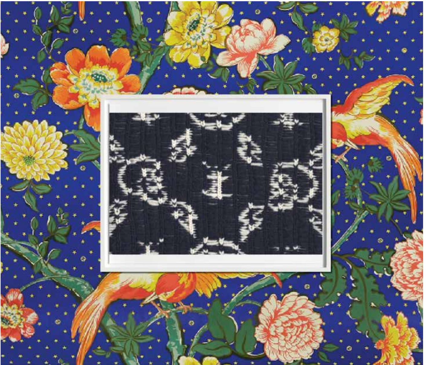
The Inside, 2024 / C-print in artists frame / 40.6 x 30.5 cm