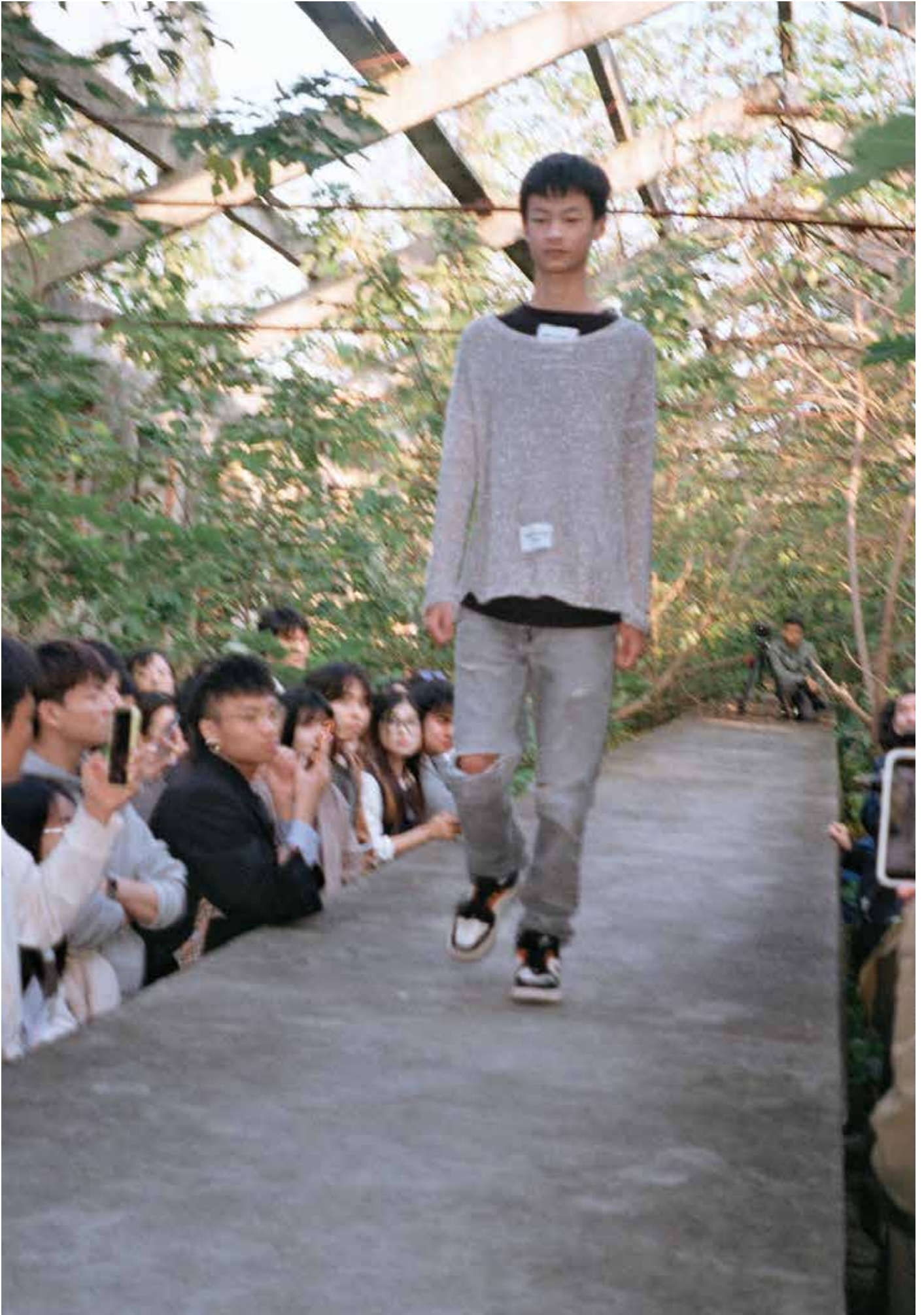
Performance Shanghai Portrait , 2024