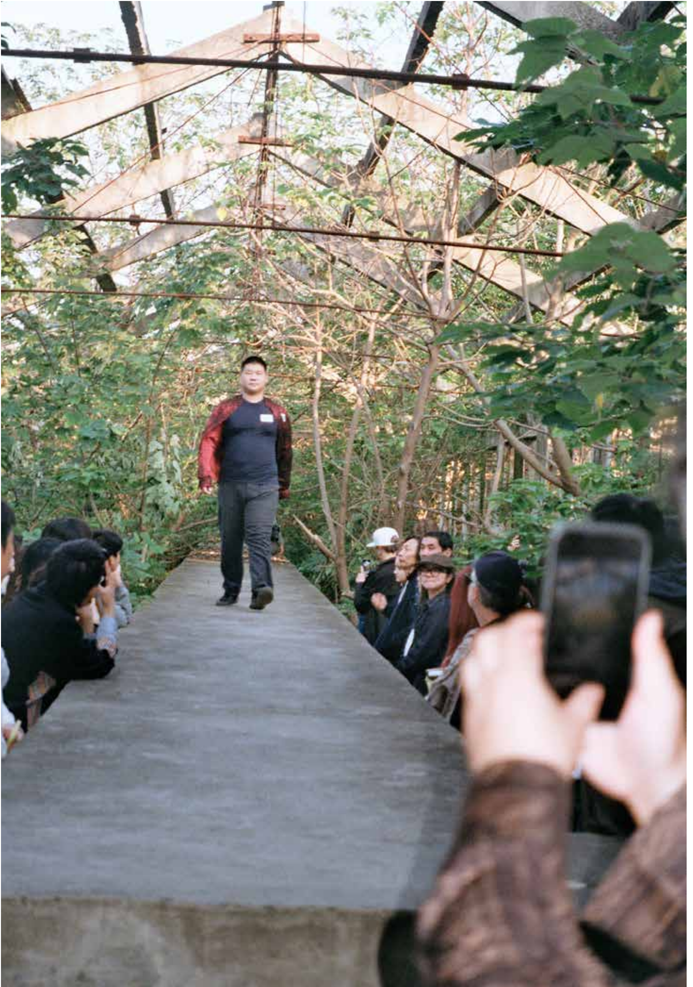
Performance Shanghai Portrait , 2024