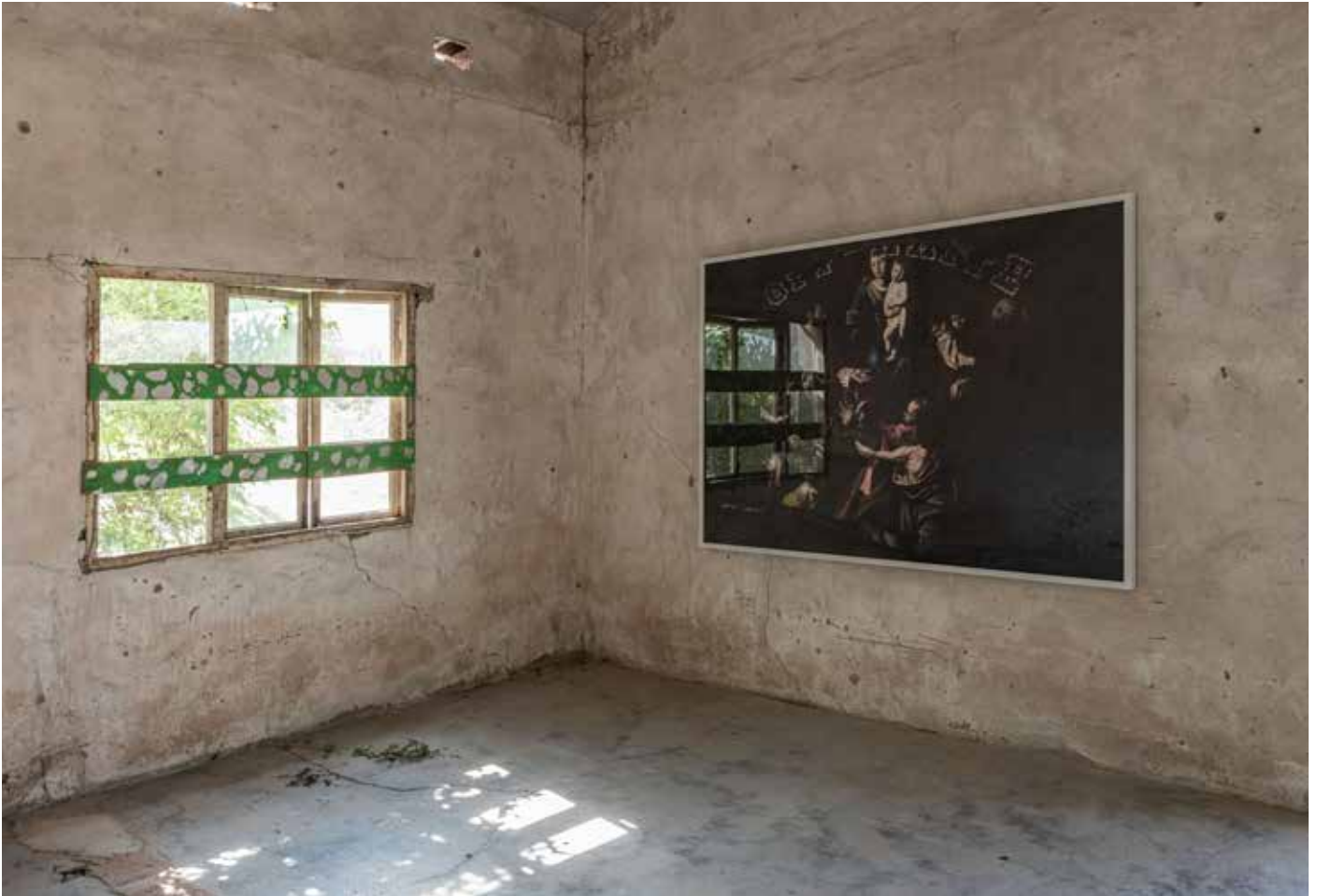
Exhibition view End of an Era