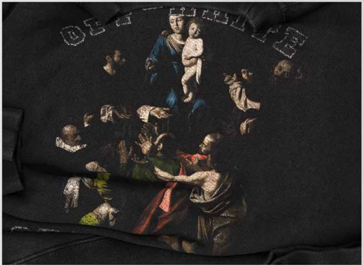
The Madonna of the Rosary, 2024 / C-print in artists frame / 140 x 200 cm