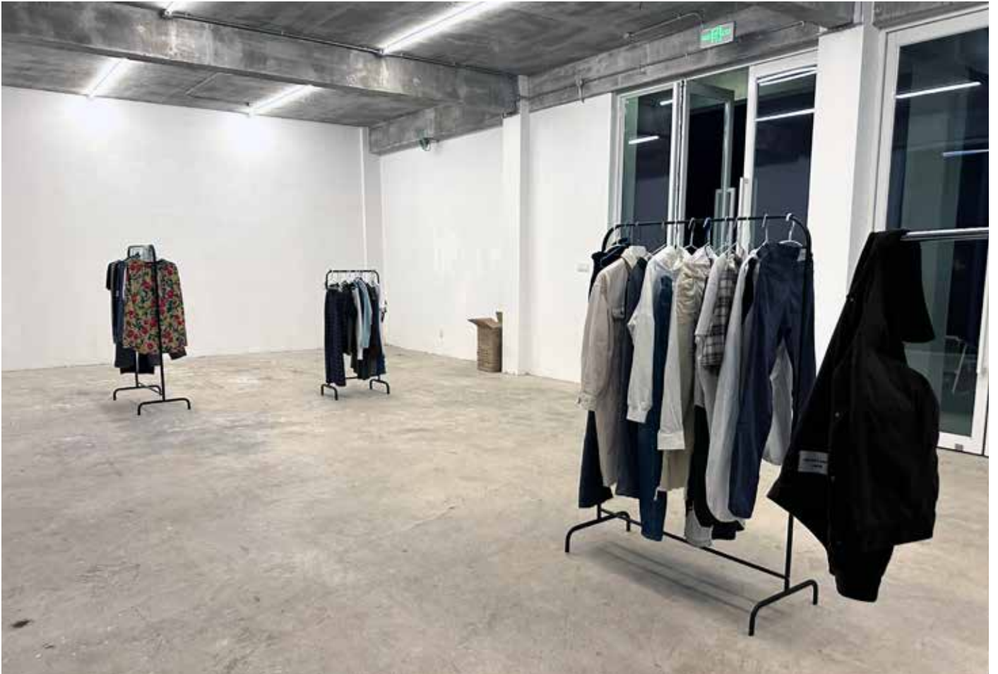
Installation view Shanghai Portrait, 2024