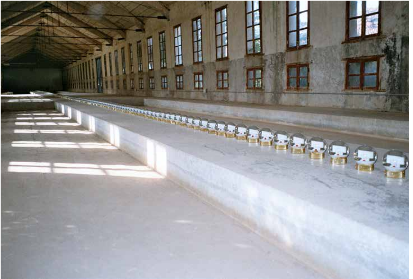
Exhibition view End of an Era