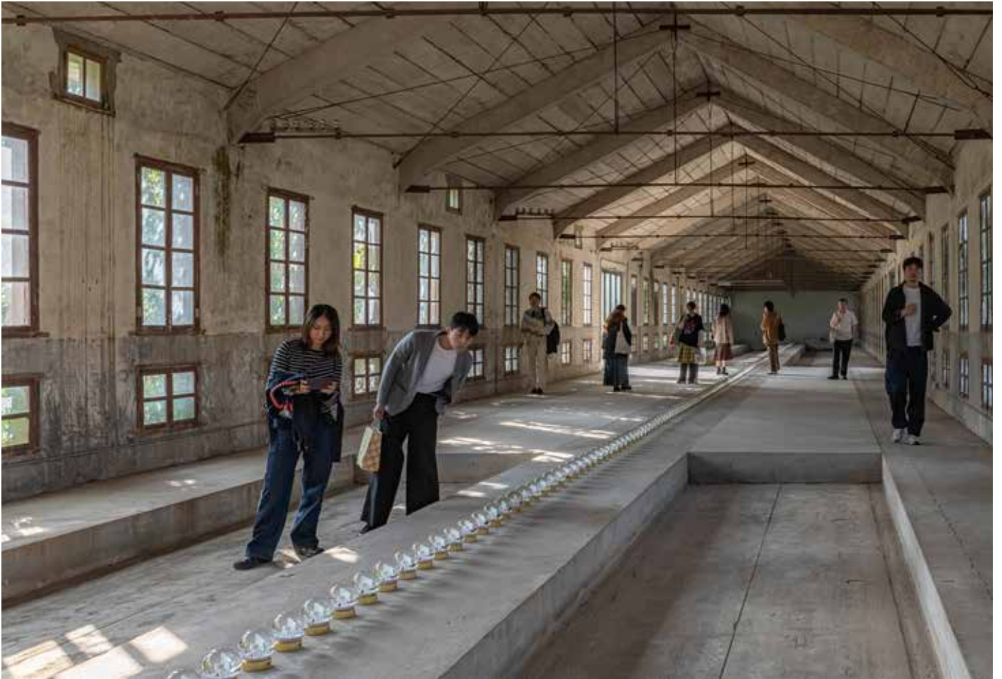
Exhibition view End of an Era