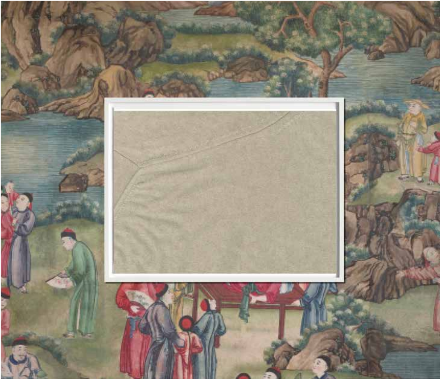
Beidge Cashmere Turtleneck, 2024 / C-print in artists frame / 40.6 x 30.5 cm