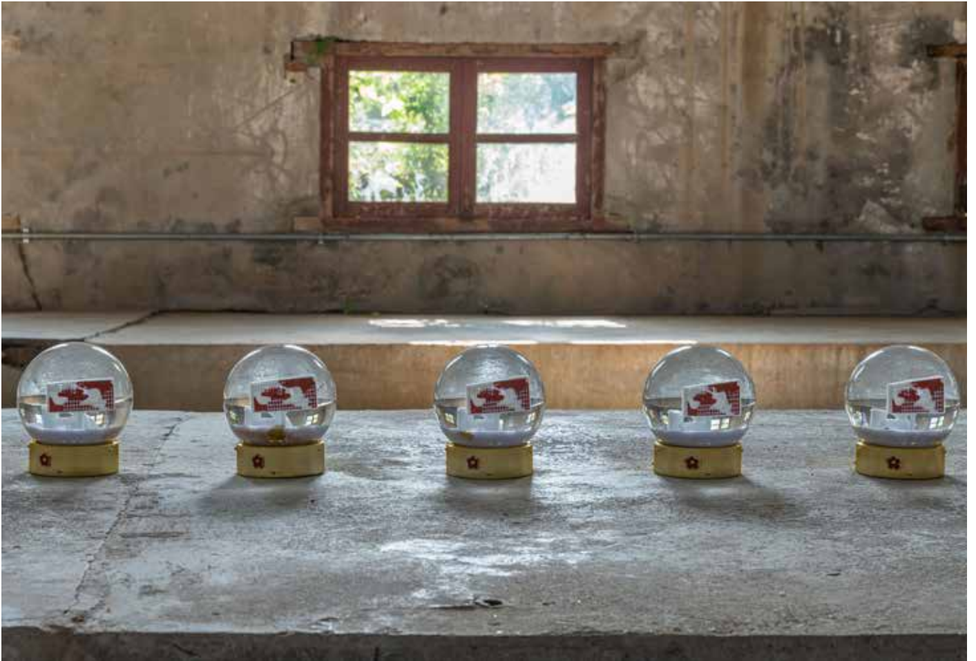
My Dreams and Nightmares (365 Days), 2024 / 365 snow globes / Dim. variable (here 700 x 15 cm)