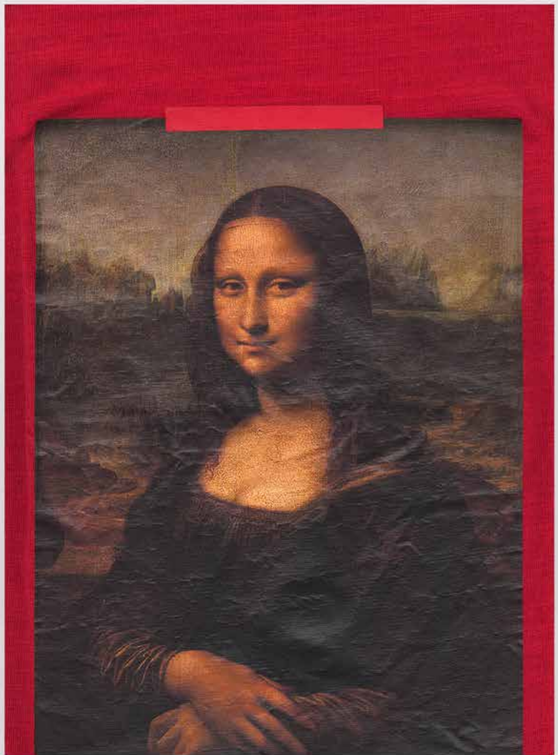
Mona Lisa (Red), 2024 / C-print in artists frame / 200 x 140 cm