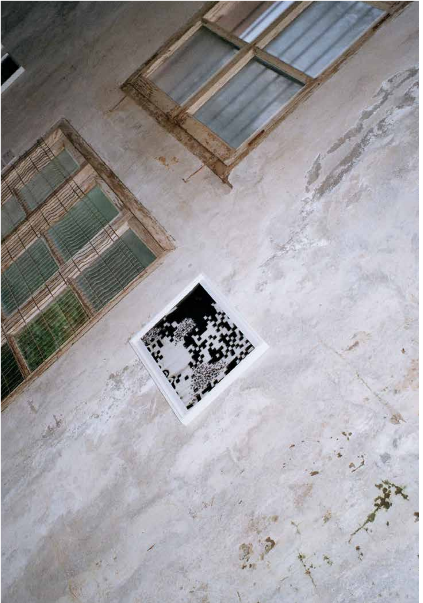
Exhibition view End of an Era