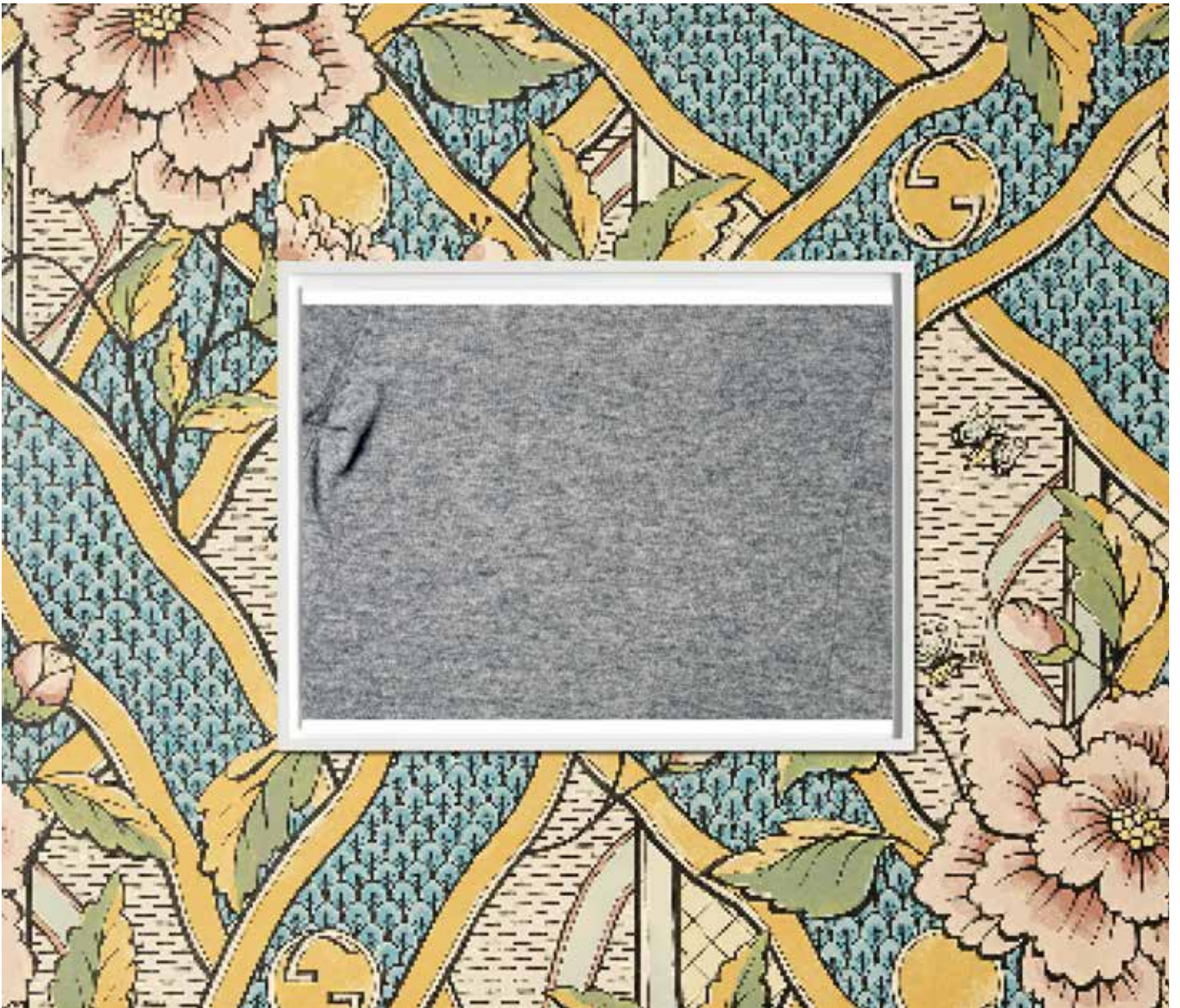
Gray Wool Sweater with Holes, 2011 / C-print in artists frame / 30.5 x 40.6 cm