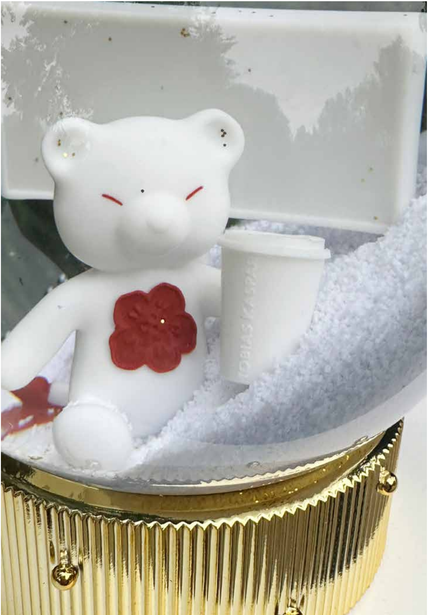
My Dreams and Nightmares (1 Day), 2024 / One snow globes / 15 x 15 x 12 cm)