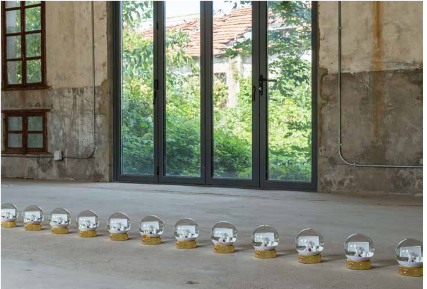
Exhibition view End of an Era