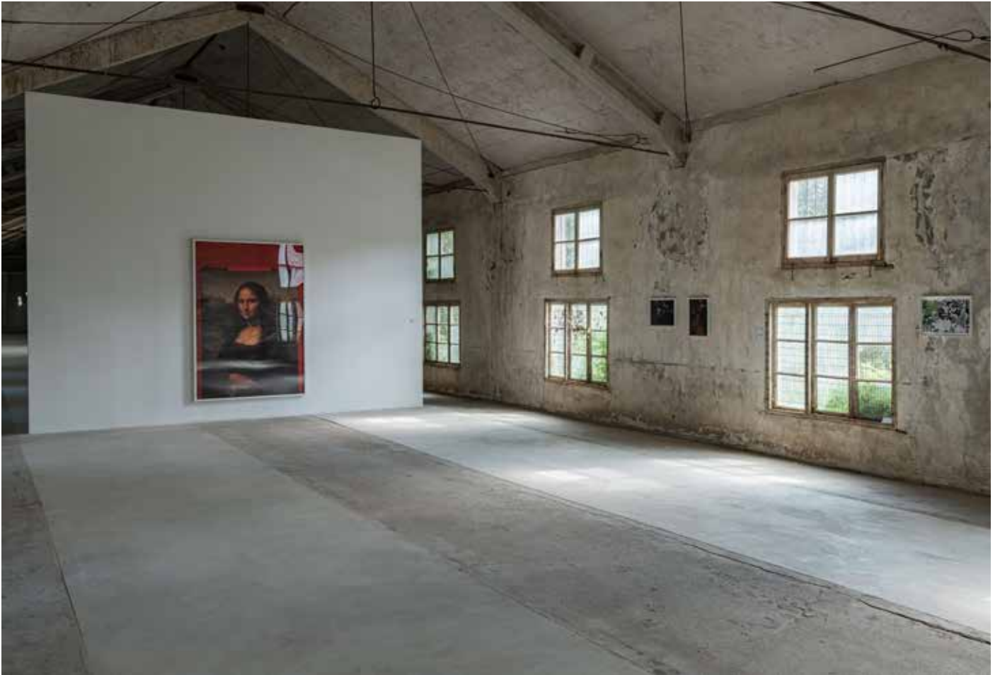
Exhibition view End of an Era