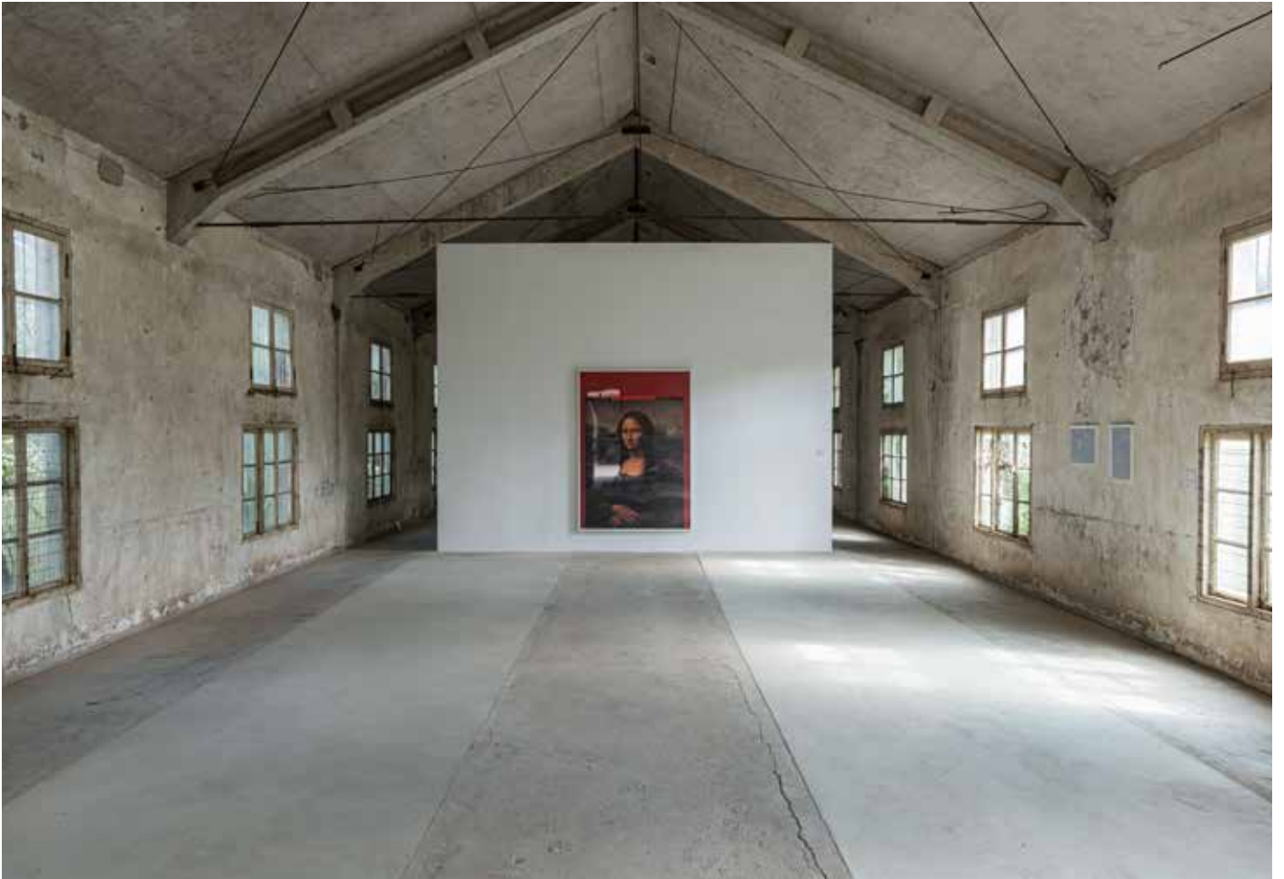
Exhibition view End of an Era