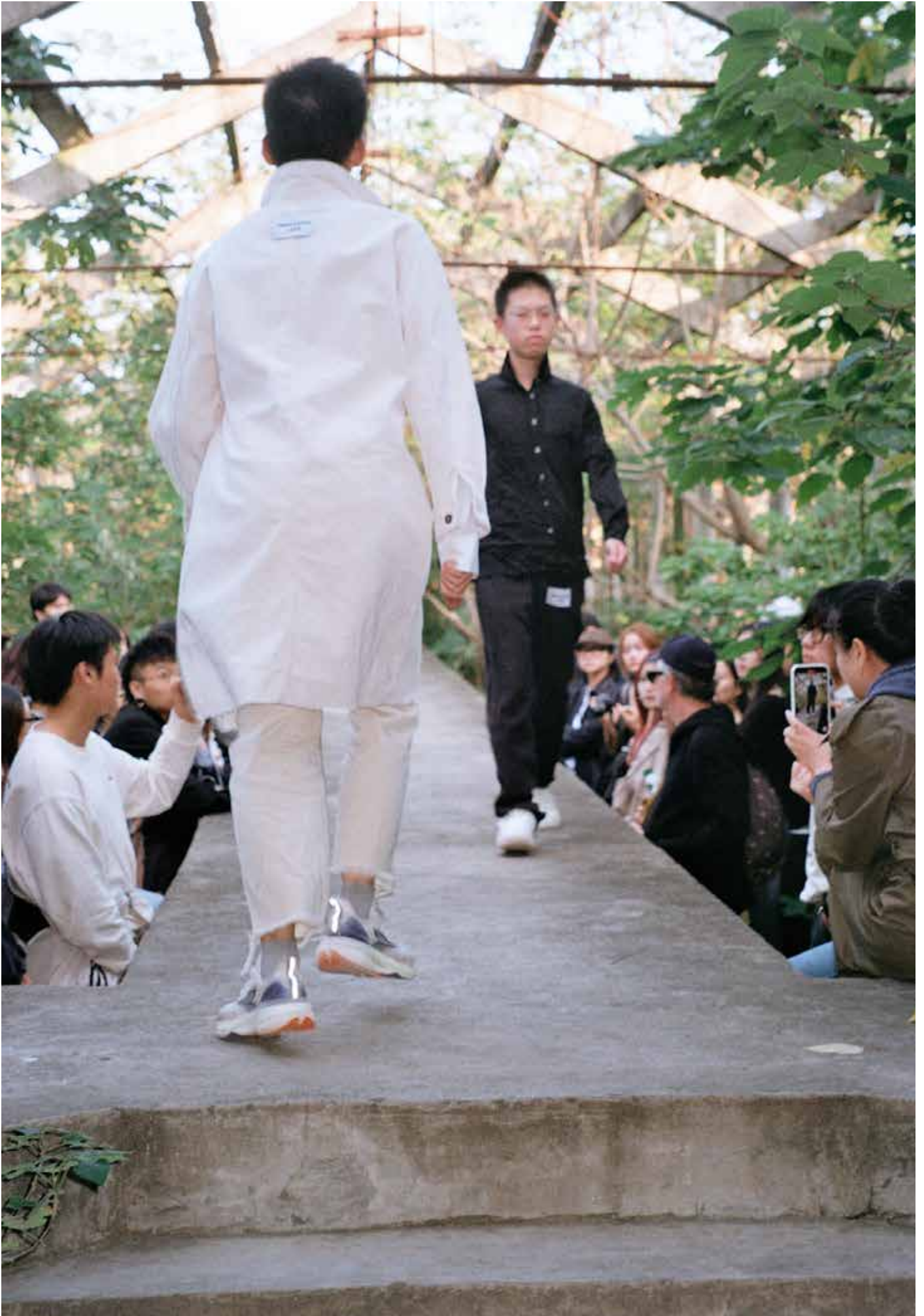
Performance Shanghai Portrait , 2024