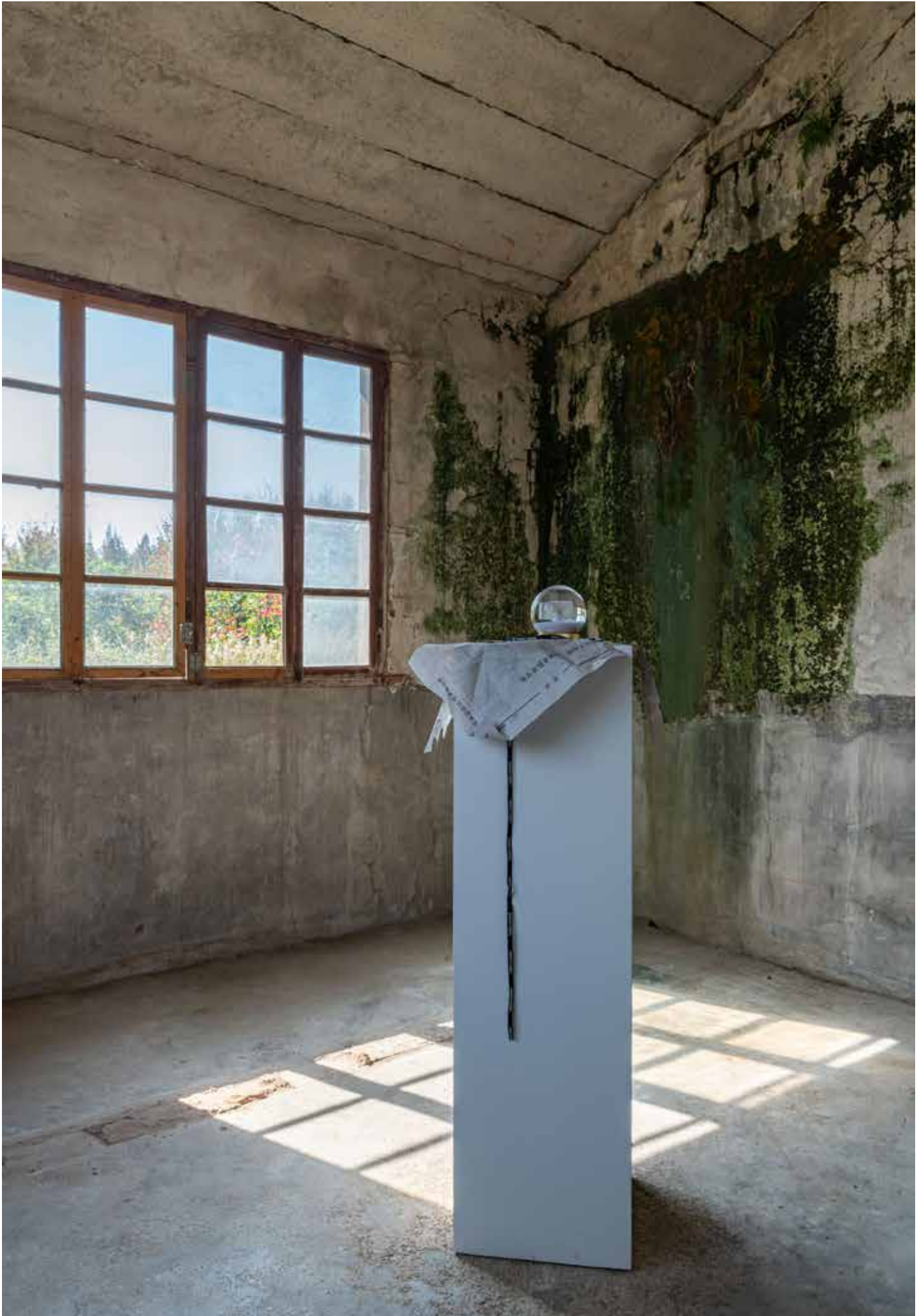
My Dreams and Nightmares (1 Days), 2024 / 1 snow globe / 15 x 15 x 12 cm)