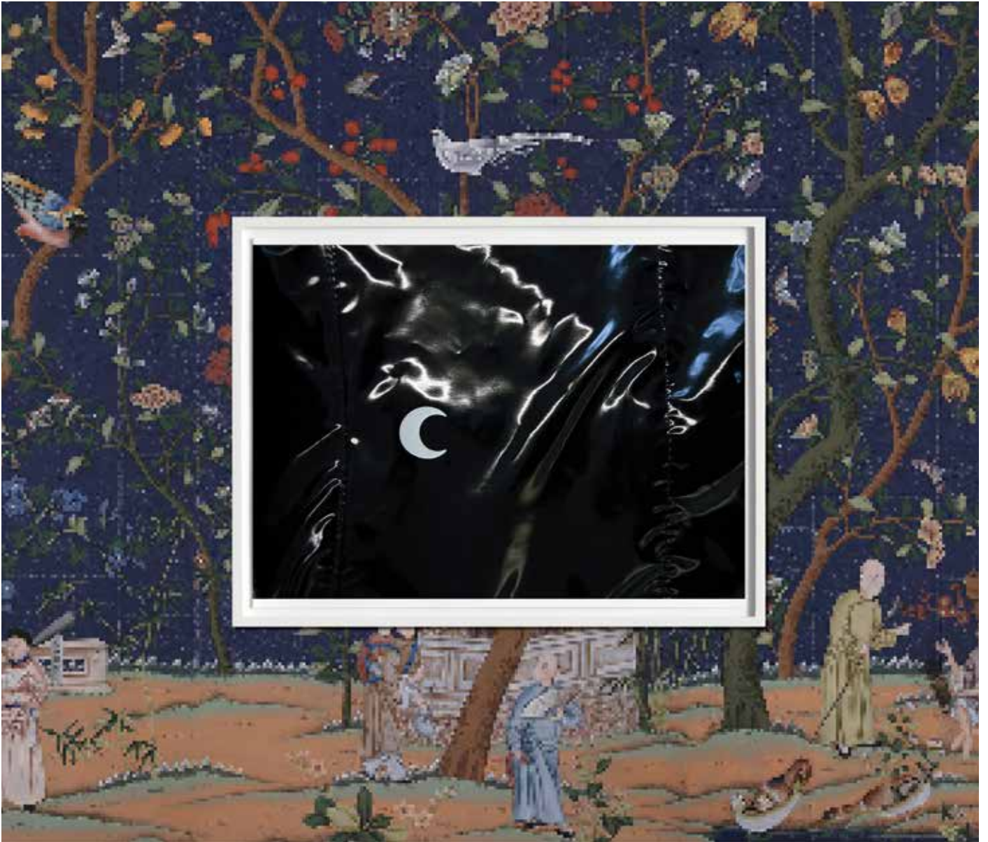
Half Moon Raincoat, 2024 / C-print in artists frame / 30.5 x 40.6 cm