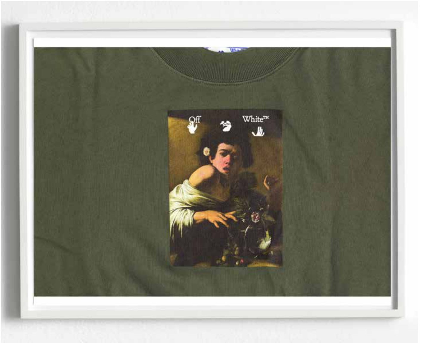
Boy Bitten by a Lizard, 2024 / C-print in artists frame / 30.5 x 40.6 cm