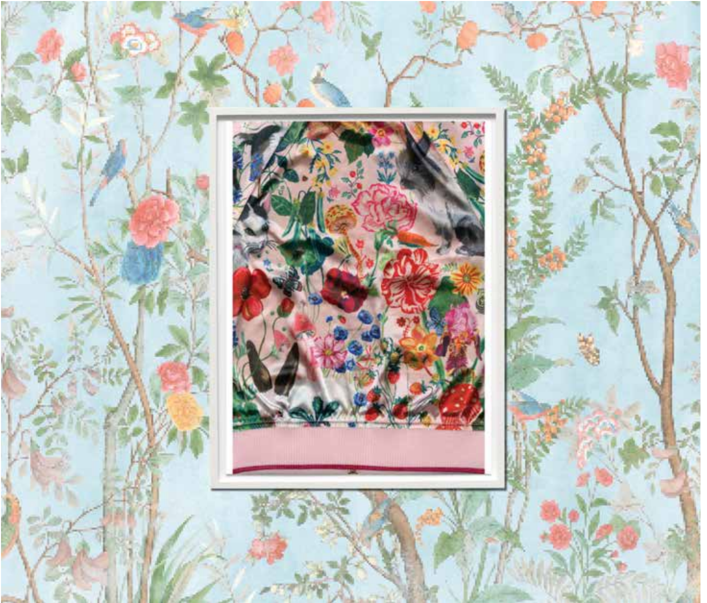
Kids Flower Bomber, 2024 / C-print in artists frame / 40.6 x 30.5 cm