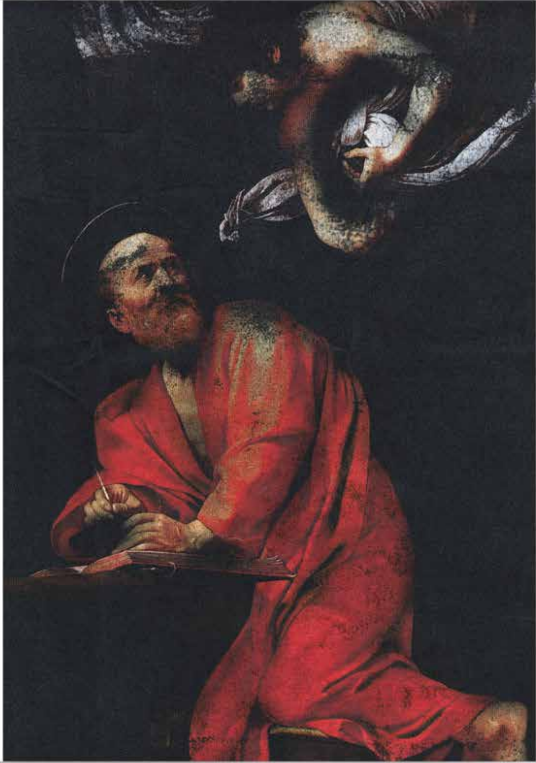
The Inspiration of Saint Matthew, 2024 / C-print in artists frame / 40.6 x 30.5 cm