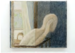
“Listen to Distant Sounds”