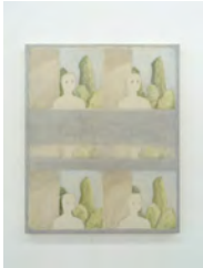
“blink / vision”

oil, watercolor, pencil, linen and canvas 38 x 45.5cm