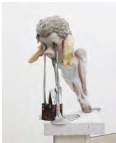
“Burning down the house” 2024 epoxy, fibre glass, pigments, 3d prints, epoxy clay, aluminium, rawhide, acrylic, credit cards, walnut, lacquer 52 h x 38 d x 25 w cm