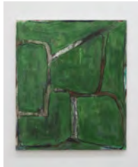
“Route 41924” 2024, oil, on canvas 53 x 45.5 cm