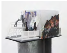
“Service Interruption” 2024 Aluminum, Nylon, Petg, Resin 24 x 43.5 x h 24 cm