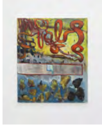
“Rosemary 41824” 2024, oil, on canvas 72.7 x 60.6 cm