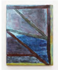
“Seaside 42024” 2024, oil, on canvas 41 x 31.8 cm