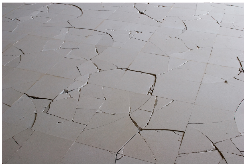
Three images above are all taken in 2007 at the Otani Memorial Art Museum, Nishinomiya city