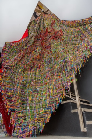
Victor Ehikhamenor The Enigma of Things Remembered, 2024 rosaries, coral beads and thread on lace textile 370.8 x 340.4 cm 146 x 134 in (VE/SCULP/022)