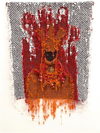
Victor Ehikhamenor Umogun I, 2024 rosary, coral beads, and thread with bronze statuette on lace textile 170.2 x 116.8 x 7.1 cm 67 x 46 x 2 3/4 in (VE/SCULP/023)