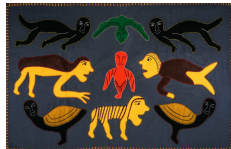
Irene Avaalaqiaq Tiktaalaaq COMPOSITION (TRANSFORMATIONS) , n.d. Duffel, felt, embroidery floss 36 3/4 × 58 1/4 inches