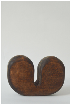
Kai Jenrette and (37/50), 2023 Basswood 5 1/2 × 8 × 1 3/4 inches