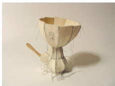
Cyrilla Mozenter More saints seen 16 , 2004 Pencil on industrial wool felt hand stitched with silk thread 7 × 7 1/2 × 4 inches