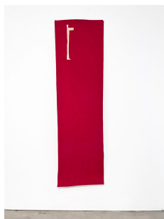
Cyrilla Mozenter Relic , 2024 Industrial wool felt hand stitched with silk thread 68 1/2 × 20 inches