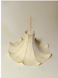
Cyrilla Mozenter More saints seen 18, 2004 Pencil on industrial wool felt hand stitched with silk thread, wooden craft stick and toothpick, button, pearls, and bugle beads 13 1/2 × 16 × 16 inches