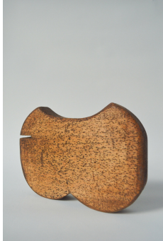
Kai Jenrette and (29/50), 2023 Basswood 5 1/4 × 7 1/2 × 1 inches