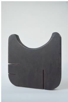
Kai Jenrette and (06/50) , 2024 Basswood 8 × 8 × 1 inches