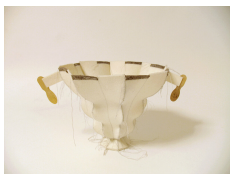
Cyrilla Mozenter More saints seen 29, 2005 Pencil on industrial wool felt hand stitched with silk thread and wooden ice cream spoons 8 1/2 × 15 1/2 × 10 3/4 inches