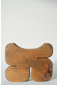
Kai Jenrette and (14/50) , 2022 Basswood 5 3/4 × 7 × 1 inches