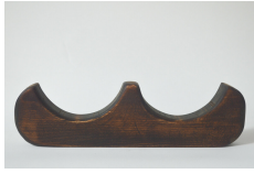
Kai Jenrette and (32/50), 2023 Basswood 3 1/2 × 12 3/4 × 1 1/4 inches