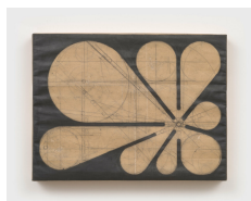
Kai Jenrette No title , 2024 Graphite on waxed newsprint over panel 9 × 12 × 1 1/2 inches