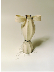
Cyrilla Mozenter More saints seen 10 , 2004 Pencil on industrial wool felt hand stitched with silk thread 11 × 7 × 4 inches