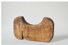
Kai Jenrette and (04/50) , 2022 Basswood 5 1/4 × 9 × 1 1/4 inches