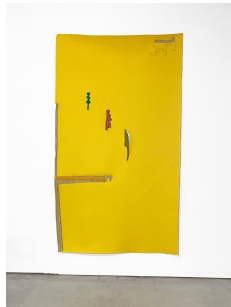
Cyrilla Mozenter Note Values , 2024 Industrial wool felt hand stitched with silk thread 72 1/2 × 42 1/2 inches