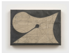
Kai Jenrette No title , 2024 Graphite on waxed newsprint over panel 5 × 7 × 1 inches