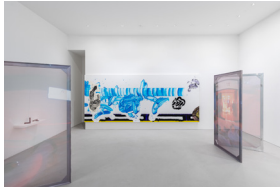
Installation view occasional urges , 2024

Please note the following photo credits and courtesies: