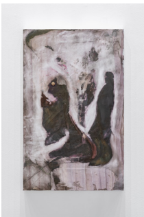
Sophronia Cook tugging from oblivion for a moment , 2024