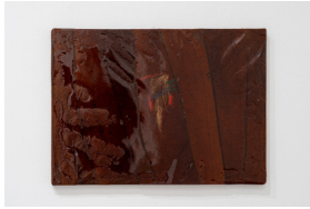
Rindon Johnson Attack in transition (moi!) no paste wasted (run) your center won't hold (je). Condemnation. Plod. Cope. RC Car. The rain drips from the trees. Did we discuss already the toilet? , 2023