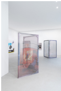
Installation view occasional urges , 2024

Courtesy of max goelitz and Häusler Contemporary Zurich Copyright of the artists Photo: Dirk Tacke