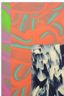
David Reed #554, 2006 Detail

Courtesy of Häusler Contemporary Zurich Copyright of the artist Photo: Dirk Tacke