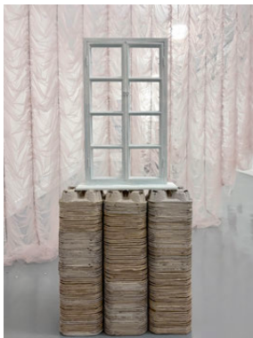
There She Goes, 2024 reduced scale French windows, wood, adhesive vinyl lettering, hinges, miniature doorknobs, green latex paint matched to Rose Sélavy's 1920 sculpture Fresh Widow , gallery white latex paint, McDonald's drink carriers 60" x 27" x 10" MM092