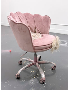
silk chiffon silk hotel, 2024

velvet upholstered desk chair on casters, porcelain, makeup brush bristles, antique ostrich plume (gift from Emmy Bright), chicken feathers, dyed goose coquille, duck down, embroidery flosses, shards of mother of pearl shank buttons, Serge Lutens paper smelling strips, ABS plastic artificial nails with crystal ornaments, stolen nail varnish, oil paint, perfumed powder, incense ash, PVA glue, ground white hominy