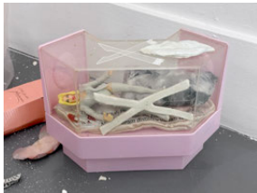
Homage to the Romantic Hellfire Club Grotto, 2024 plastic action figure, glazed porcelain, miniature white fishnet stockings, Dresden embossed foil paper witch, antique velveteen red heart, crushed Ambien, silk, embroidery floss, digitally printed satin, polyfil stuffing, plastic beauty counter doll furniture 7" x 9.5" x 4" MM095