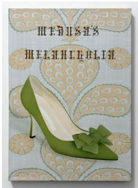
Alan Reid Medusa's Melancholia , 2021 acrylic on linen 20" x 14" AR011