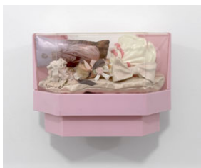
Garage to the Romantic McDonald's Girl Toy Grotto , 2024 plastic figurine, glazed porcelain, antique miniature bottle of Caron French Cancan perfume from J Kent, satin appliqués, plastic pearl, silk ribbons, silk, embroidery floss, digitally printed satin, polyfil stuffing, plastic beauty counter doll furniture 6.5" x 9" x 4" MM117