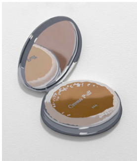
Lori Larusso Creme Puff USA , 2021 acrylic on panel 9" x 8" LL001