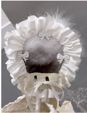
Mrs. Estelle Lestrangle, 2024 dyed marabou feathers, duck down, perfumed powder, porcelain, vintage silk ribbon (gift from Laurie Stern), silk ribbon, rayon satin ribbon, Bvlgari ribbon, digitally printed satin, vintage kimono silk, molded plastic bows, waxed thread, hot glue, polyfil, dowel, MDF panel 17" x 8" x 5" (full length with ribbons 28") MM111