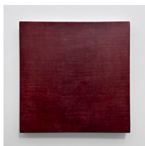
Marcia Hafif Double Glaze Painting: Cadmium Red / Payne's Grey , 2002 oil on canvas 16" x 16" HAFB17