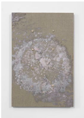
The Women (Ishiuchi Miyako. Frida by Ishiuchi #39, 2013 ), 2024 oil, silk fiber rosettes ca. 1800s on Belgian linen over aluminum panel with poplar cradle 27.75" x 18" MM116