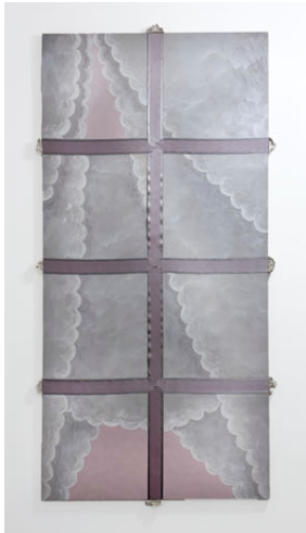
i work in a market as a checkout girl – i had a feeling that i belonged – dream girl, 2024 flashe, antique moire ribbon, porcelain, perfumed powder on Belgian linen over aluminum panel with poplar cradle 89" x 43" MM109