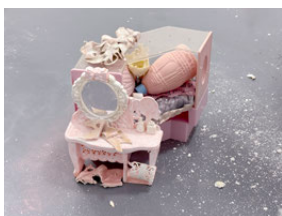
Grotto to the Romantic Avon Calling Grotto, 2024

parfait of rice flour, corn starch, silk peptide powder perfumed with compositions comprising violet, iris, carrot seed, heliotrope, rose, carnation, aldehydes, lavender maillette, peony, orange blossom, bergamot, raspberry, clove, anise, black peppercorn, pink peppercorn, cocoa, labdanum, white musks, cedar, fir balsam, palo santo, ho wood, sandalwood, leather, butter CO2, beeswax, wet clay, artemisia, elemi, basil, eucalyptus, tea tree oil, peppermint, celery seed, tonka bean, vanilla absolute, civet