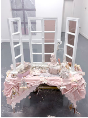
destroy, she sulked, 2024