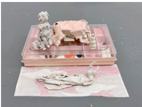
even the moon crisis makeup! is wearing makeup – naruse, 2024 porcelain, glazed stoneware, vintage kimono silk, Mary Kay consultant Glamour Shade organizer tray ca. 1985, Odette Parfum Co. bubble mailers, satin digitally printed with detail view of Joe Brainard's 'If Nancy Was a Boy,' 1972, polyfil stuffing, thread, tapered end false eyelashes on plastic backing, vintage velvet orchids, pleated and bound antique ribbon ornament 8" x 14.5" x 15" MM096