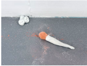
spoon woman – bourgeois (white okra), 2024 porcelain (two elements), cosmetic brush bristles, Wet n Wild blush in 'Pearlescent Pink,' kakashow blush palette 1.25" x 6" x 1.25" and 1" x 2" x 1.5" MM107