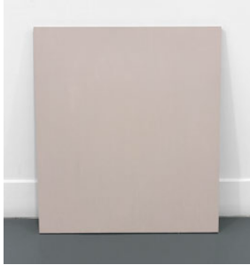
I don't dress like this because I want to look like a girl, I dress this way because I want to look like a faggot! (Sherrie Levine. Salubra 3, 2007 ) ii, 2024 oil on mahogany 27" x 24" MM114