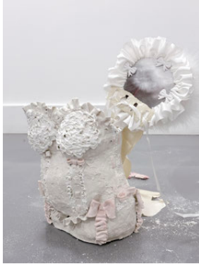
Ms. Scheherazade Dalloway-Havisham, 2024 porcelain vase 11" x 9" x 9" MM110