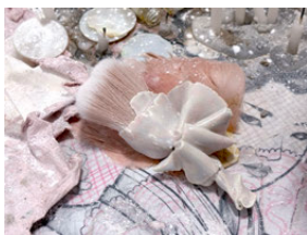
mama madame, 2024

porcelain, cosmetic brush bristles, Revlon powder blush in 'Mauvelous'