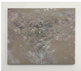
The Women (Gay Block. Untitled (Brooch), 1994), 2024 oil, costume jewelry brooches, rice powder on Belgian linen over aluminum panel with poplar cradle 20" x 24" MM093