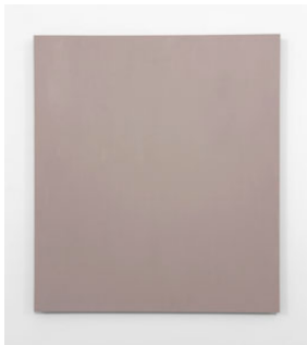
I don't dress like this because I want to look like a girl, I dress this way because I want to look like a faggot! (Sherrie Levine. Salubra 3, 2007 ), 2024 oil on mahogany 27" x 24" MM115