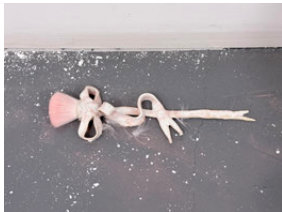
madame de..., 2024 porcelain, cosmetic brush bristles, Maybelline New York FIT ME blush in 'Mauve,' Sephora Colorful mat eyeshadow in 'Strawberry Macaron' .75" x 9.5" x 3" MM112