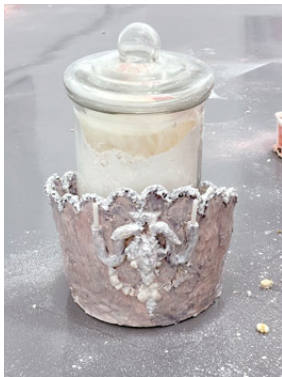
yharnam, pthumerian queen is a chalice dungeon boss, and adoration for soshiro matsubara, 2024

porcelain, glass, velvet, candles, parfum, rice flour, corn starch, silk peptide powder, lambs wool powder puff, polyfil, waxed thread