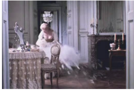
The Horizontal Mourners , 2007, recreated 2024 video, 2 min 54 sec. edition of 3 + AP MM118