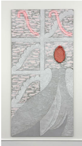
this is what makes us girls – white witch, 2024 flashe, antique silk appliqué on Belgian linen over aluminum panel with poplar cradle 89" x 43" MM108