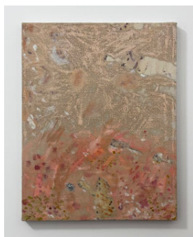
Mari Eastman Pink Kitty Cats , 2018 oil and pen on bleached linen 20" x 16" ME042