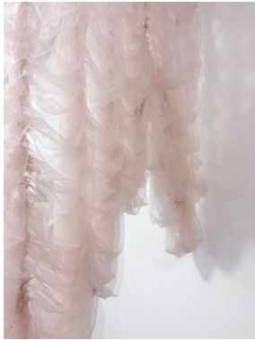
levee, 2024 ruched curtain of tulle netting with satin ribbon cords MM094