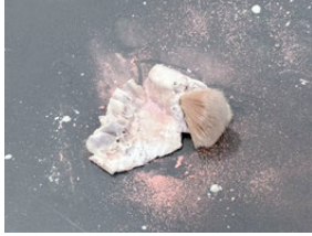
she's a fantasist you know. that lady. hotel lobbies are full of them – duelle, 2024 porcelain, cosmetic brush bristles, BBIA powder cheek in 'Powder Pink,' Etat Libre d'Orange Putain de Palaces eau de parfum 1" x 3.5" x 3.5" MM106