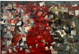
Untitled, 2018 Acrylic, wax, paper and photos on canvas 40 x 60 cm