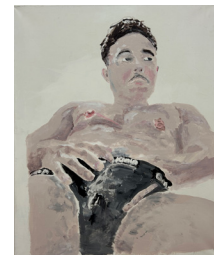
Oliver Front Jockstrap , 2022 Acrylic on canvas 100 x 80 cm