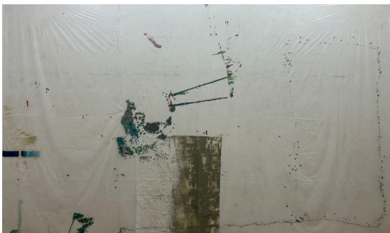
Untitled, 2019 Acrylic, wax and tape on plastic 297 x 500 cm