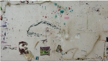
Untitled, 2021 Acrylic, glue, napkins and photo on fabric 165 x 290 cm