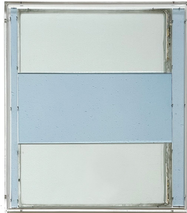
The space you take 08, 2024

Recycled glass, blue glass, hooks, wooden back, plexiglass frame 16 1/4 x 14 1/4 in. 41 x 36 cm.