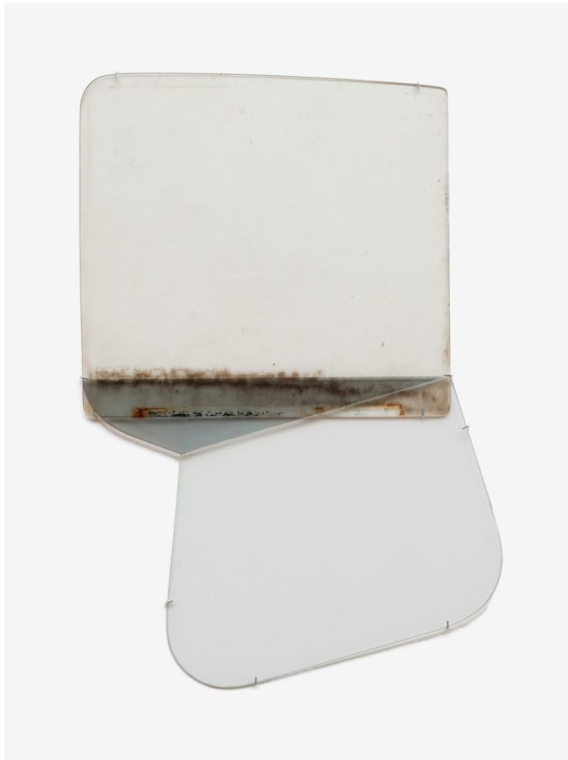
Again 02, 2024 Car pane, glass panes, hooks, glue 27 1/2 x 18 1/2 in. 70 x 47 cm.