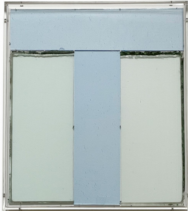
The space you take 07, 2024

Recycled glass, blue glass, hooks, wooden back, plexiglass frame 16 1/4 x 14 1/4 in. 41 x 36 cm.