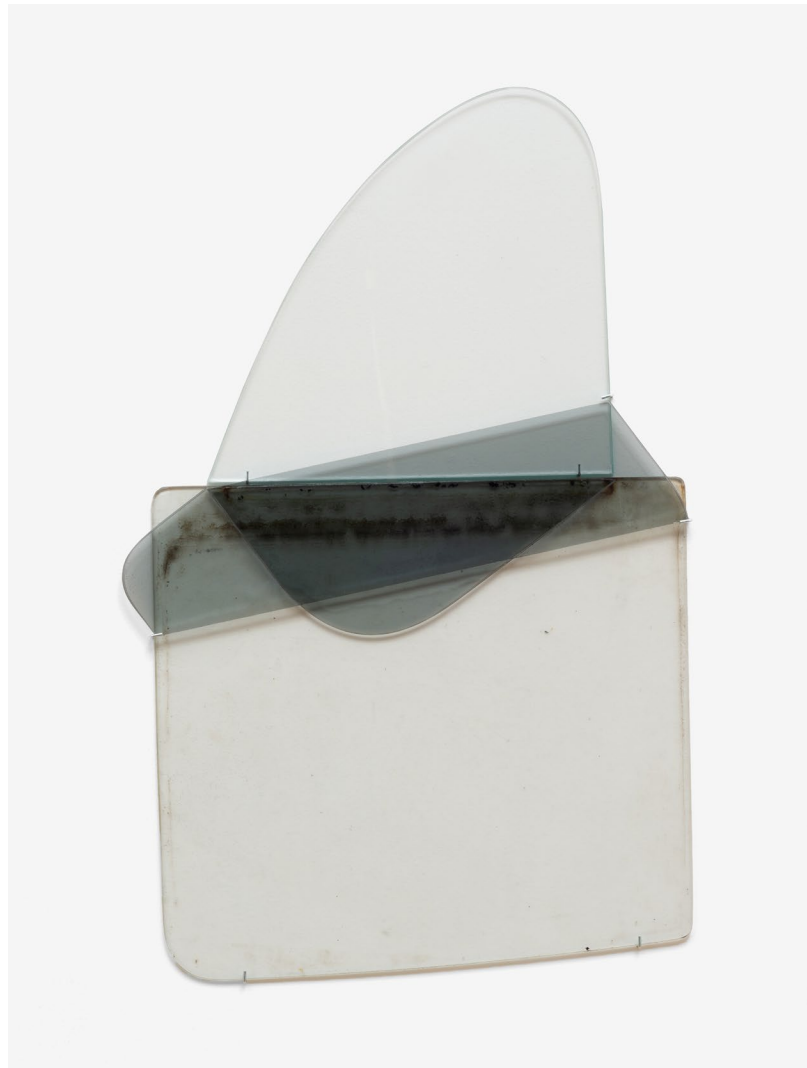
Again 01, 2024 Car pane, glass panes, hooks, glue 28 x 17 1/4 in. 71 x 44 cm.