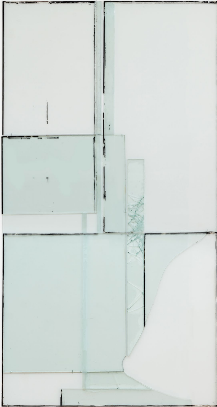
Beyond purpose 02, 2024 Recycled glass panes, hooks, glue 84 3/4 x 45 in. 215 x 114 cm.