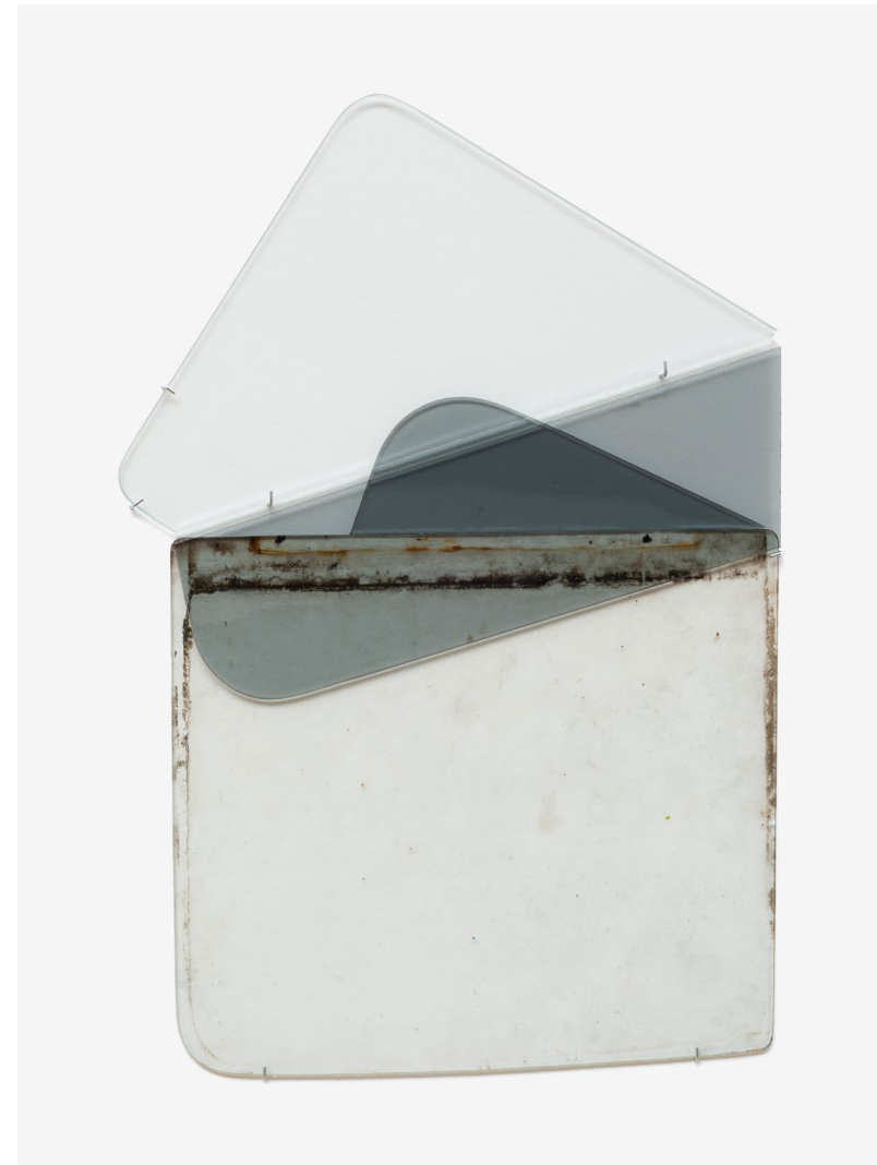
Again 03, 2024 Car pane, glass panes, hooks, glue 27 1/2 x 18 in. 70 x 46 cm.